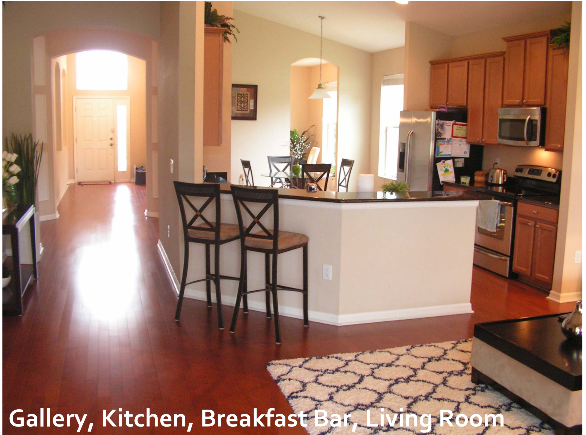
Gallery, Kitchen, Breakfast Bar, Living Room