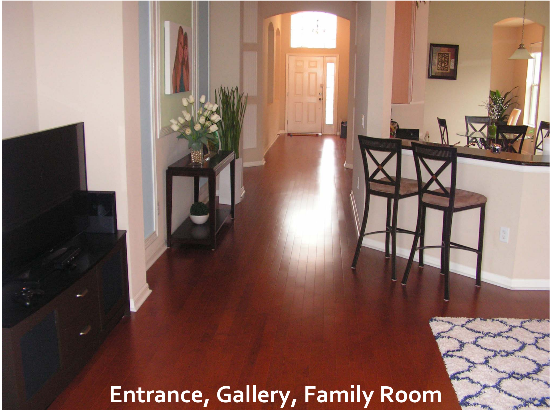
Entrance, Gallery, Family Room