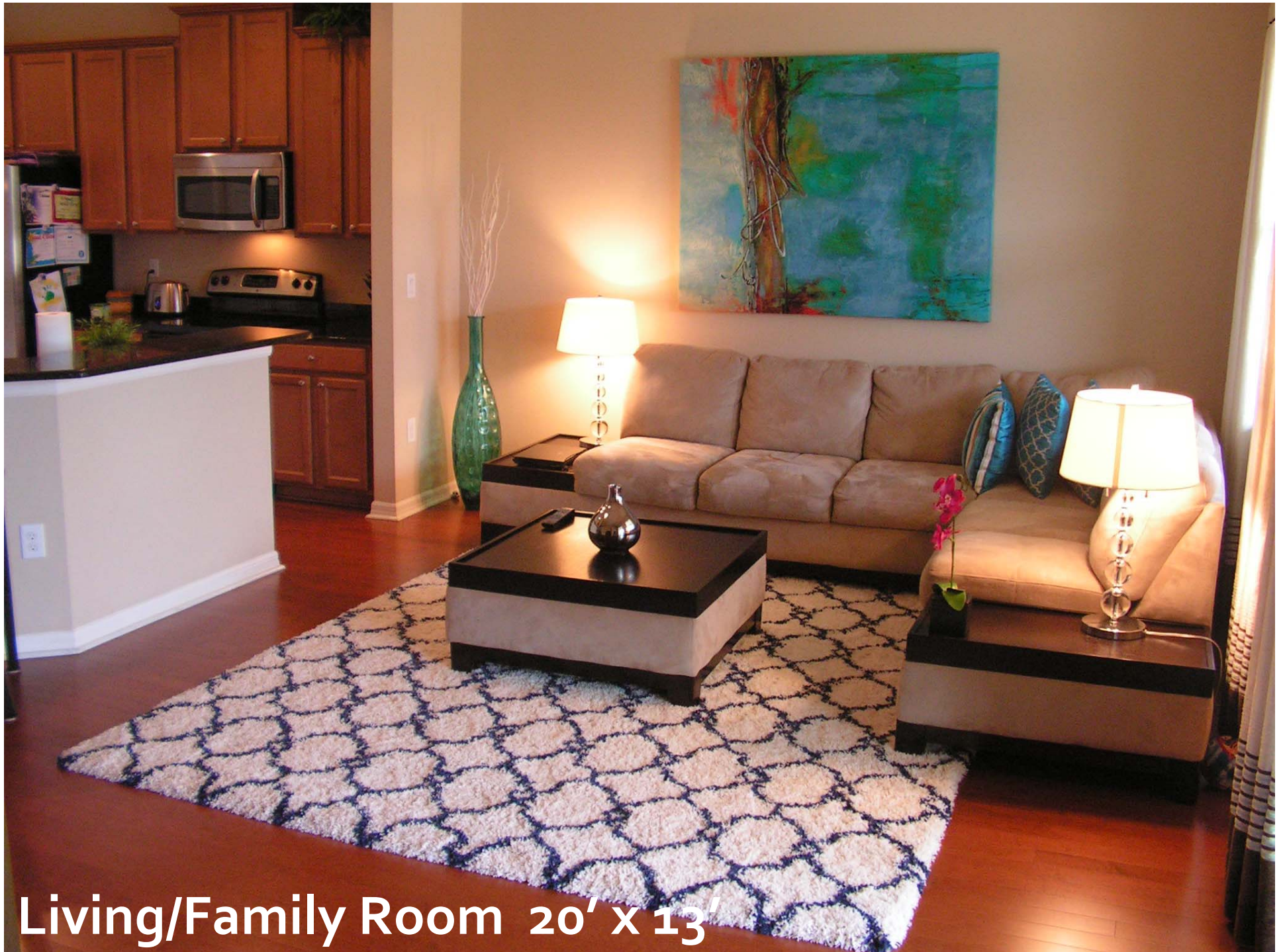
Living/Family Room 20' x 13'