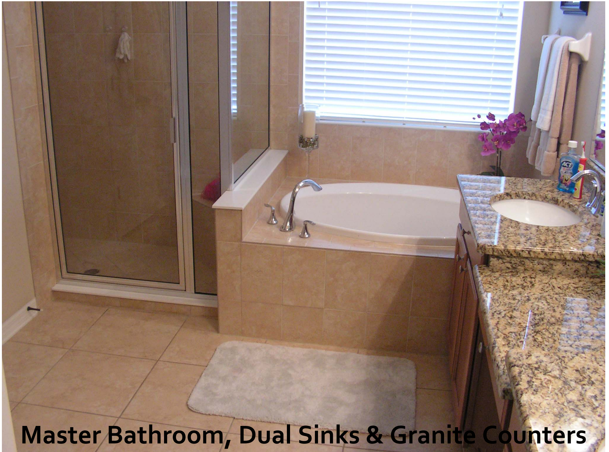
Master Bathroom, Dual Sinks & Granite Counters