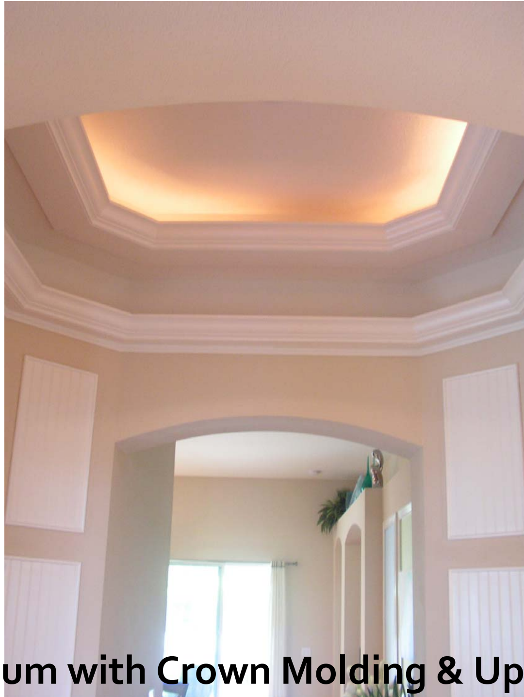
Rotundum with Crown Molding & Up-lighting