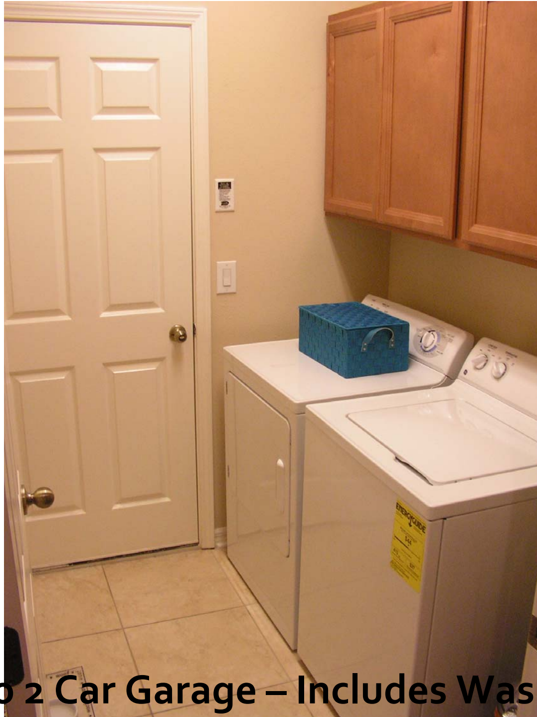
Laundry to 2 Car Garage – Includes Washer, Dryer