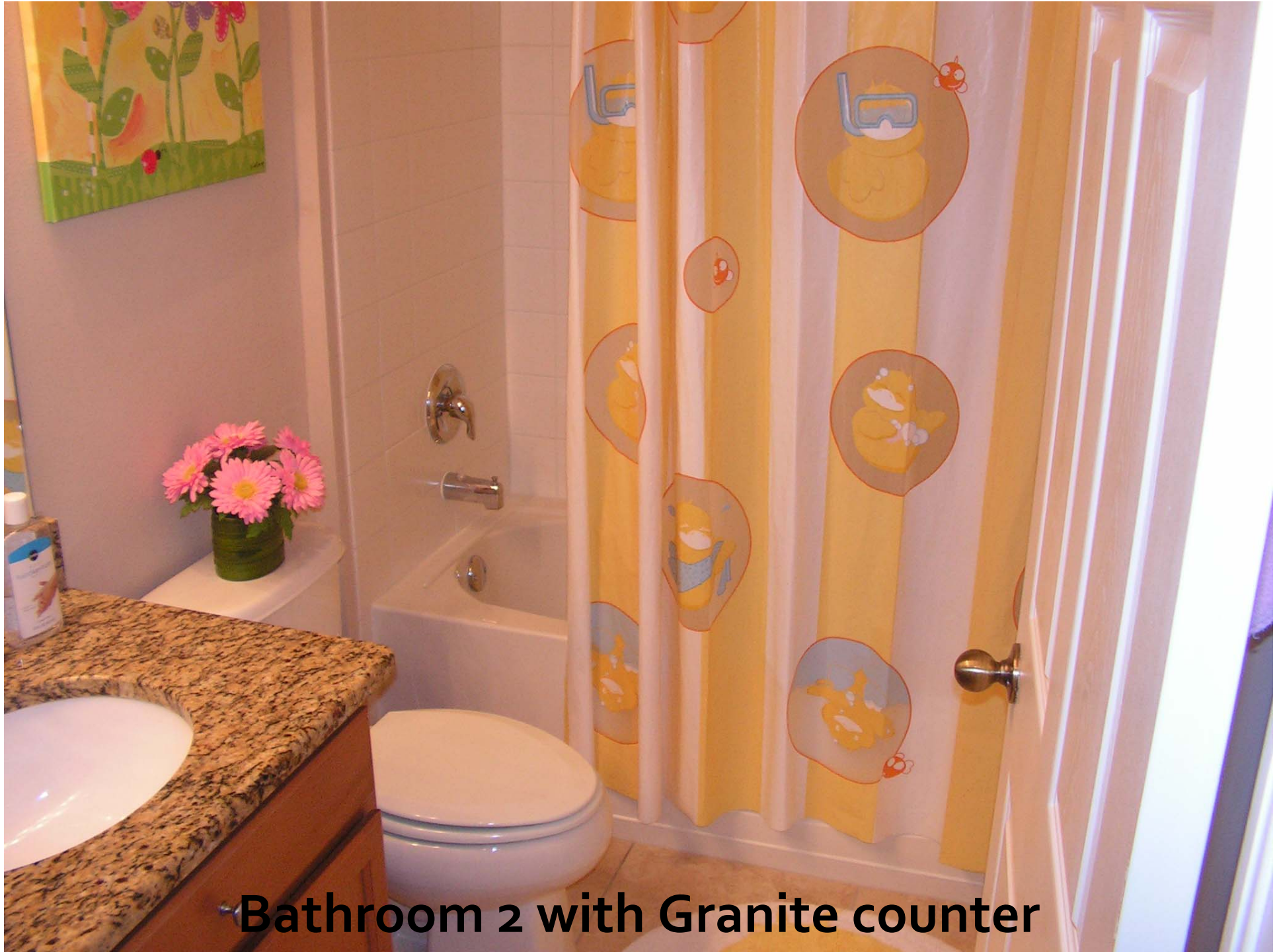
Bathroom 2 with Granite counter