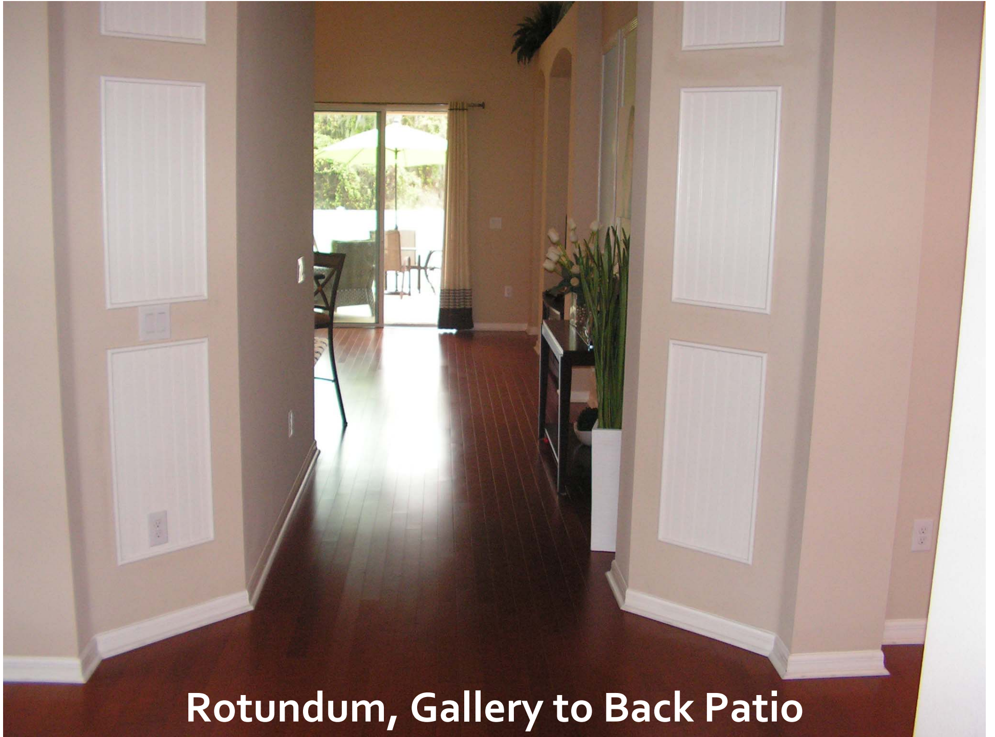
Rotundum, Gallery to Back Patio