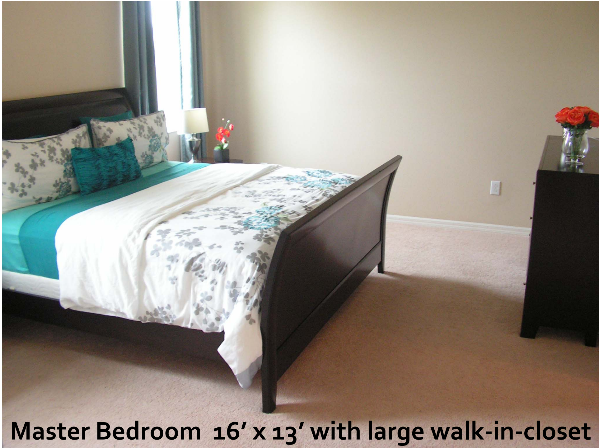
Master Bedroom 16' x 13' with large walk-in-closet