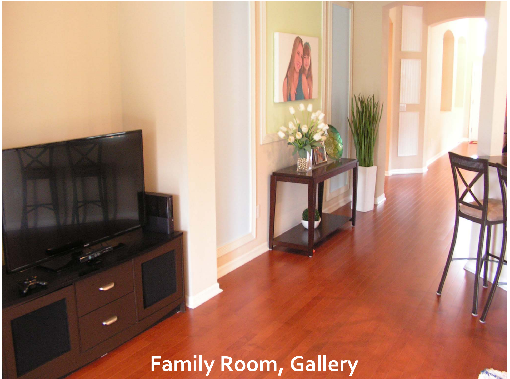
Family Room, Gallery