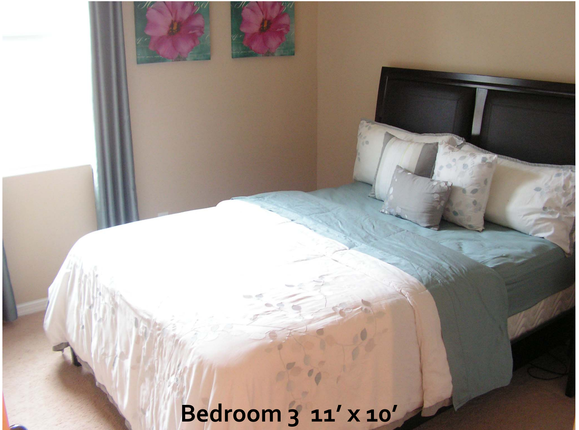
Bedroom 3 11' x 10'