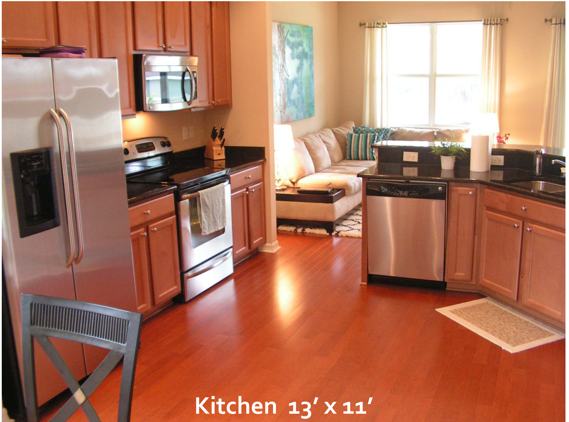
Kitchen 13' x 11'