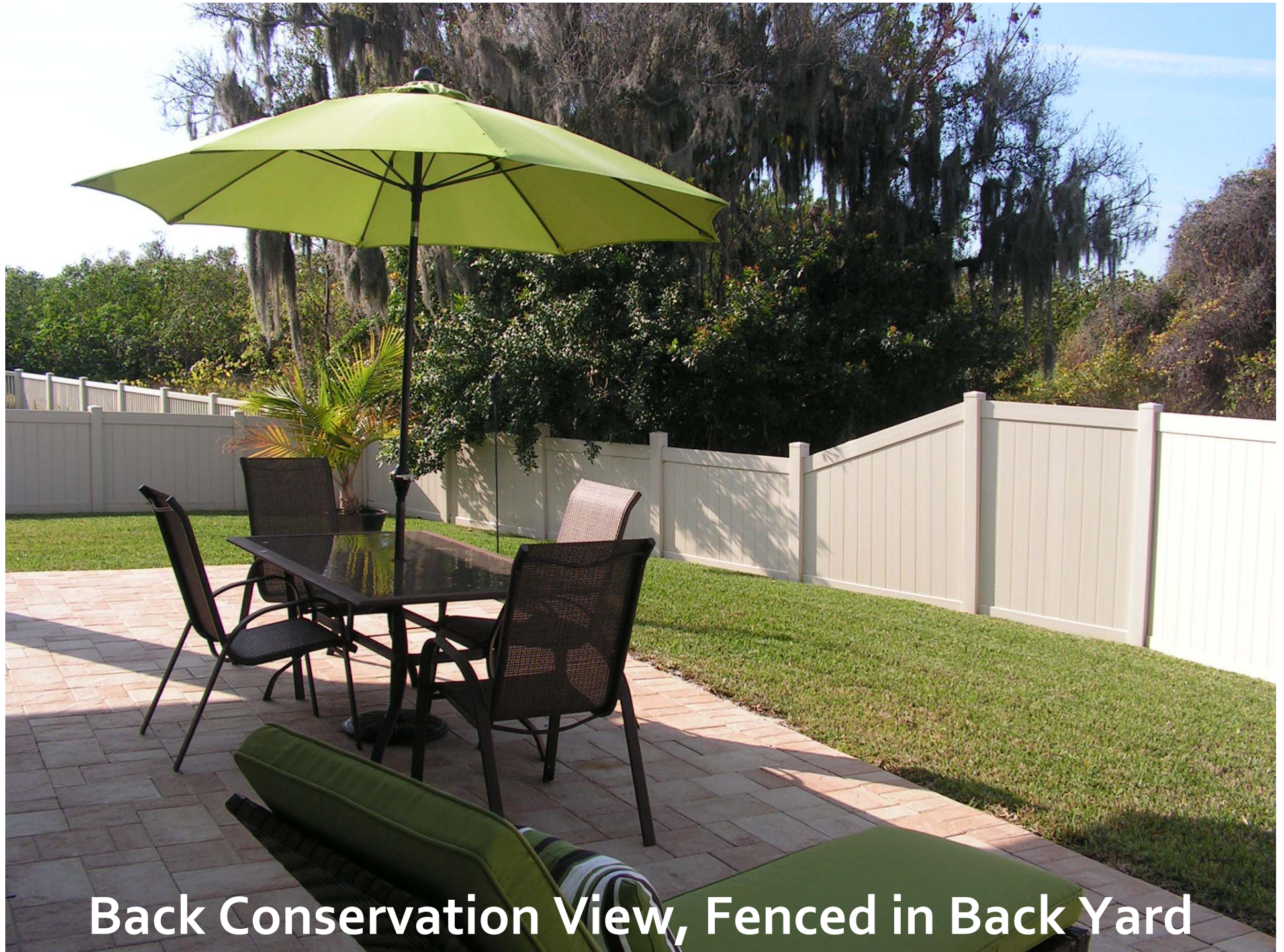
Back Conservation View, Fenced in Back Yard