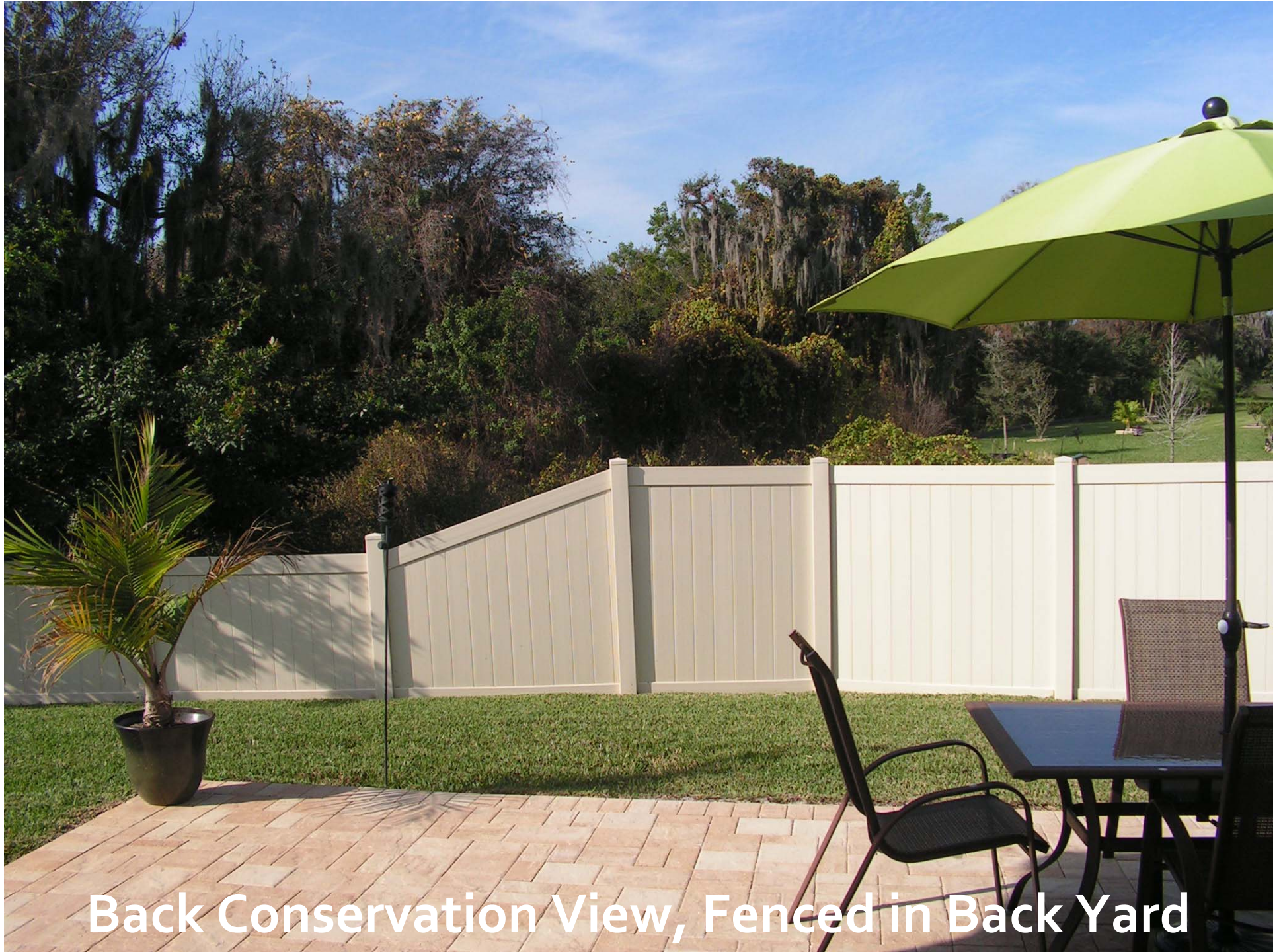
Back Conservation View, Fenced in Back Yard