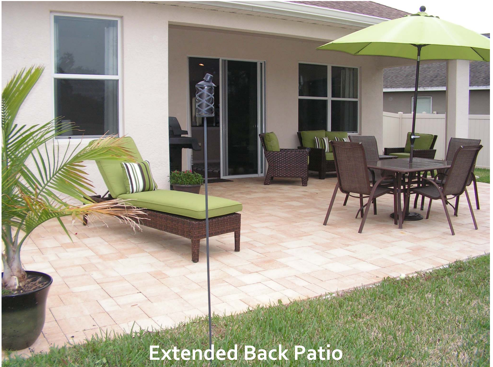
Extended Back Patio