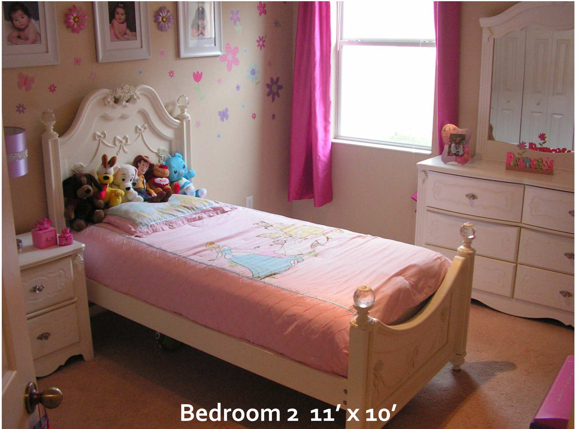
Bedroom 2 11' x 10'