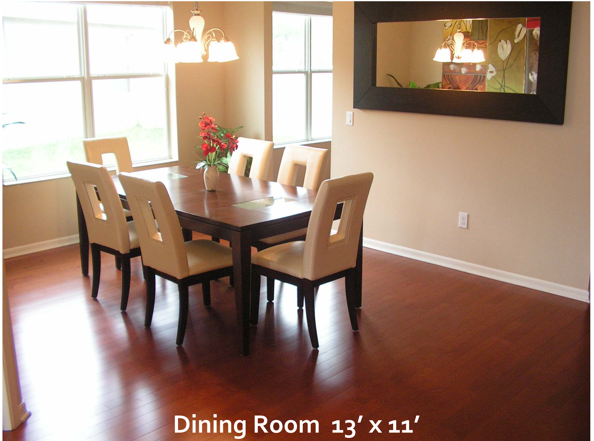
Dining Room 13' x 11'