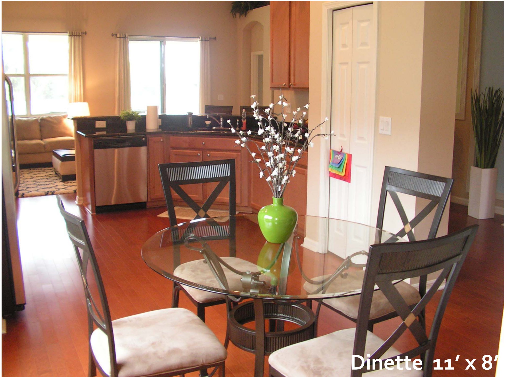
Dinette 11' x 8'