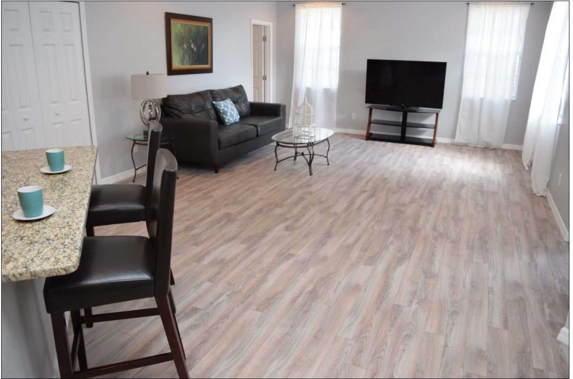
Open Plan Family Room off Kitchen 20' x 17'