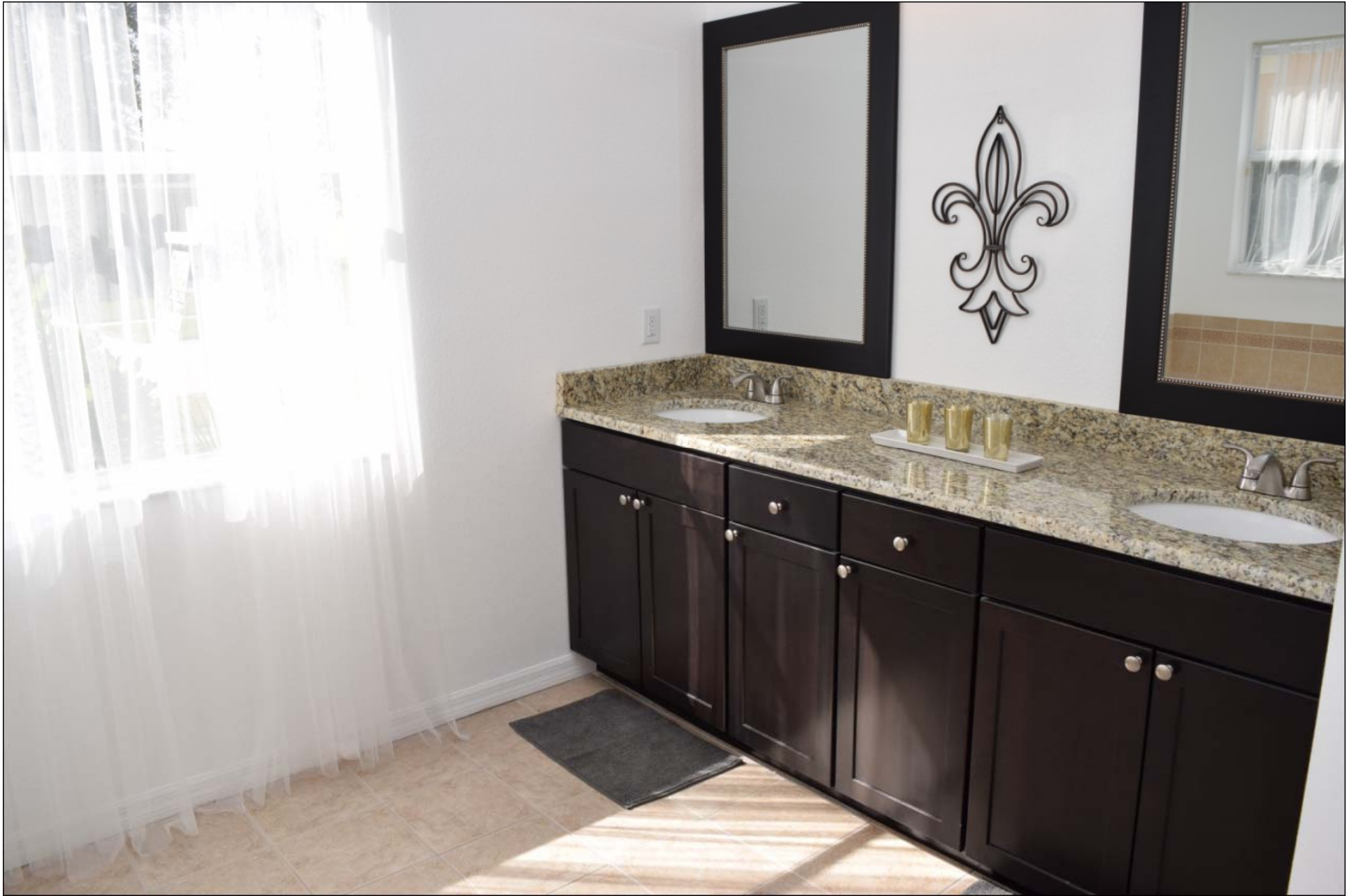
Master Bathroom w/ dual sinks, garden tub, shower & W.C.