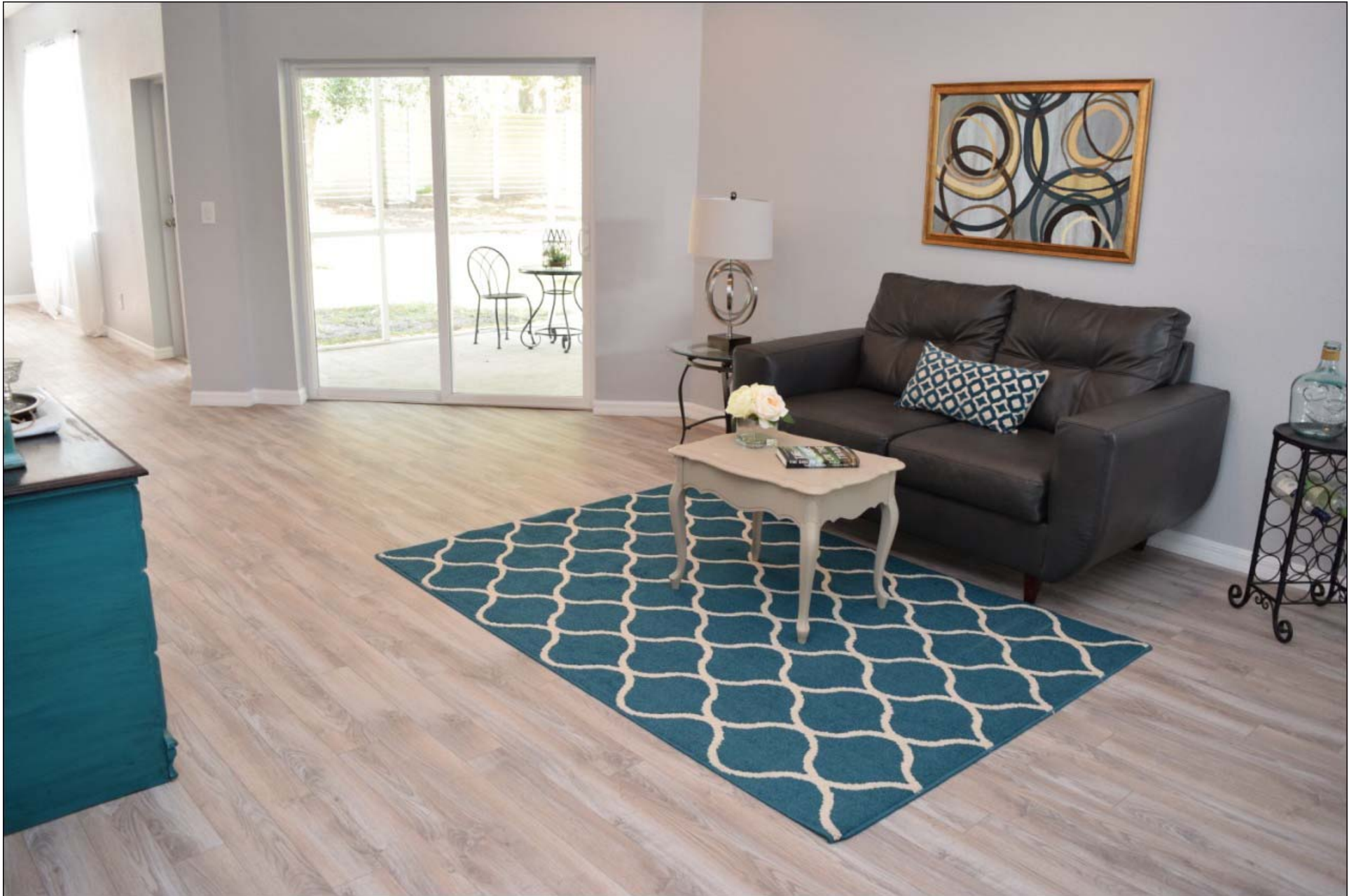
Formal Living Room 16' x 13'