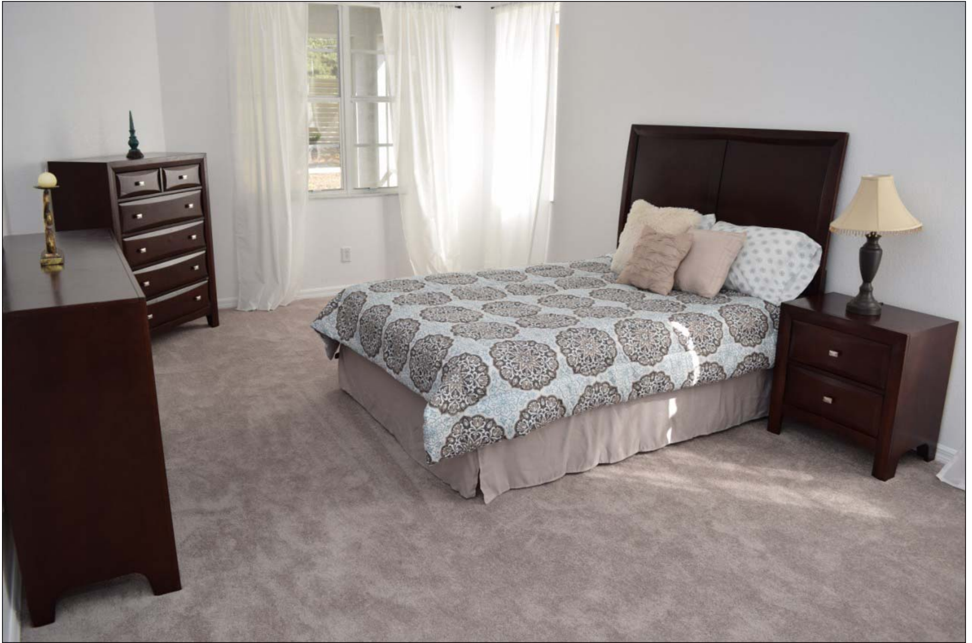
Large Master Bedroom 20' x 13'