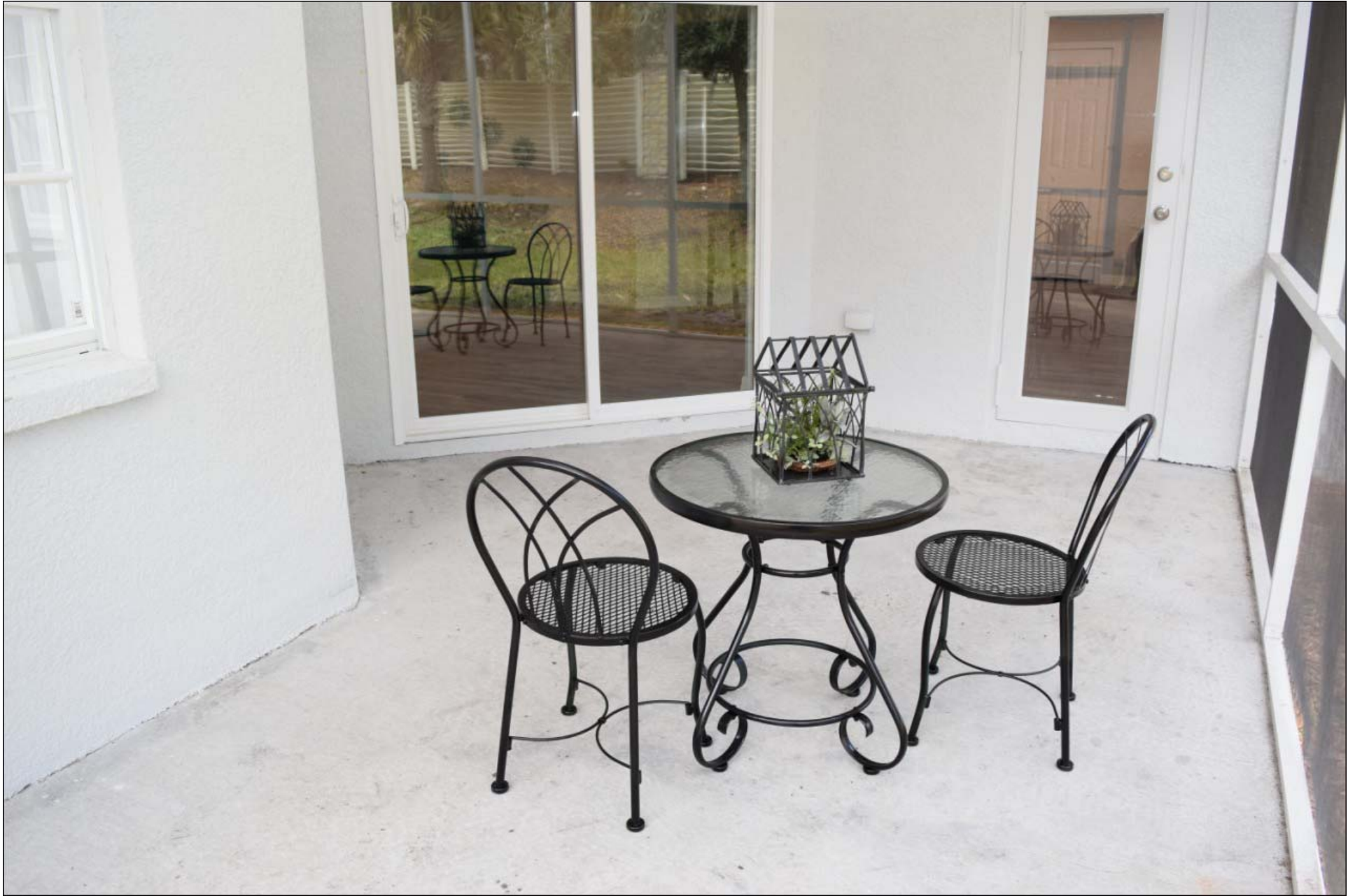
Screened in Back Patio with sliding doors