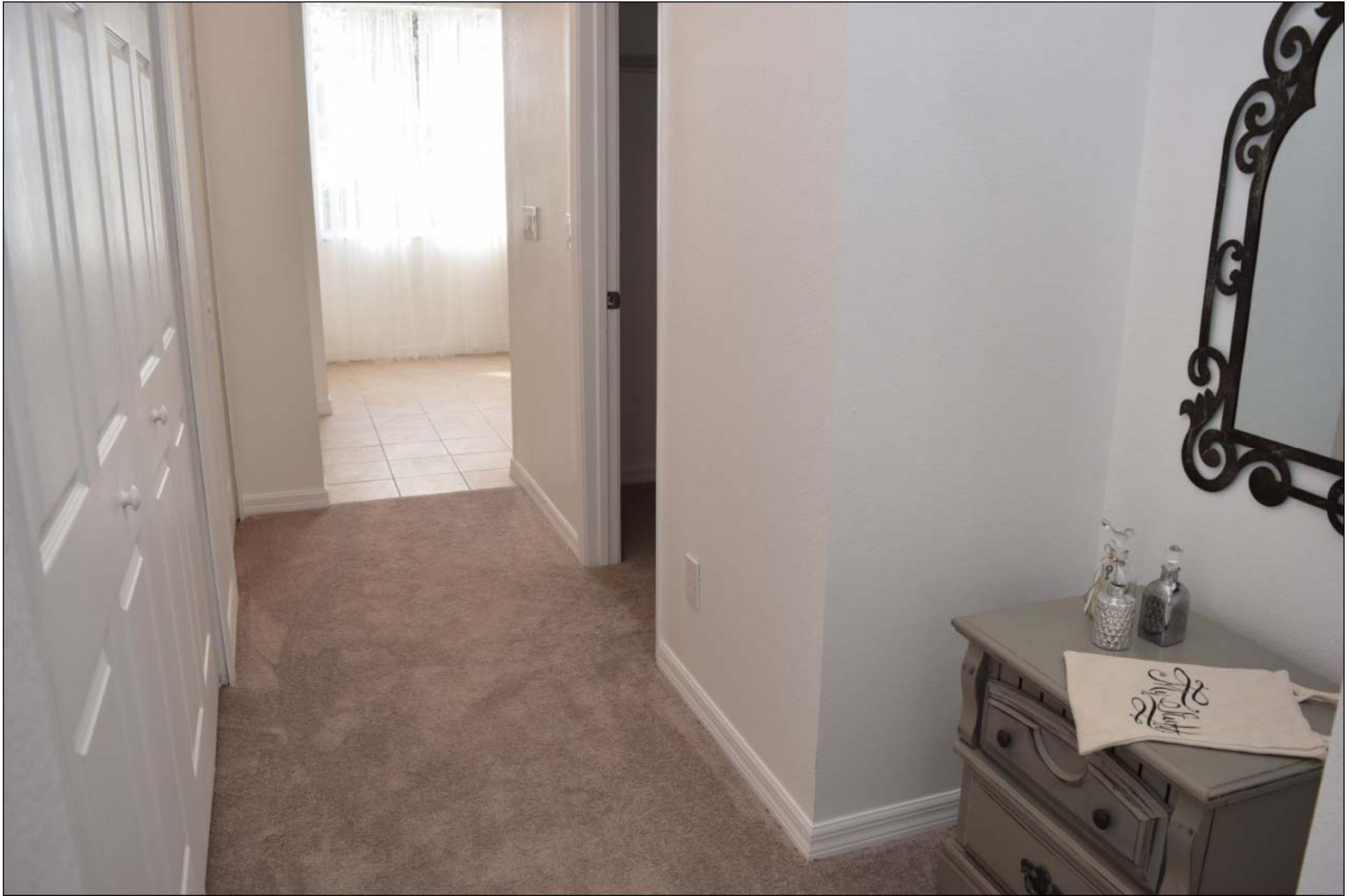
Large Master Bedroom w/ his closet & her large walk-in-closet