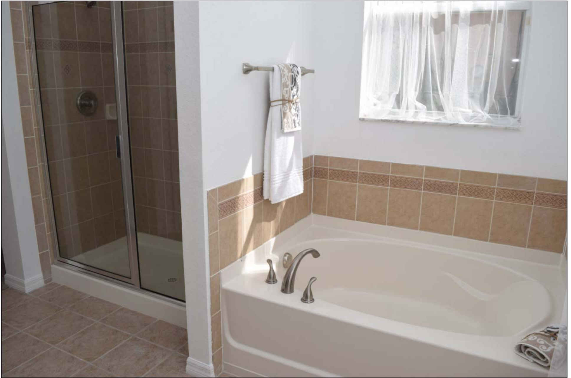
Master Bathroom w/ dual sinks, garden tub, shower & W.C.