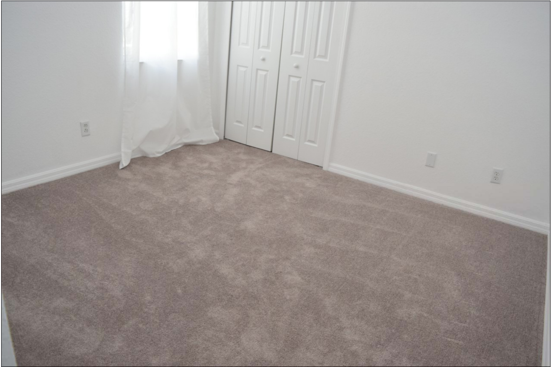
Bedroom 3 – 12' x 11'