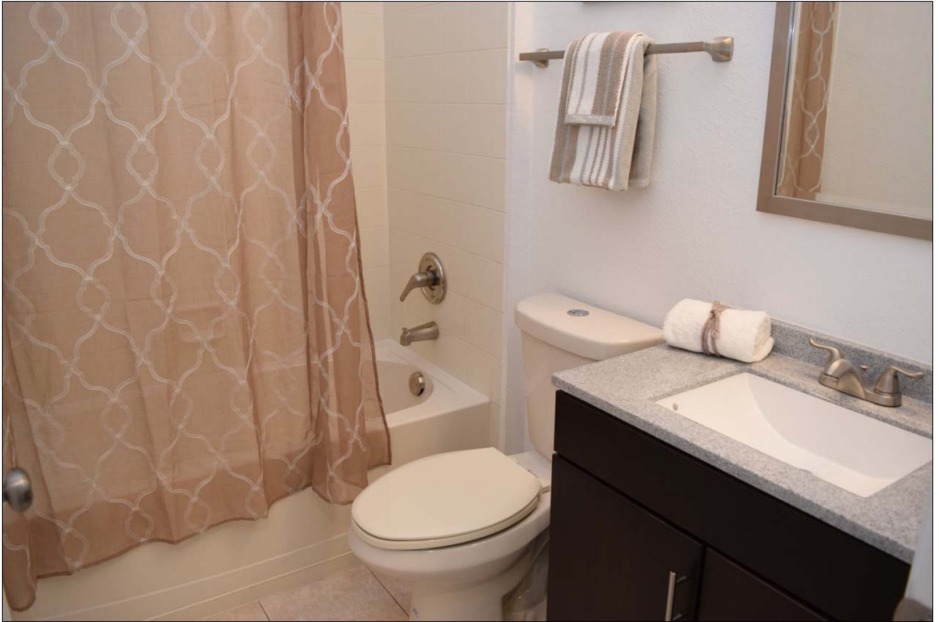
Bathroom 2 between Bedrooms 2 & 3