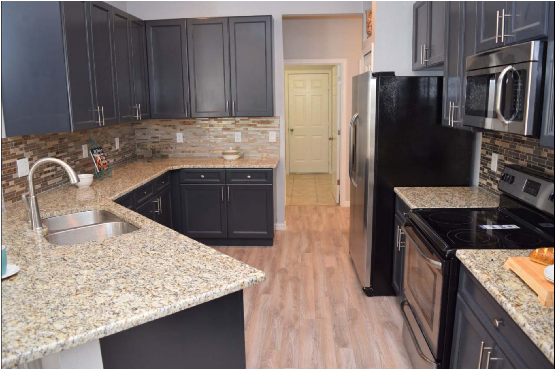
Kitchen w/ Granite & integrated stainless steel sink 16' x 11'