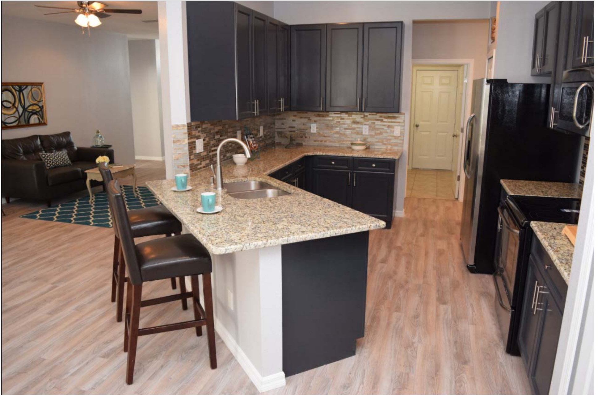
Kitchen w/ Granite, Backsplash & Breakfast Bar 16' x 11'