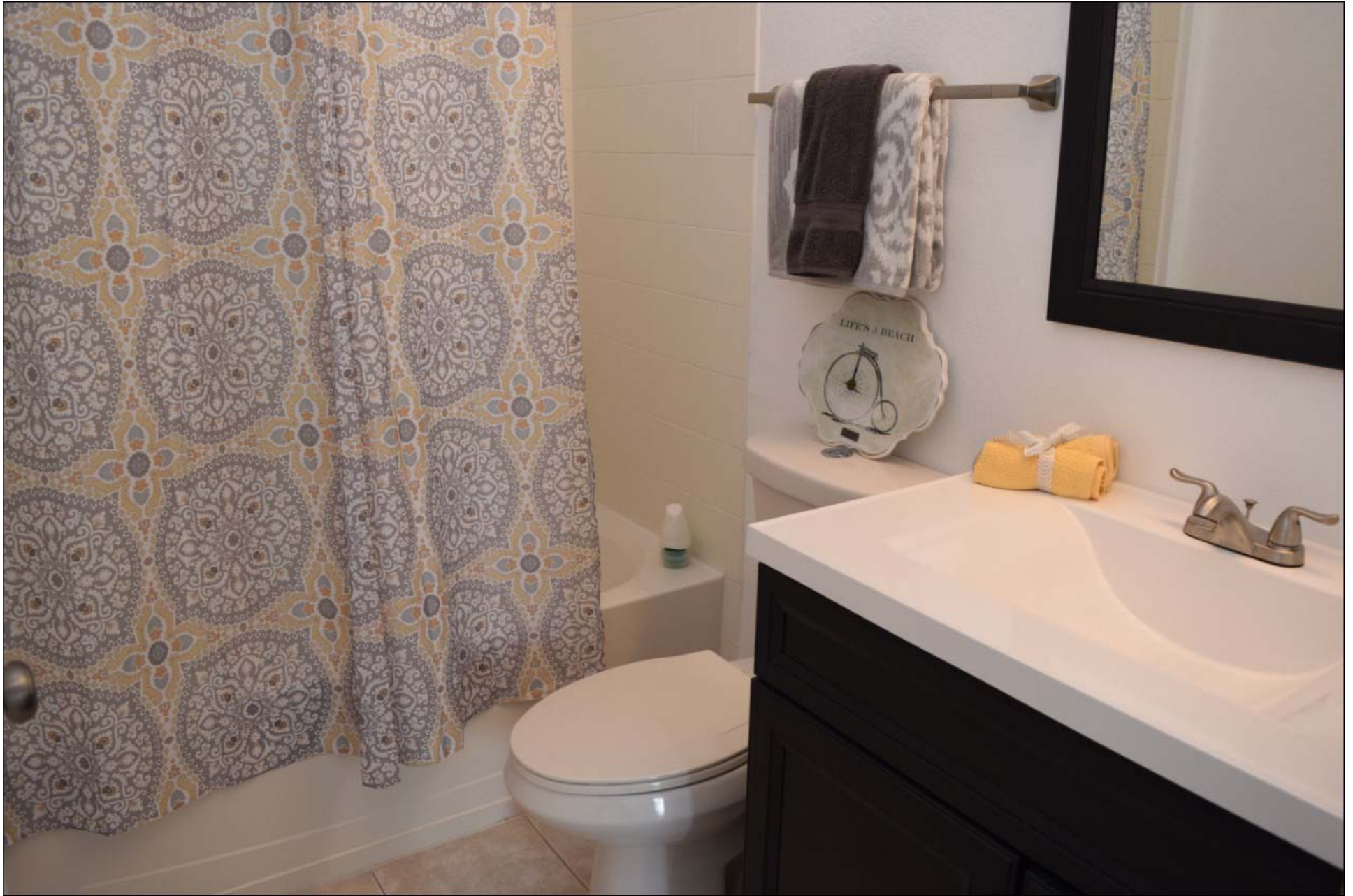
Private Bathroom 3 for Bedroom 4