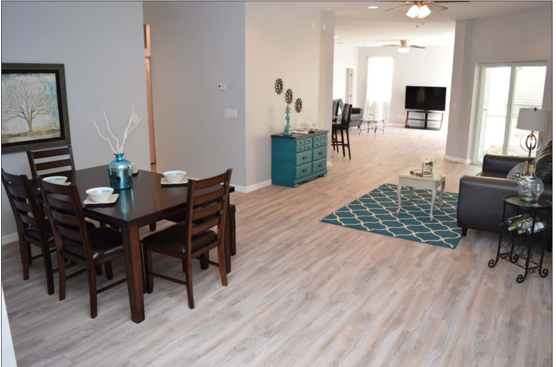
Formal Living Room 16' x 13'