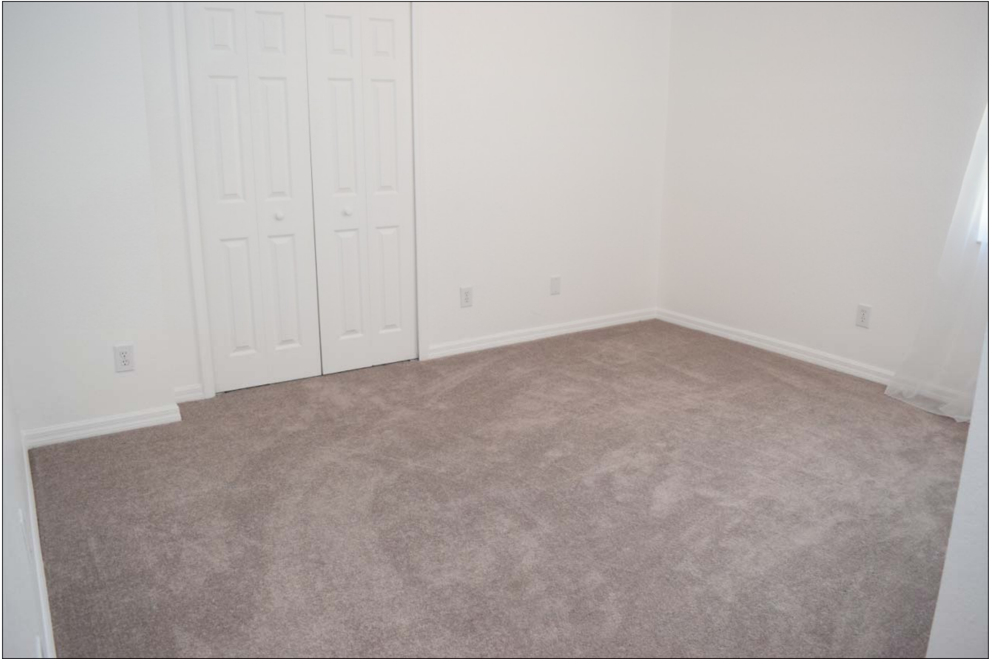
Bedroom 4 is a private Guest Suite – 14' x 11'