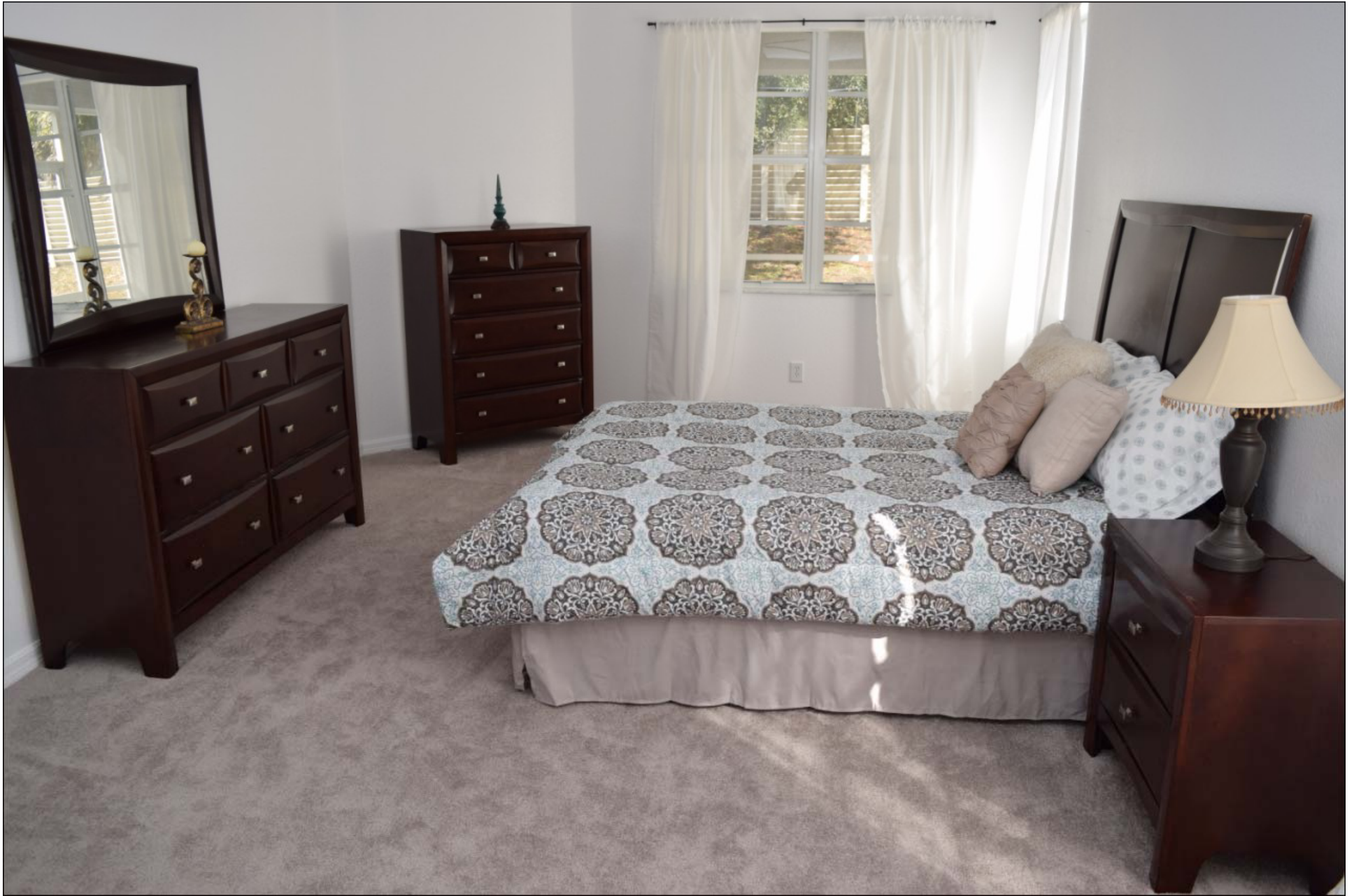
Large Master Bedroom 20' x 13'