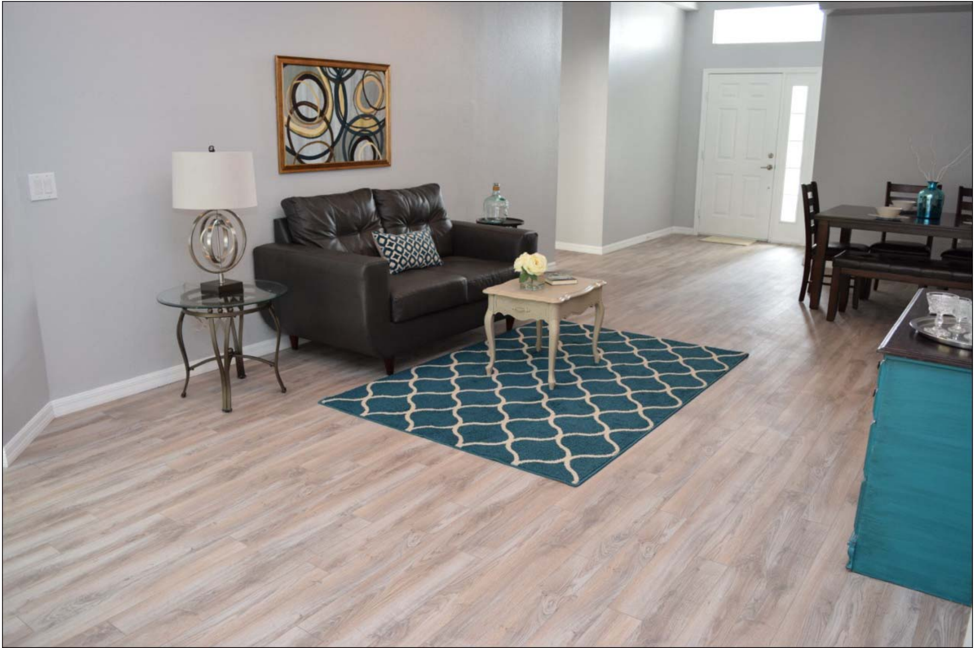
Formal Living Room 16' x 13'