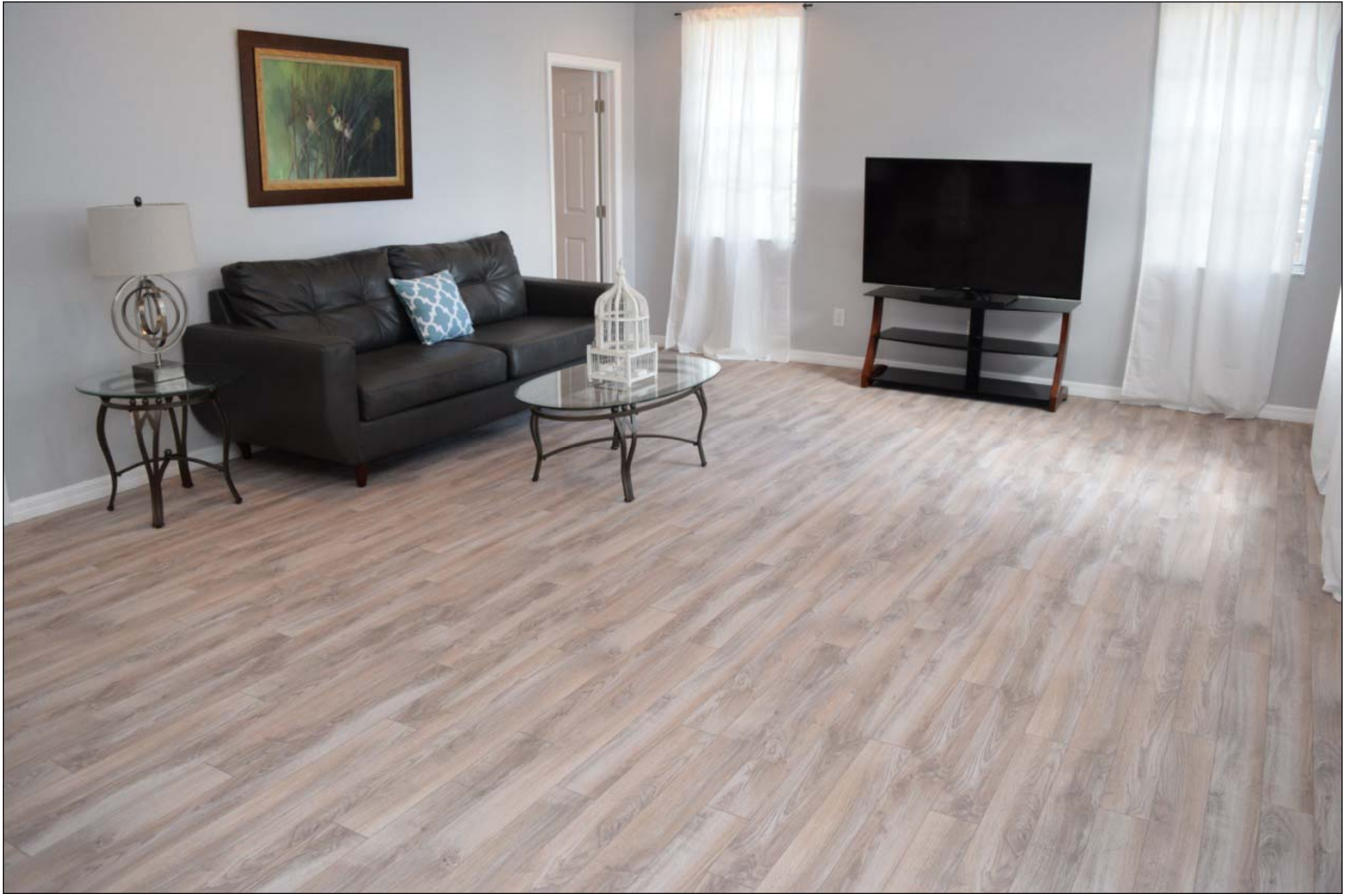
Open Plan Family Room off Kitchen 20' x 17'