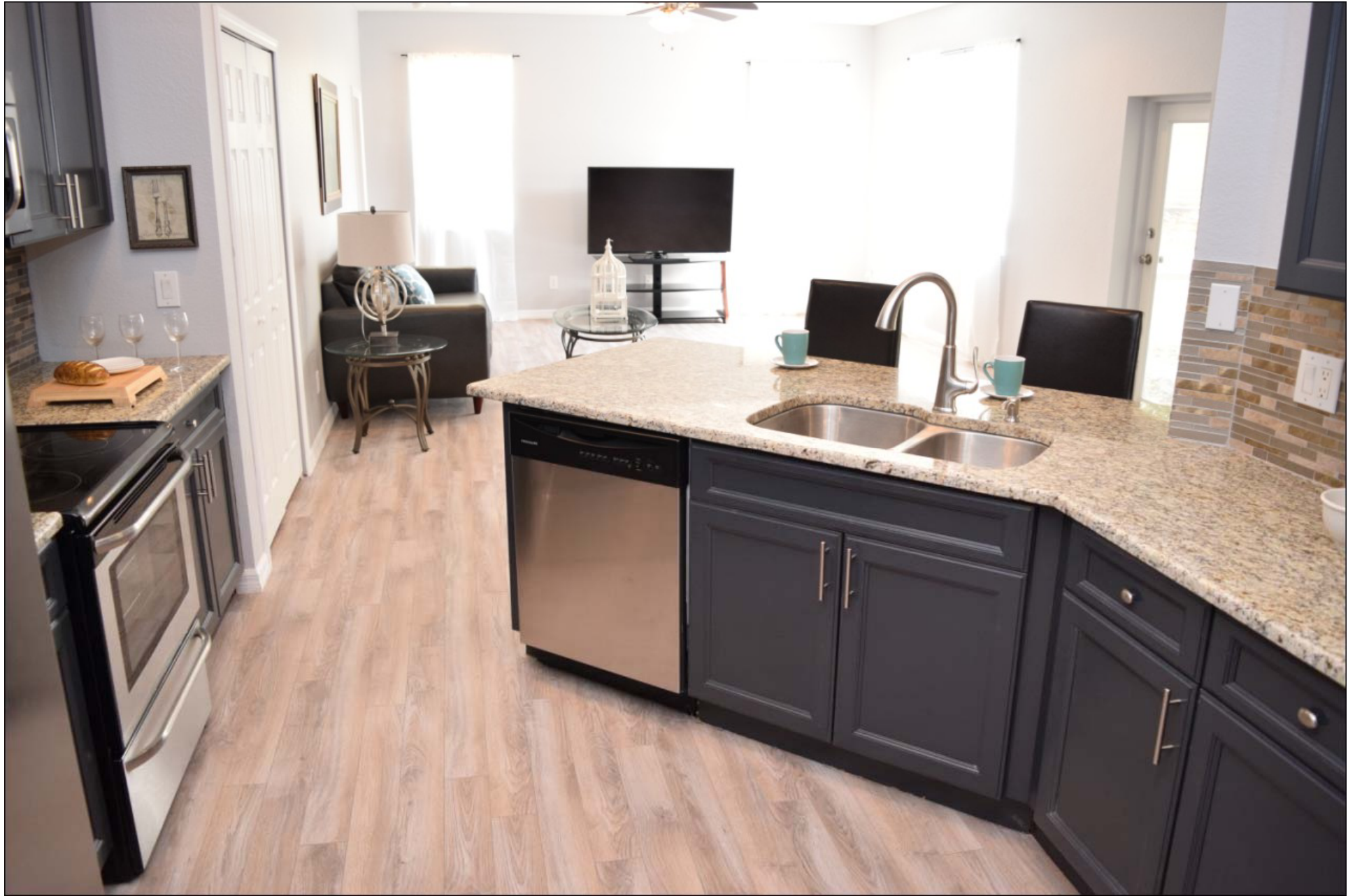
Open Plan Kitchen onto Family Room 16' x 11'