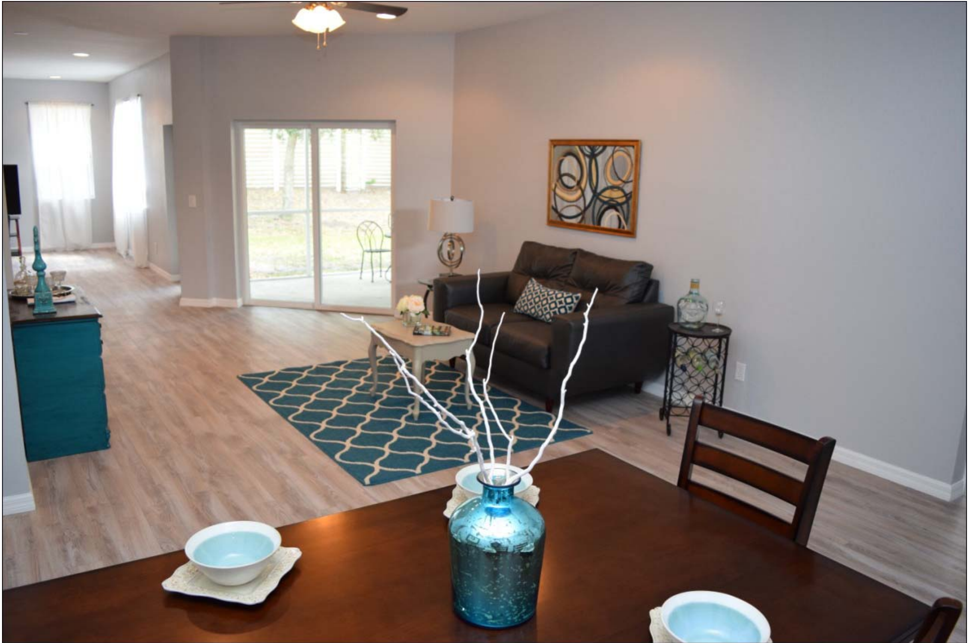
Dining Room off Kitchen 13' x 12'