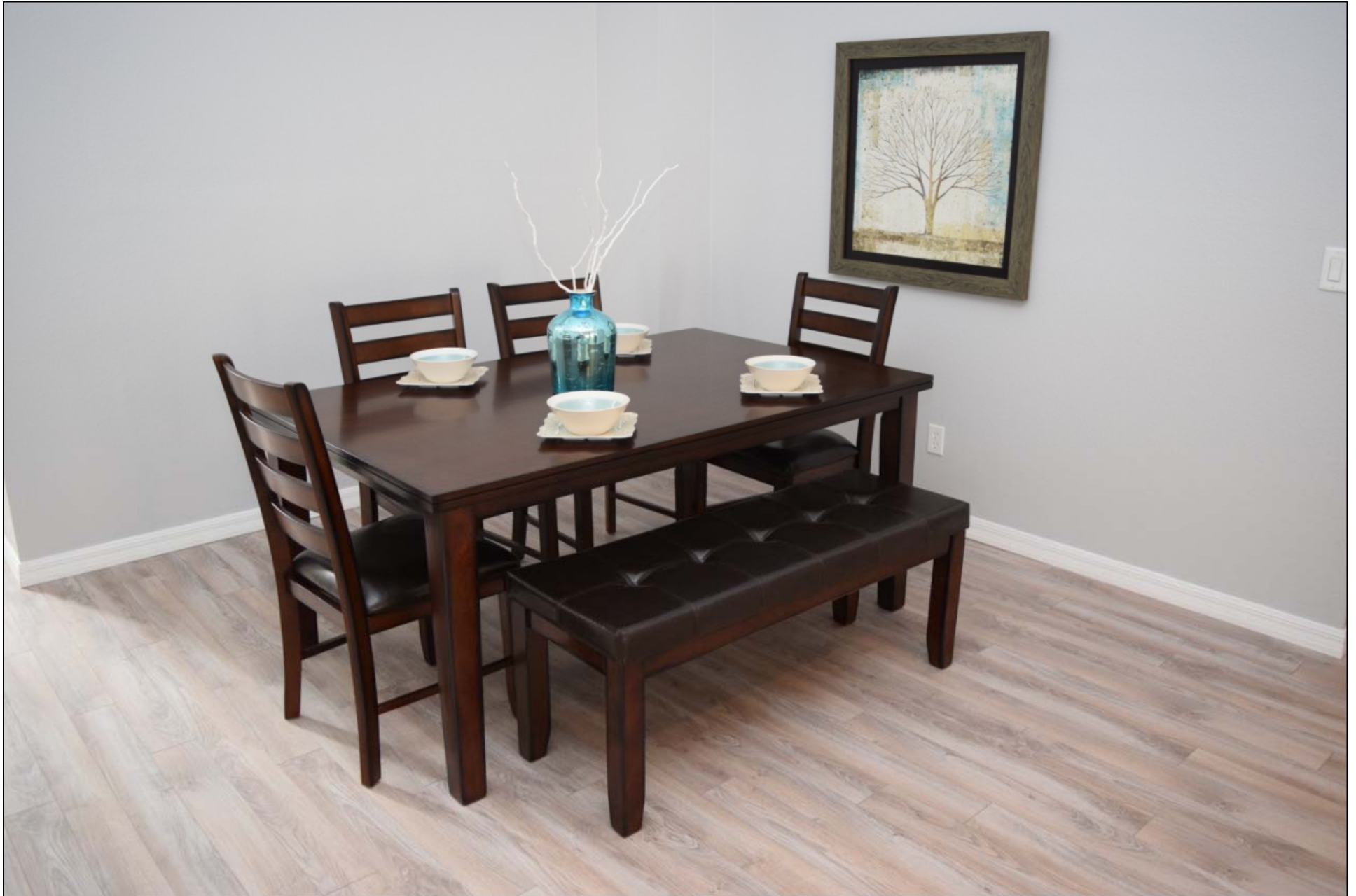
Dining Room off Kitchen 13' x 12'