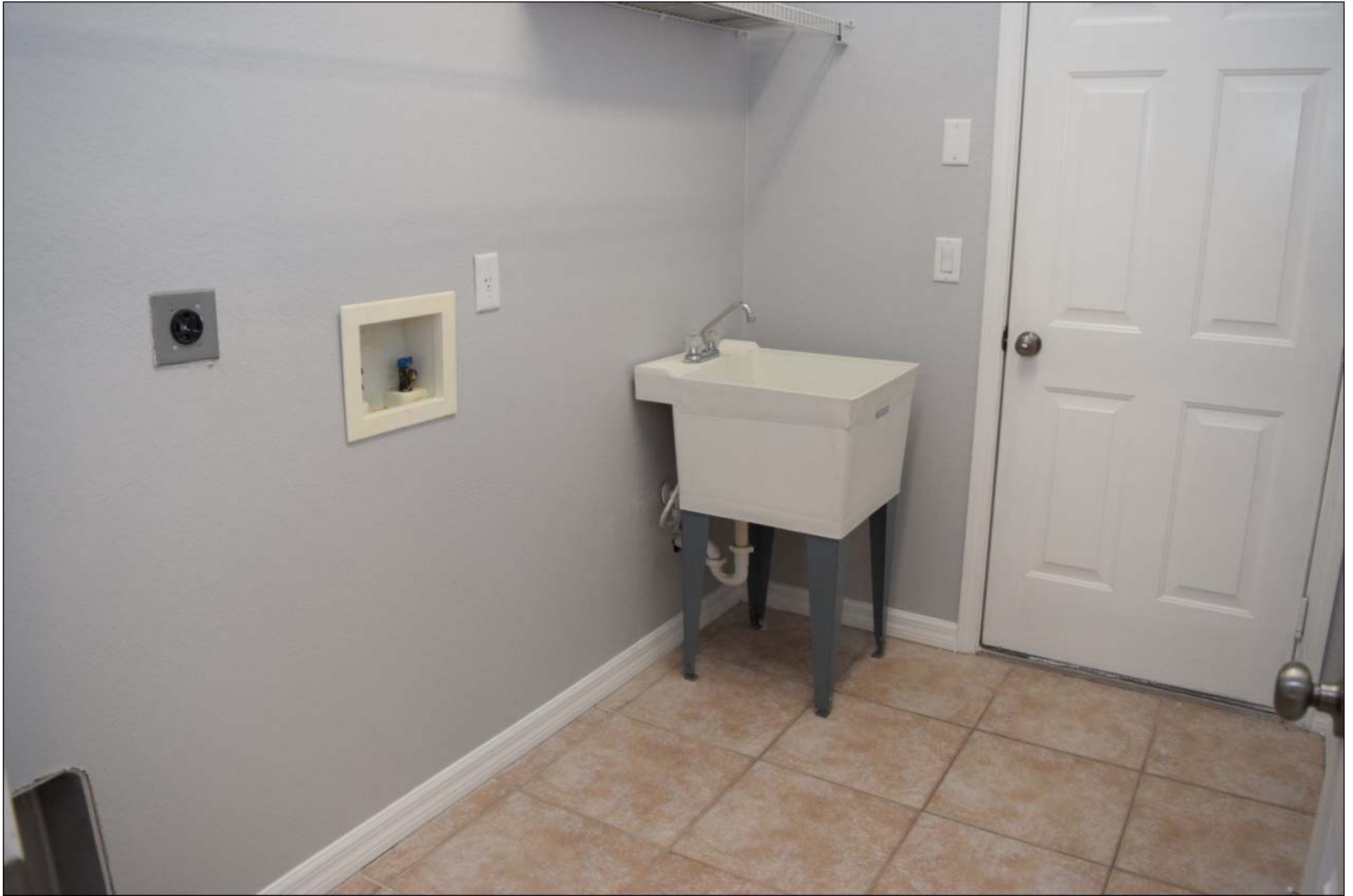
Laundry with wash tub