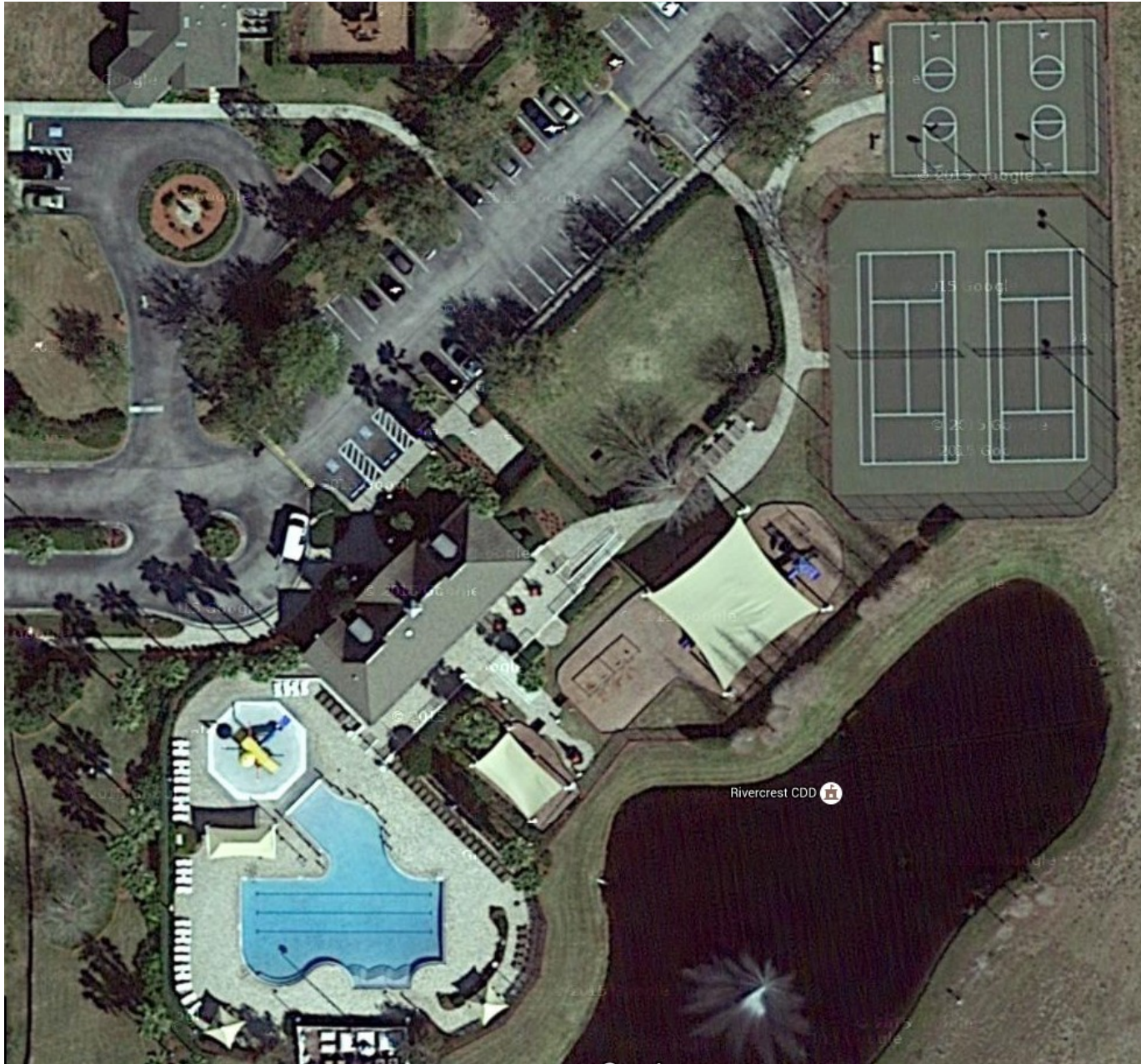
Pools, Hot Tub, Clubhouse, Tennis, Basketball, Playground