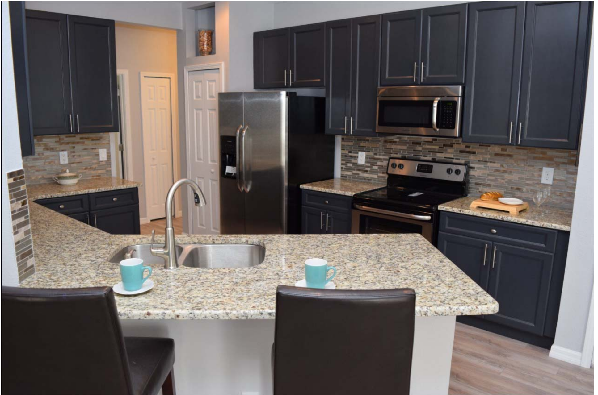
Kitchen w/ matching stainless steel appliances 16' x 11'