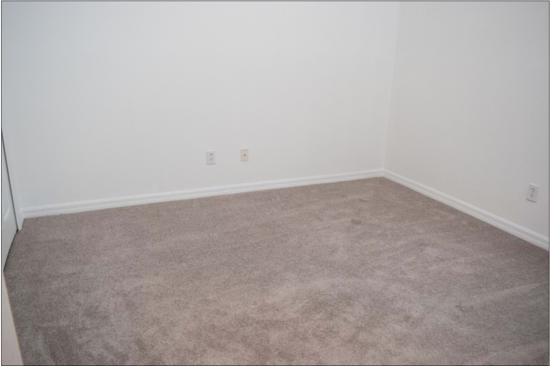
Bedroom 2 – 12' x 12'