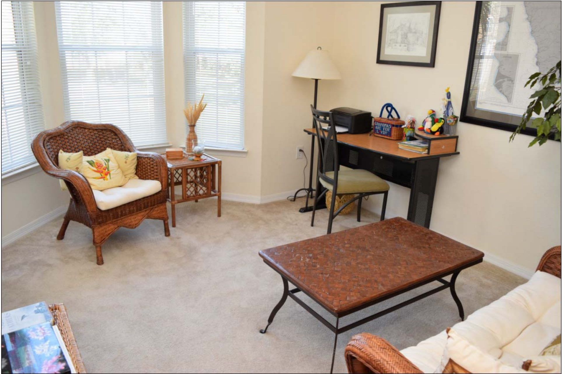
Bedroom 3 or Office with Bay Window & Pond View – 11' x 10'