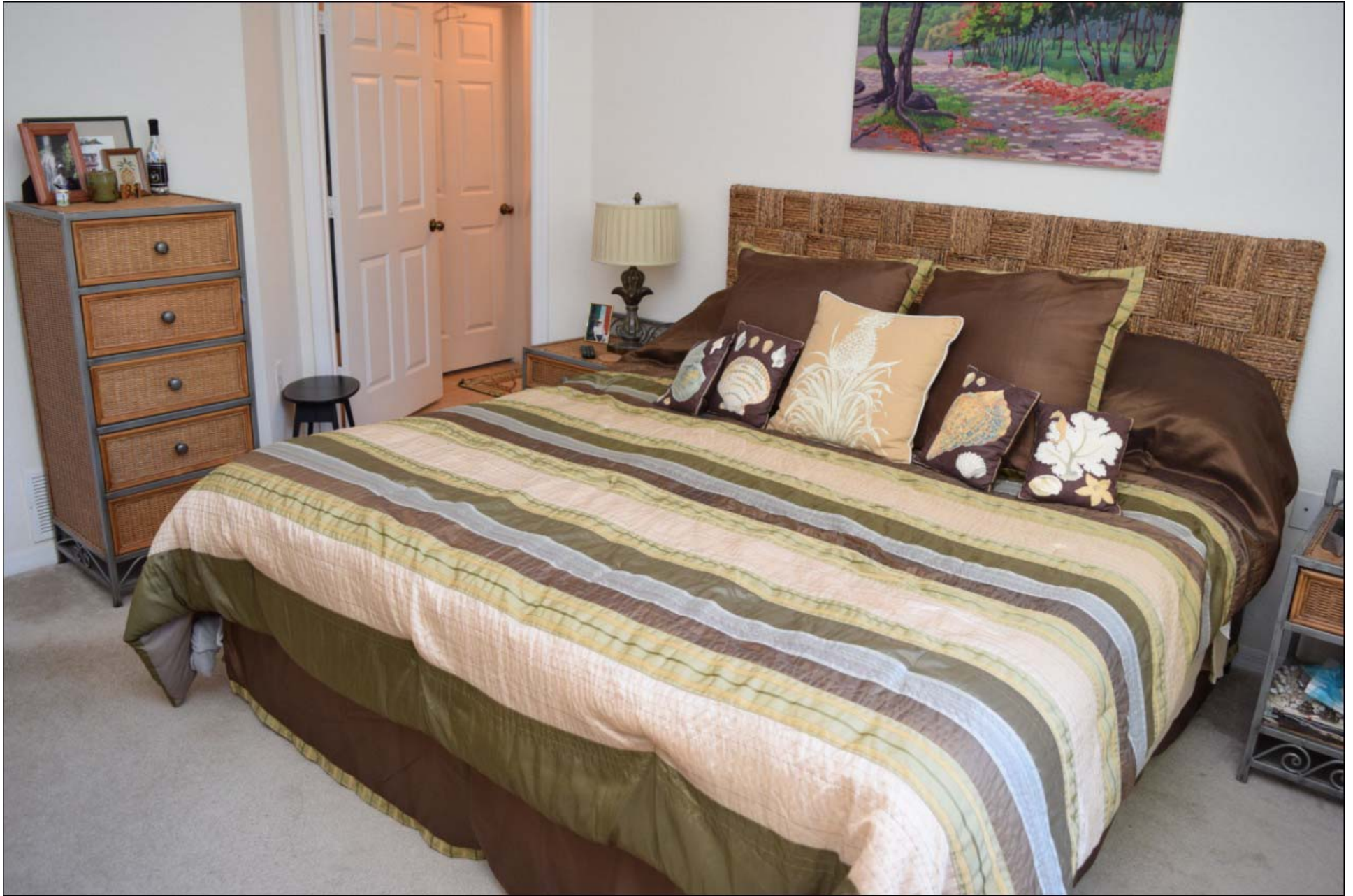
Master Bedroom onto Master Bathroom