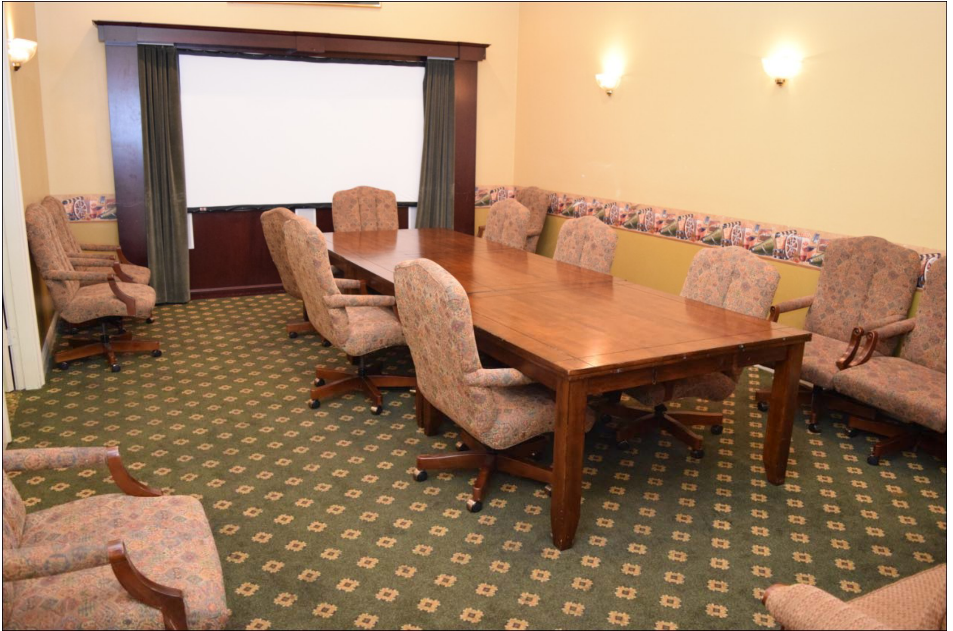
Clubhouse Multi-Media Conference Room