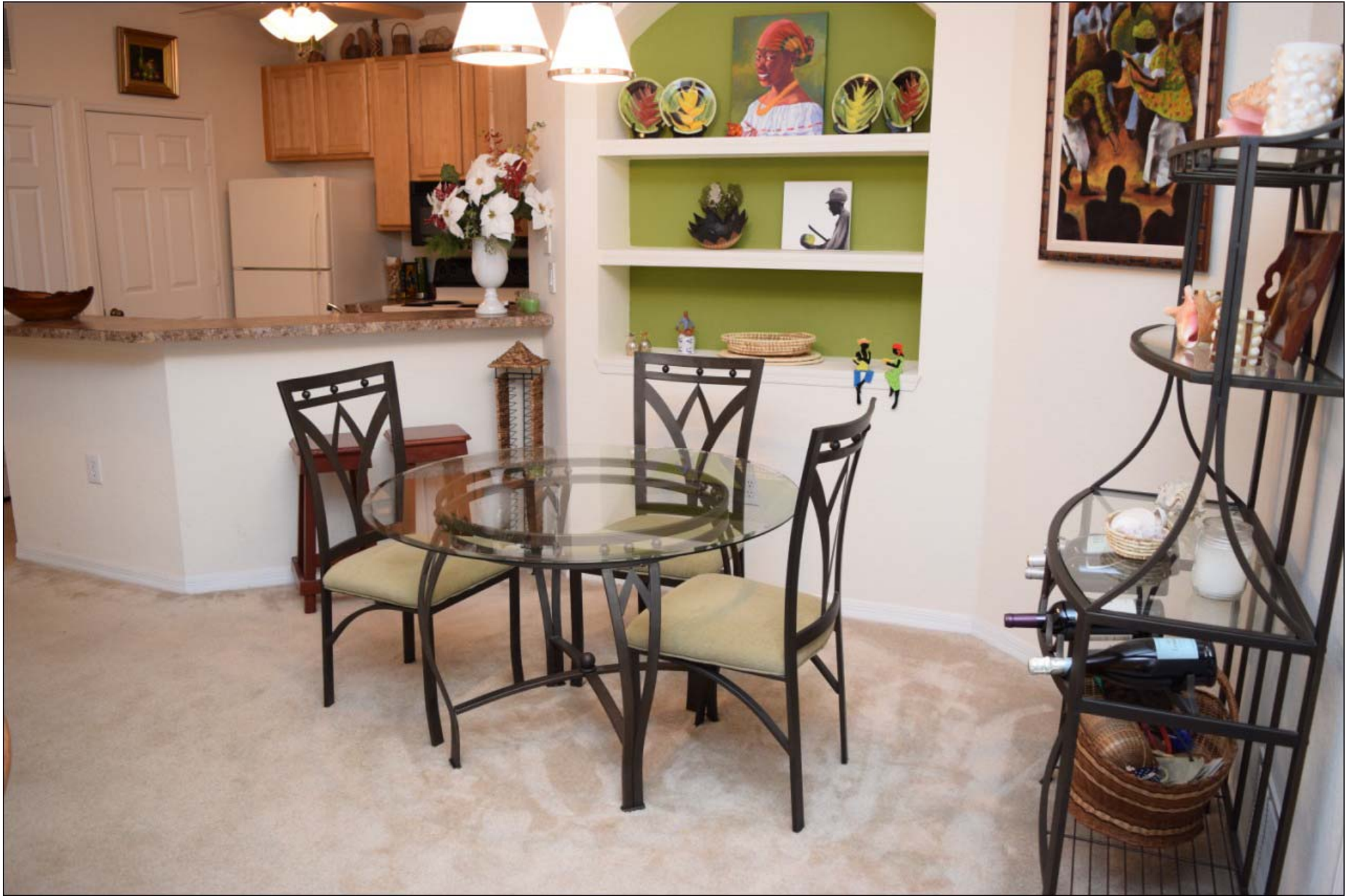
Dining Space off Kitchen – 10' x 8'