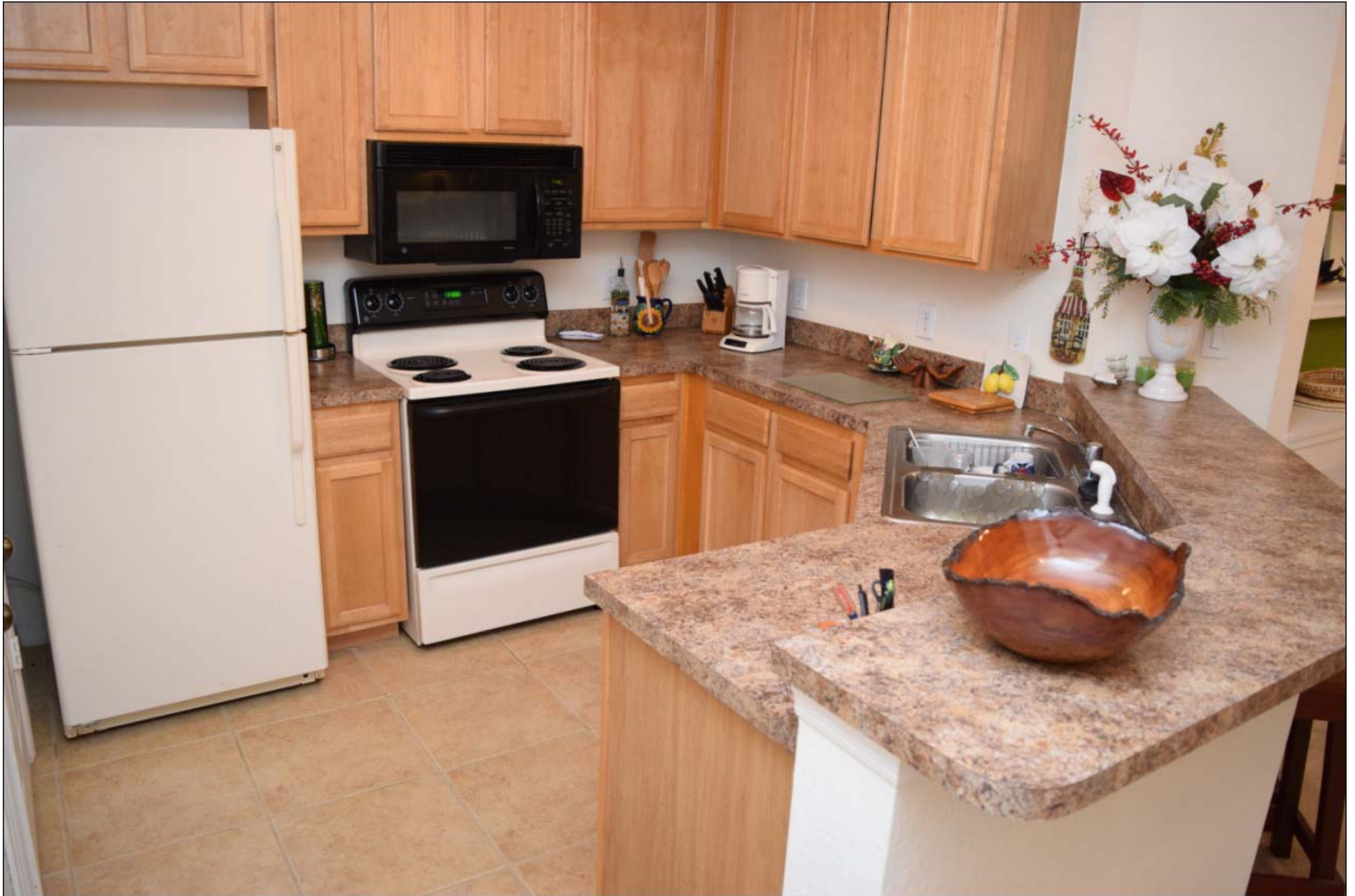
Kitchen with all Appliances, Pantry & Breakfast Bar – 10' x 10'