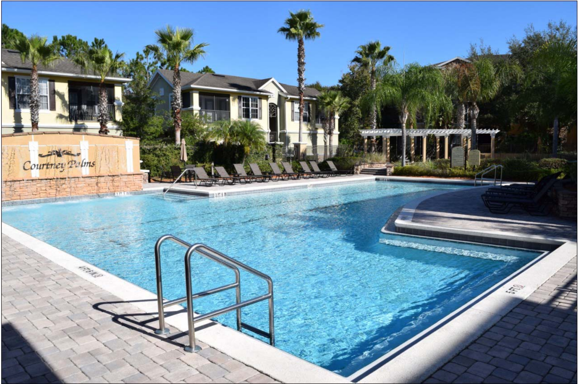
Clubhouse Pool with tables, chairs & suntan recliners