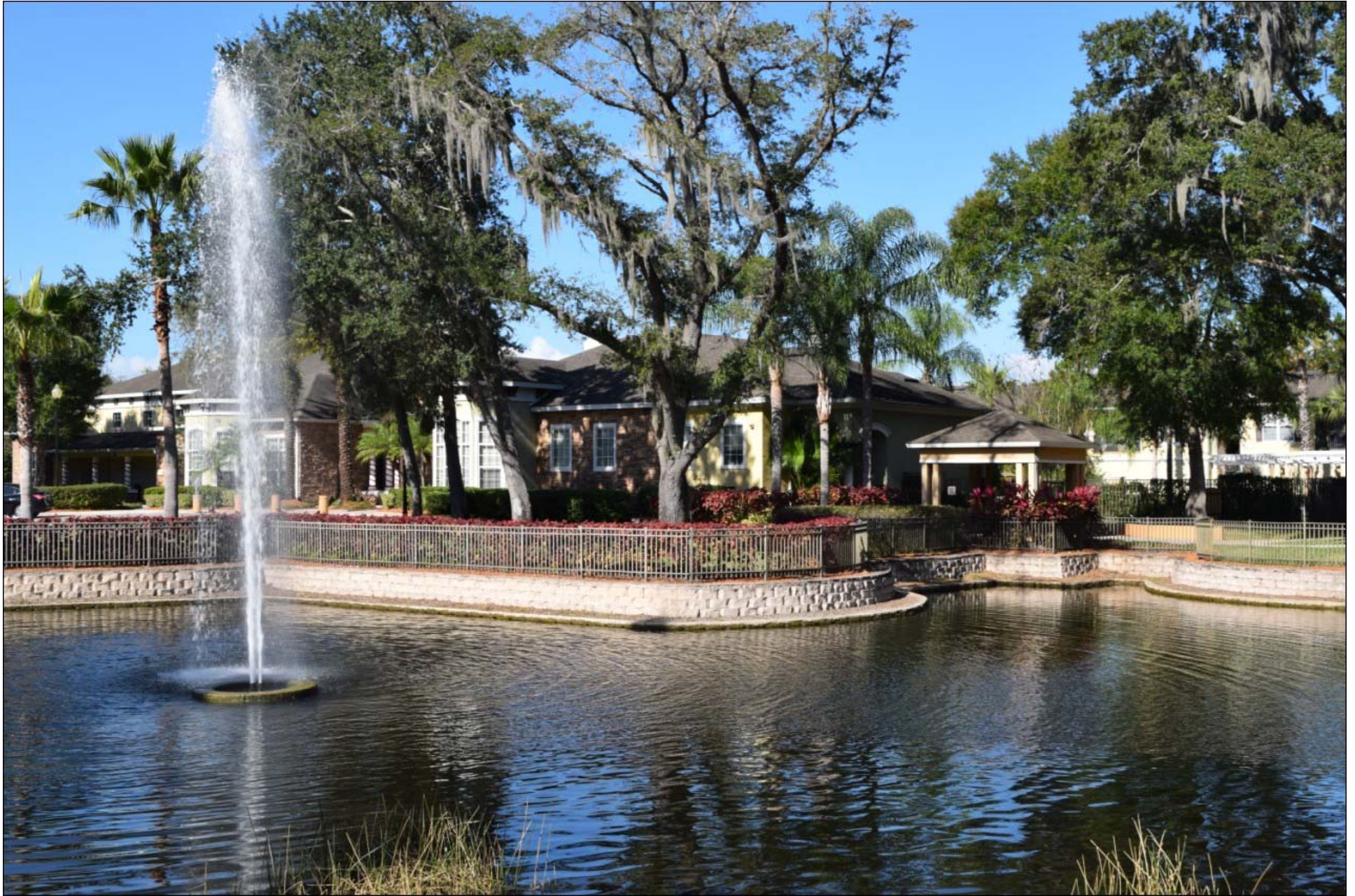
Front Pond View from Bay Windows in Bedroom 3