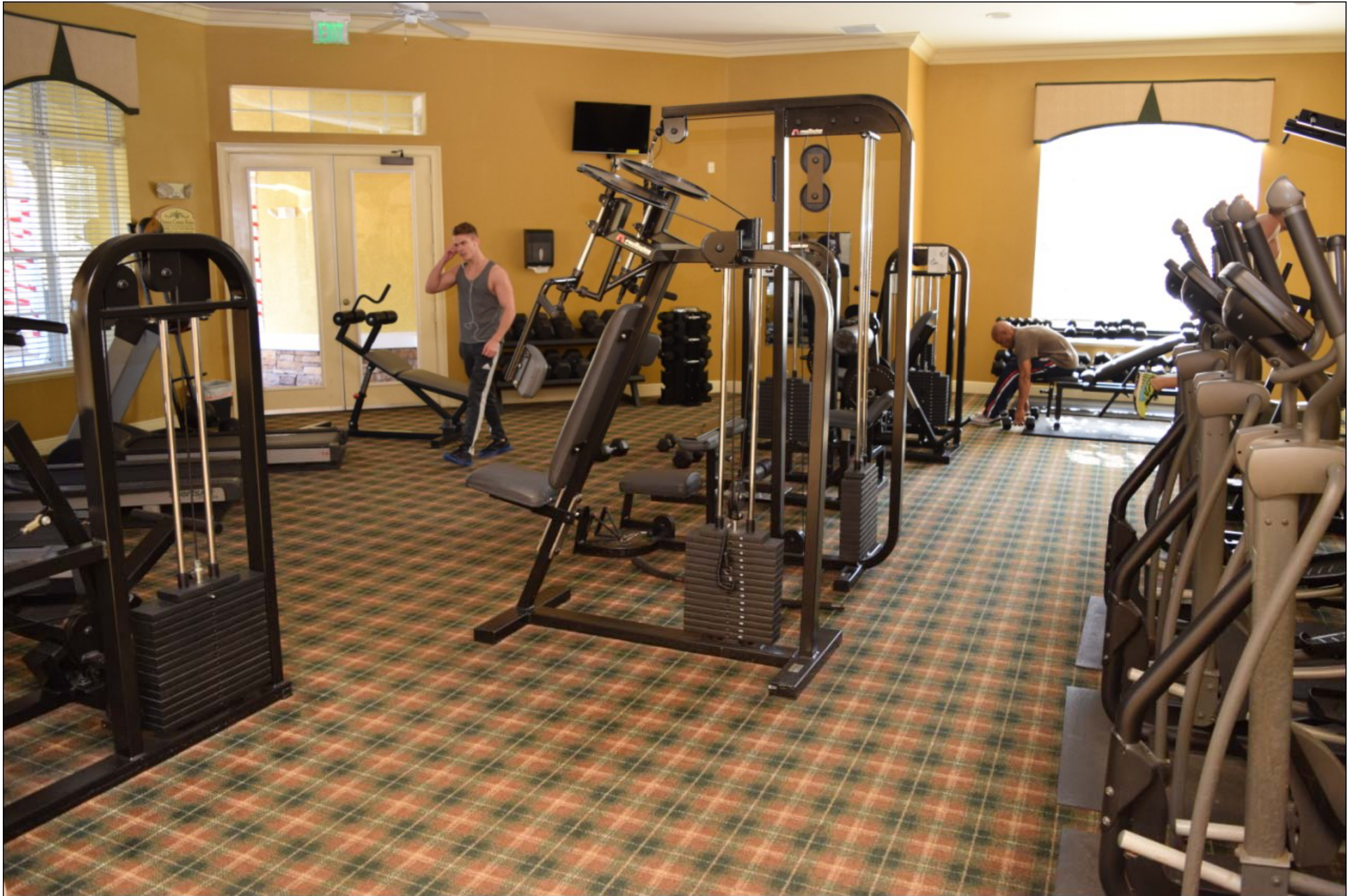
Clubhouse fully fitted Gym