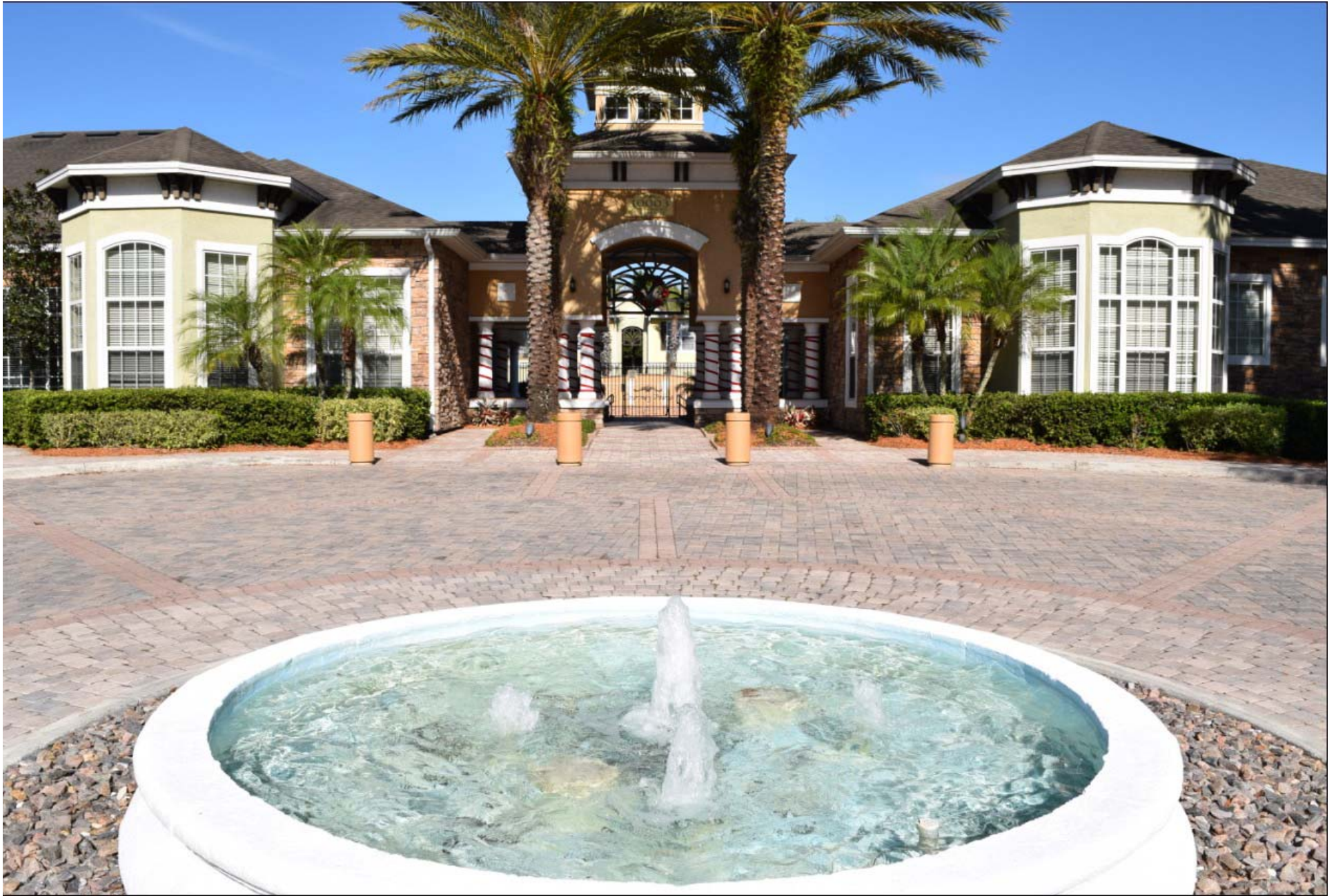
Impressive Clubhouse Entrance