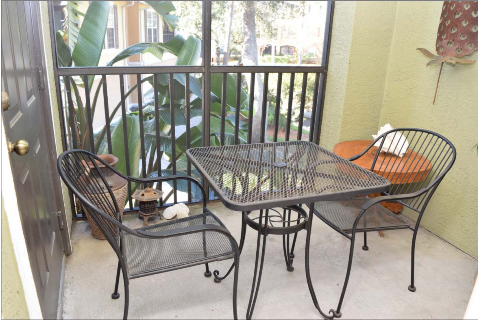
Screened Patio with Storage Room – 8' x 6'