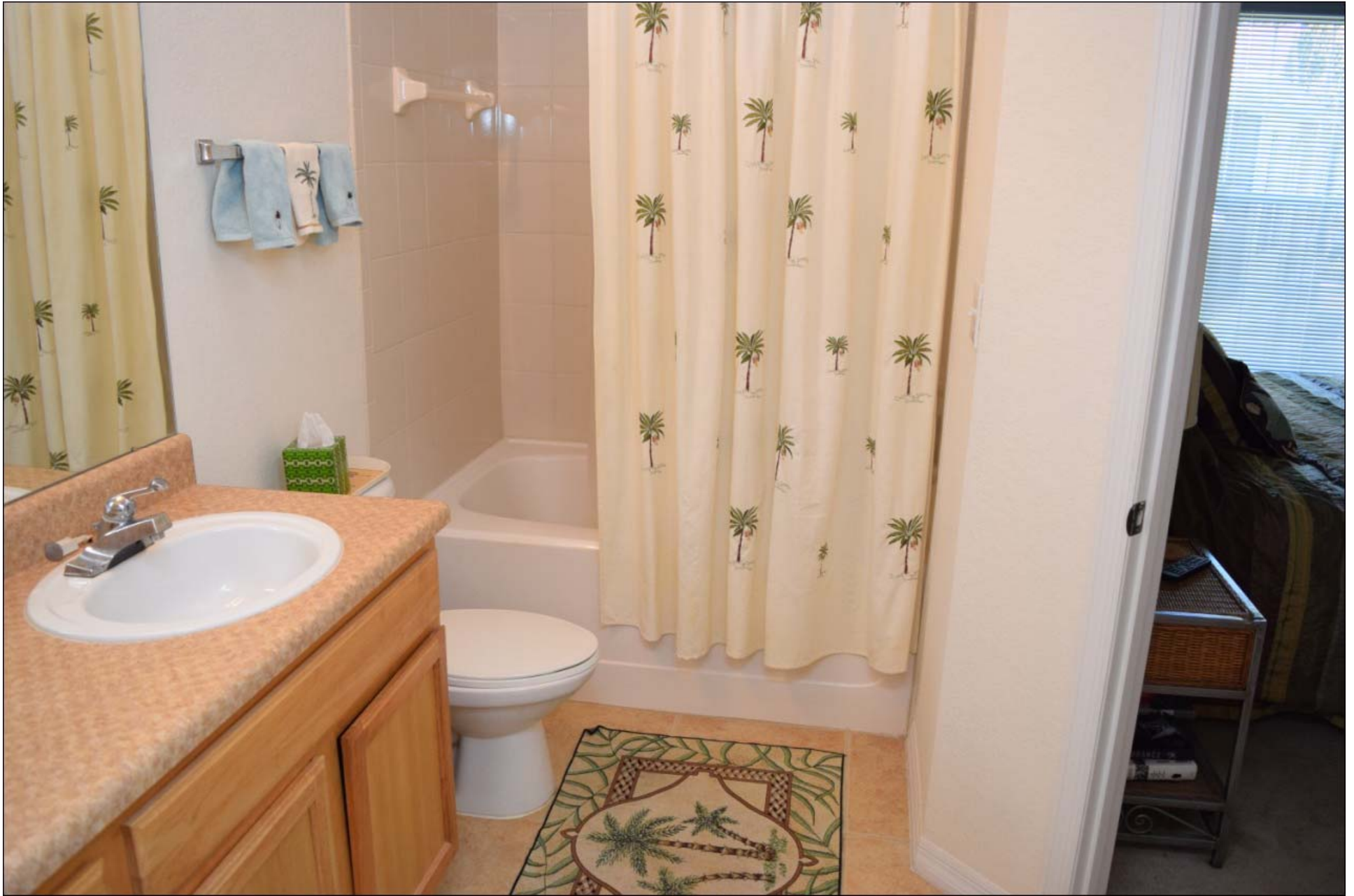
Master Bathroom with shower-in-tub & walk-in-closet