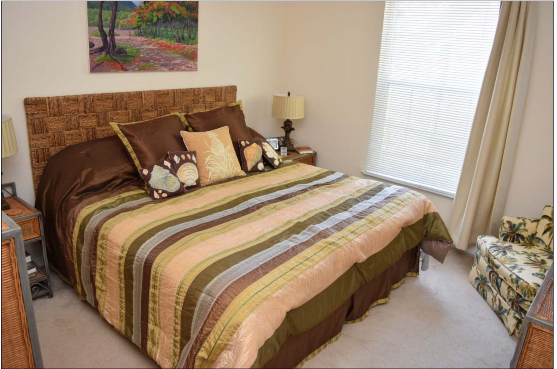
Master Bedroom – 13' x 12'