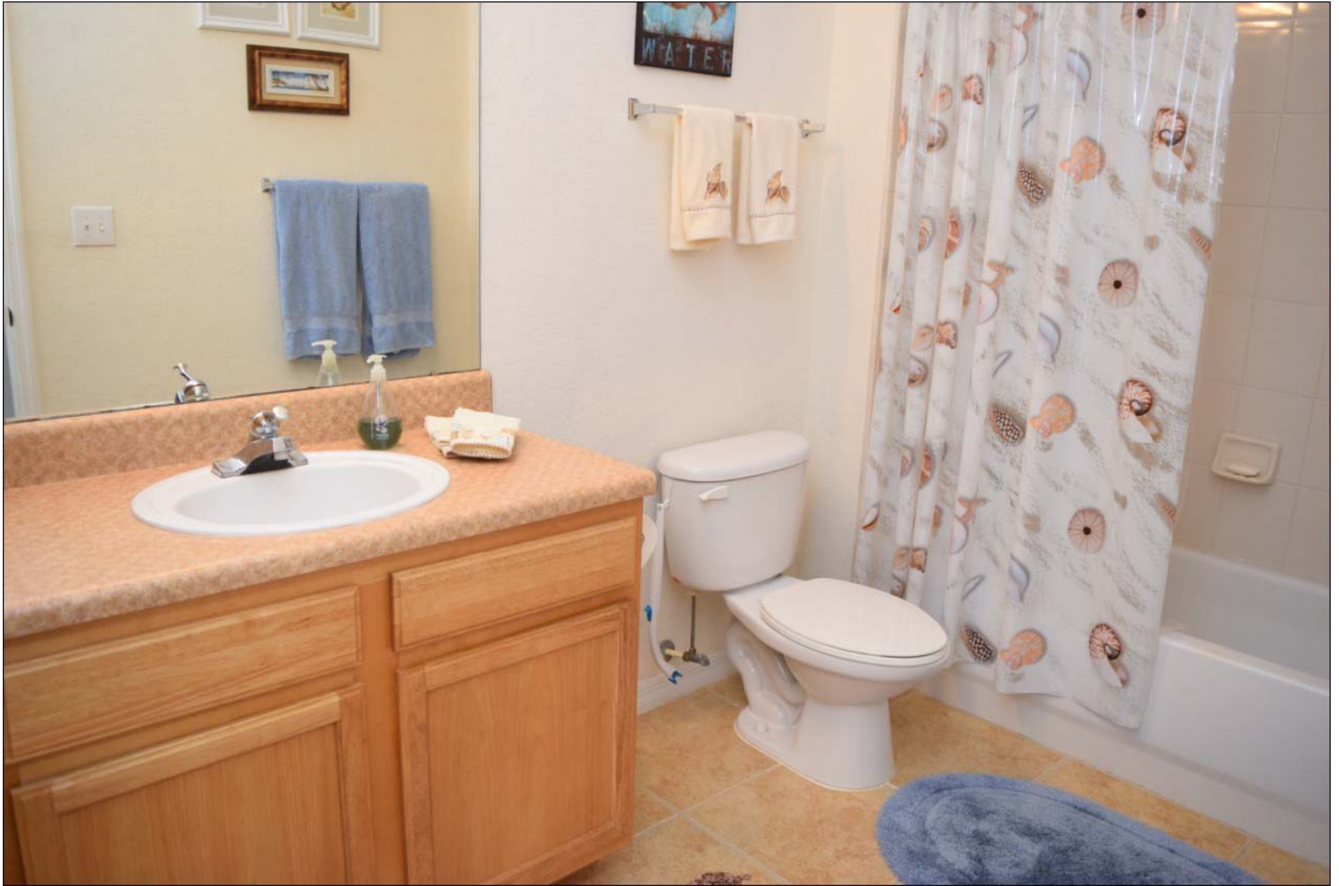
Bathroom 2 with shower-in-tub