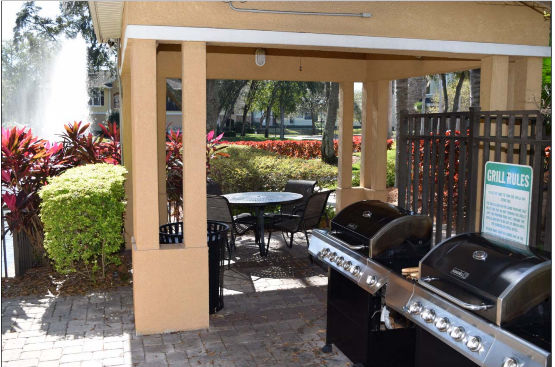
Barbecue & outside eating area off Fountain/Pond