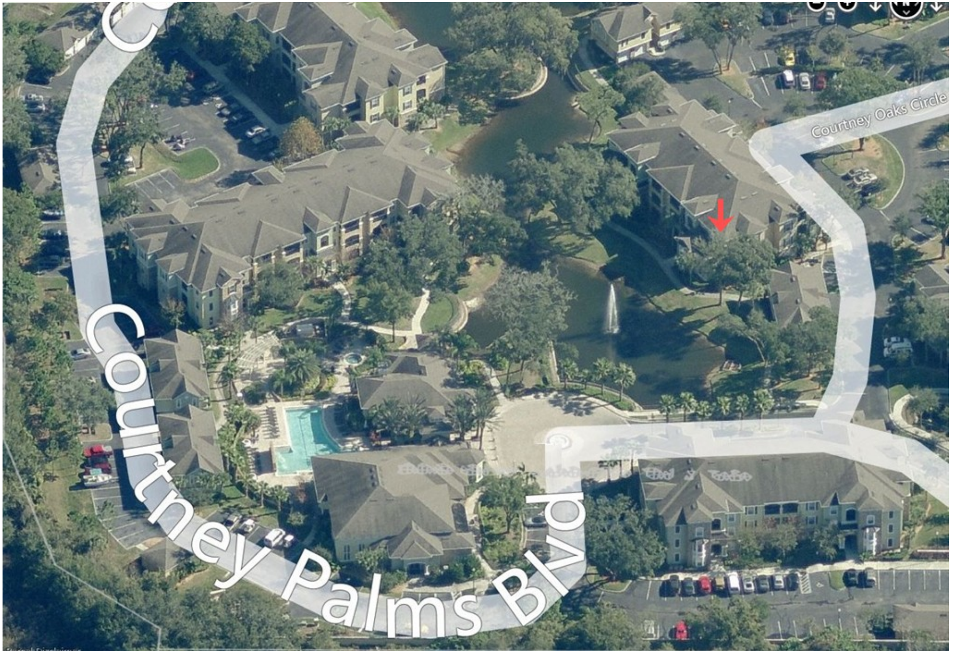
Aerial View – 2 nd floor corner unit identified with Red Arrow