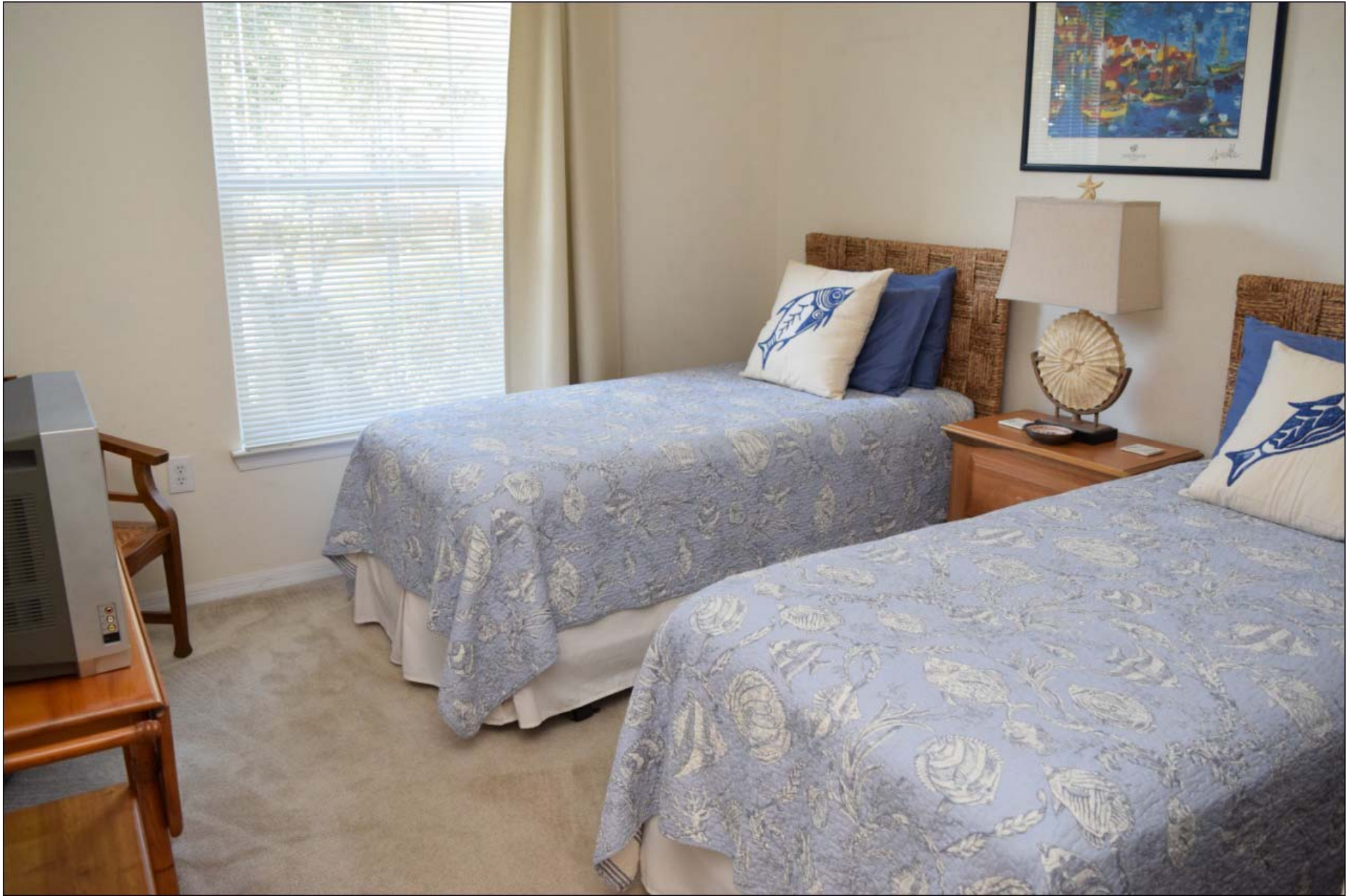
Bedroom 2 – 12' x 11'