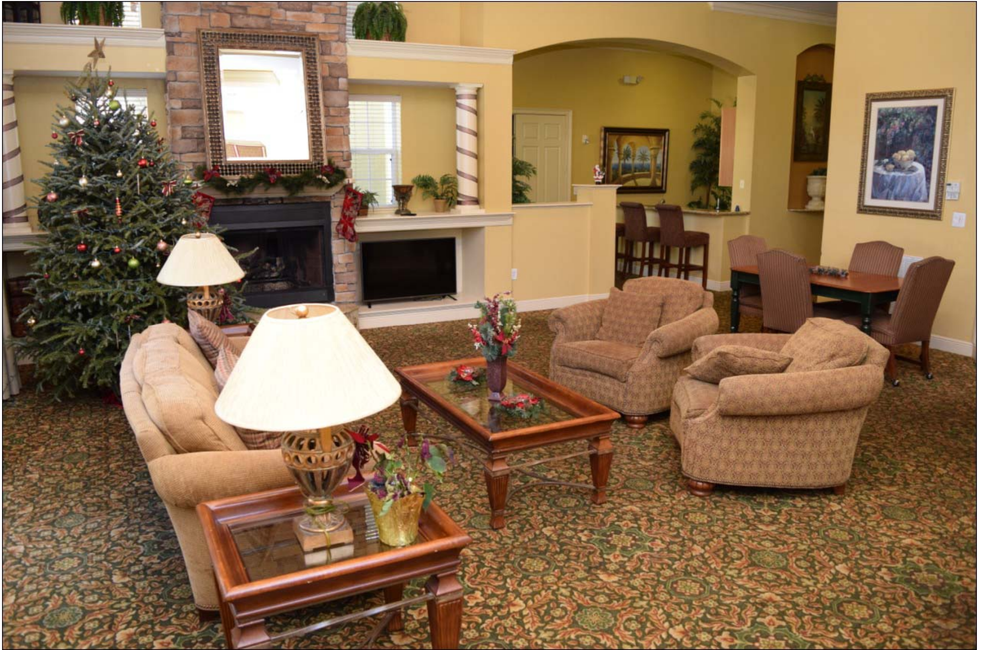
Clubhouse sitting room with fireplace