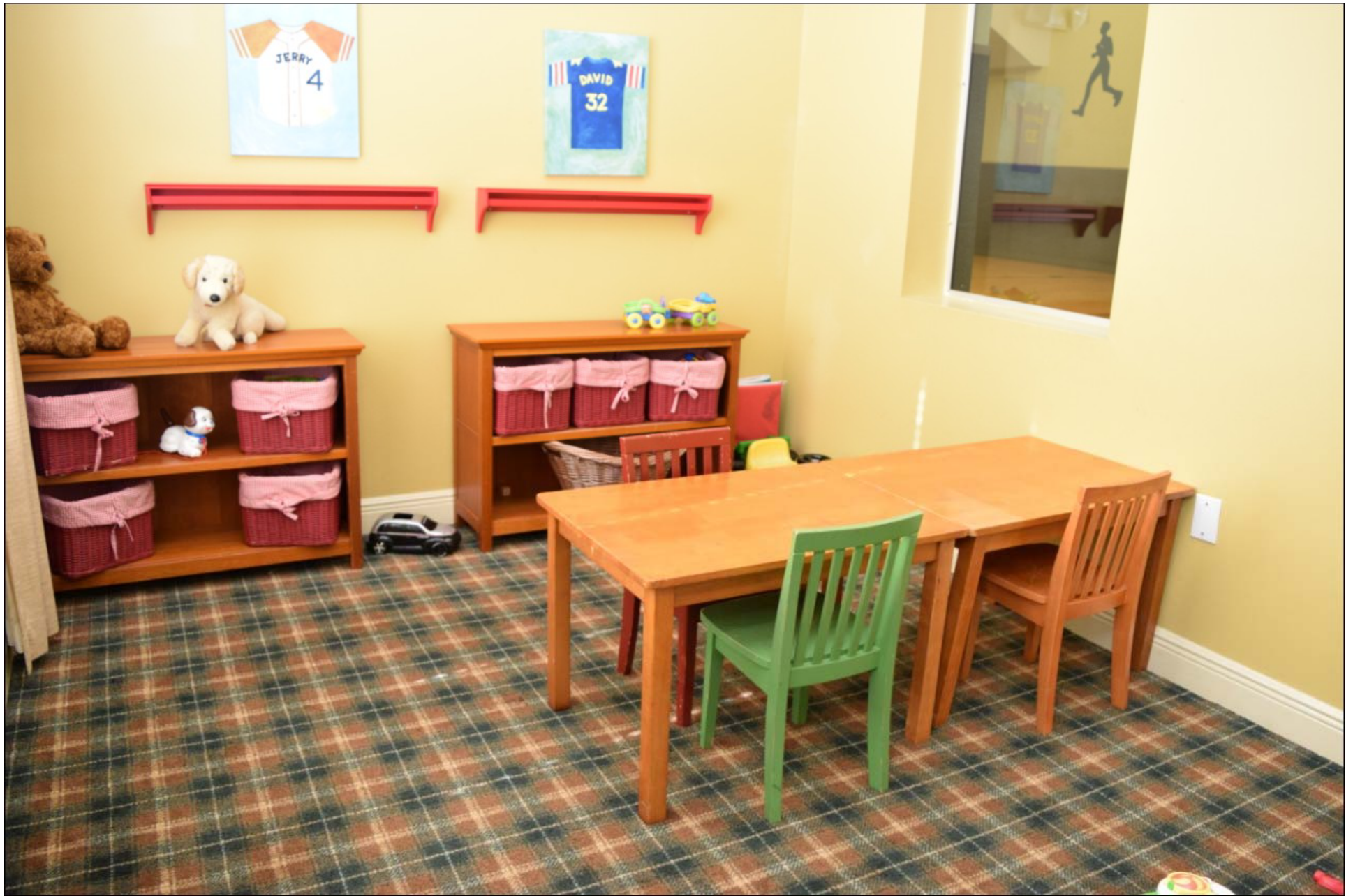
Kiddies Playroom off Gym & Basketball Court