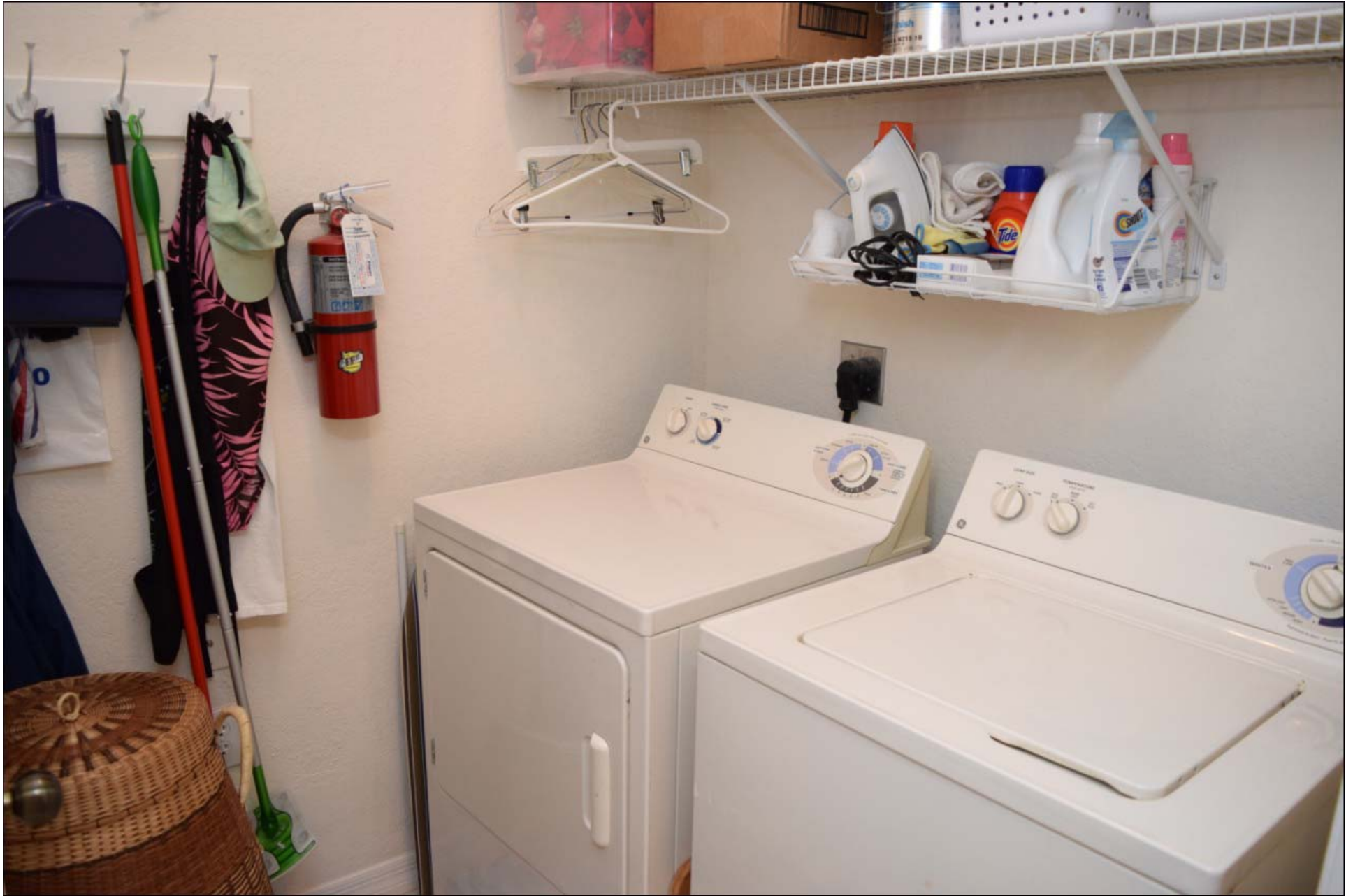
Laundry with Washer & Dryer