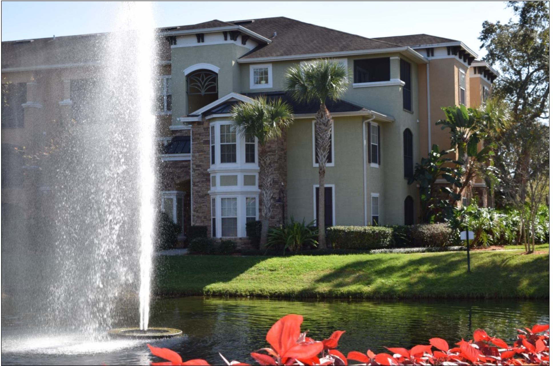
Front View – 2 nd Floor corner unit with Bay Window