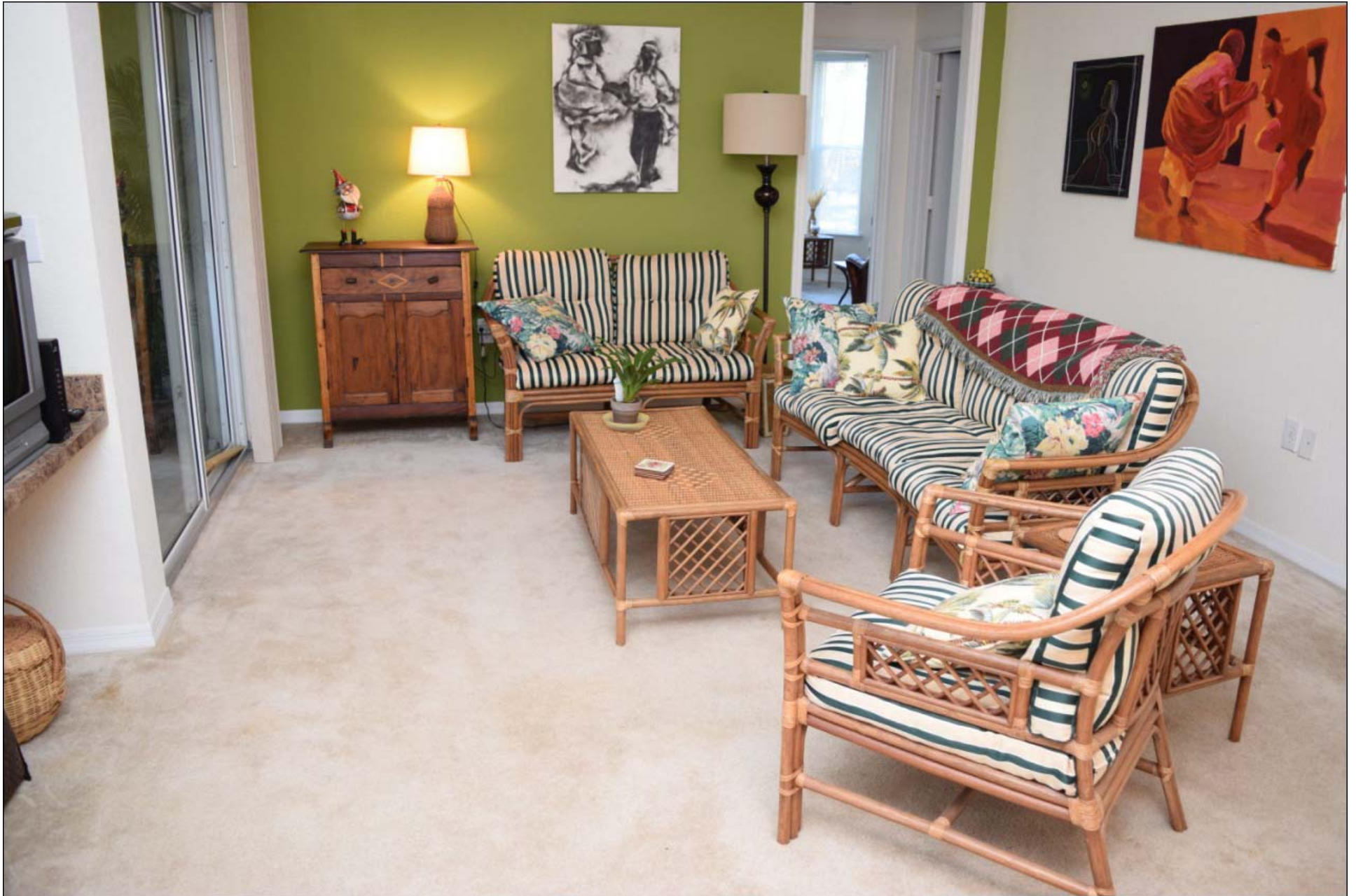
Living Room with Sliding Doors onto Patio – 16' x 16'