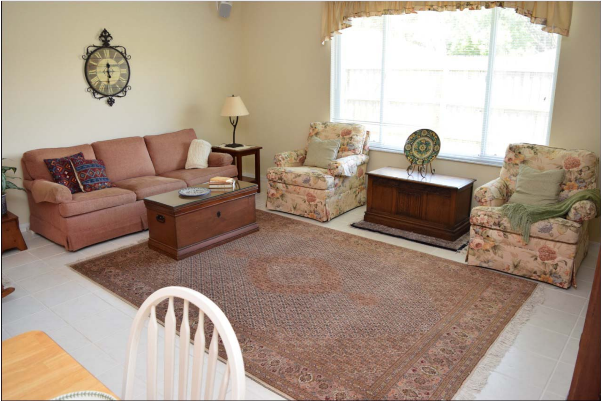
Large Family Room with back view 19x17