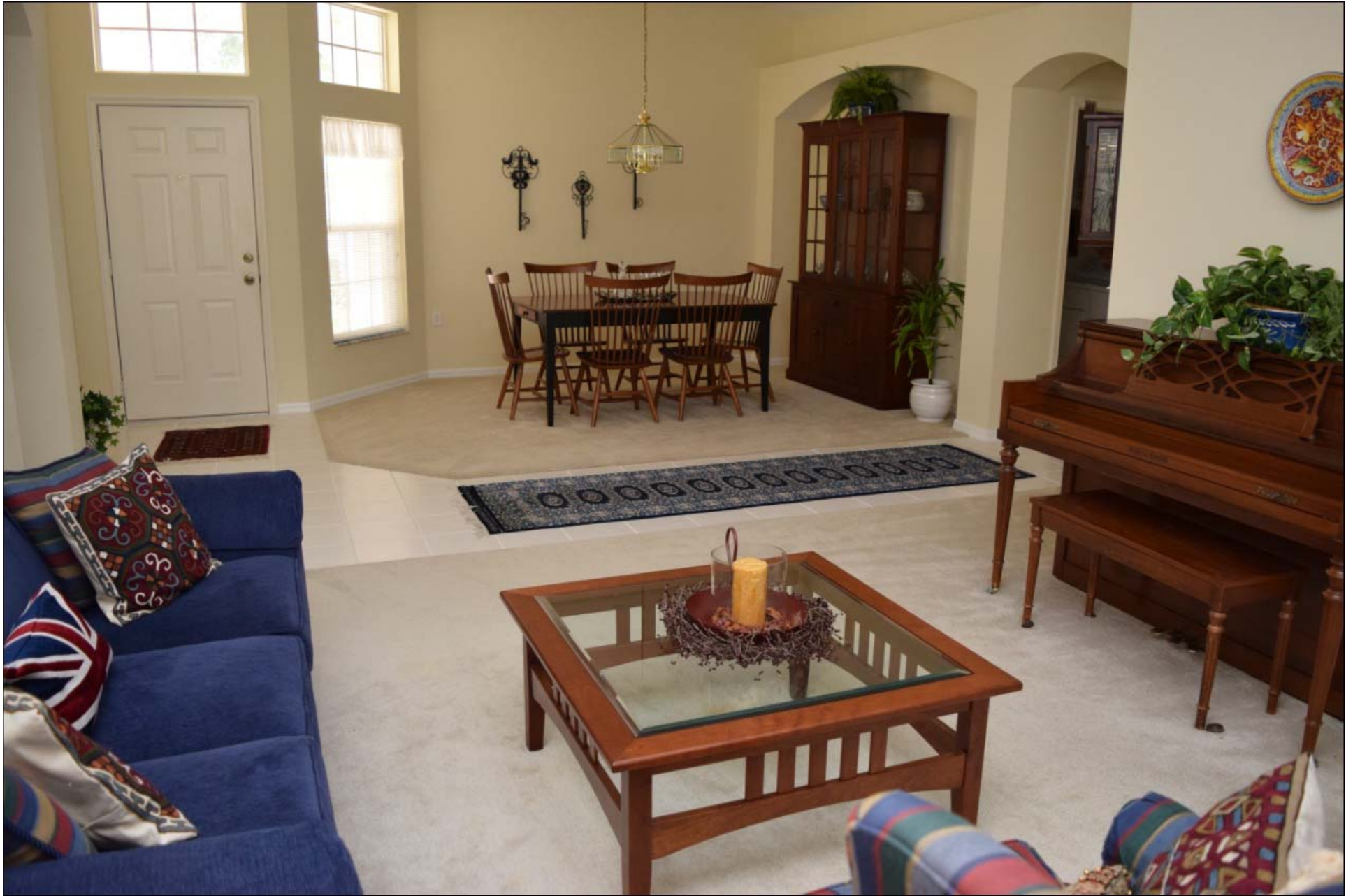
Formal Living Room onto Dining room