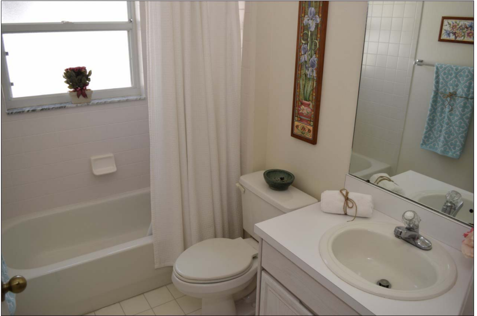
Bathroom 2 between bedrooms 2&3