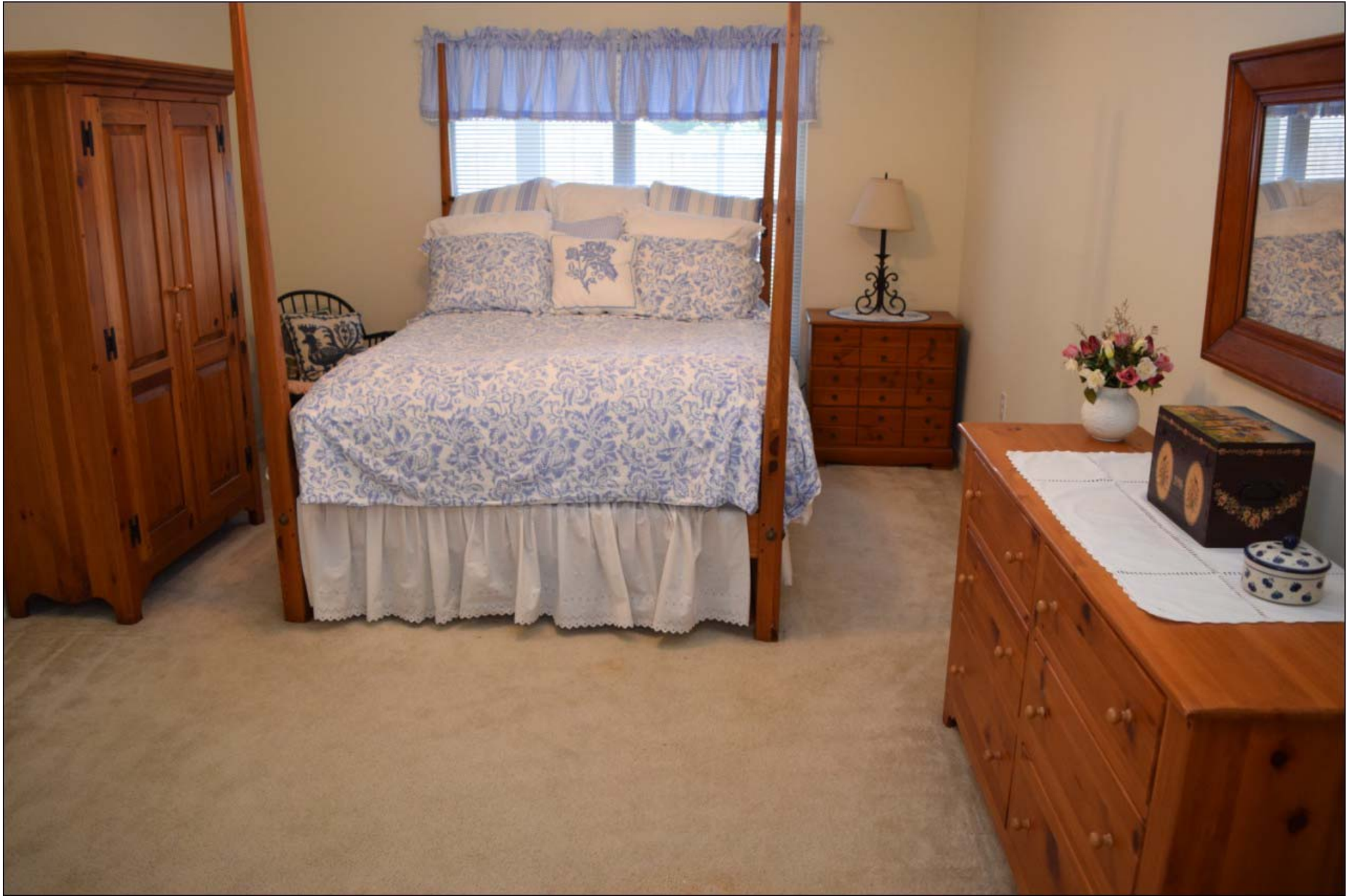
Large Master Bedroom 17x12