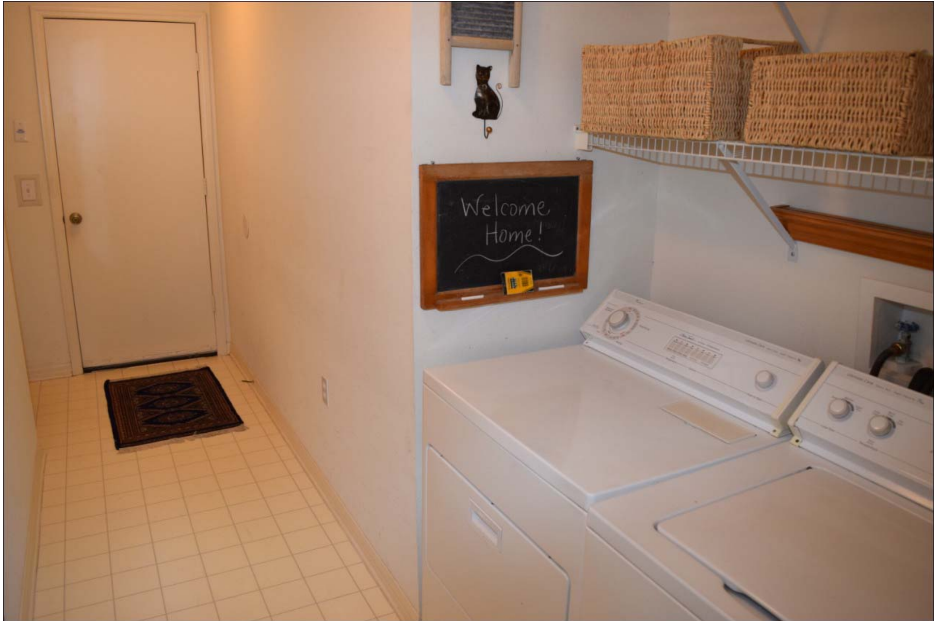
Laundry onto 3 Car Garage - 3rd garage is a workshop - Attic