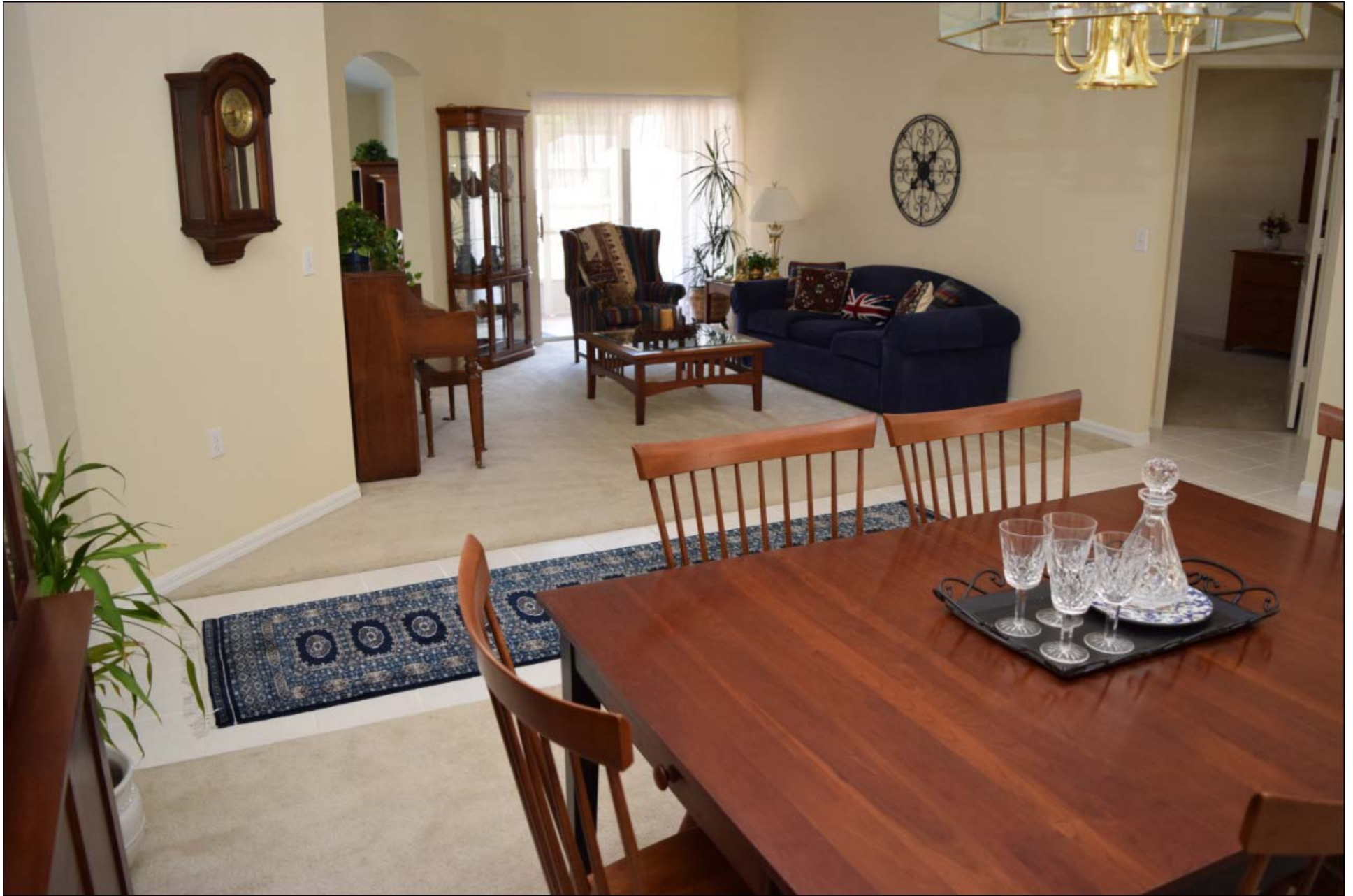
Dining Room onto Formal Living Room