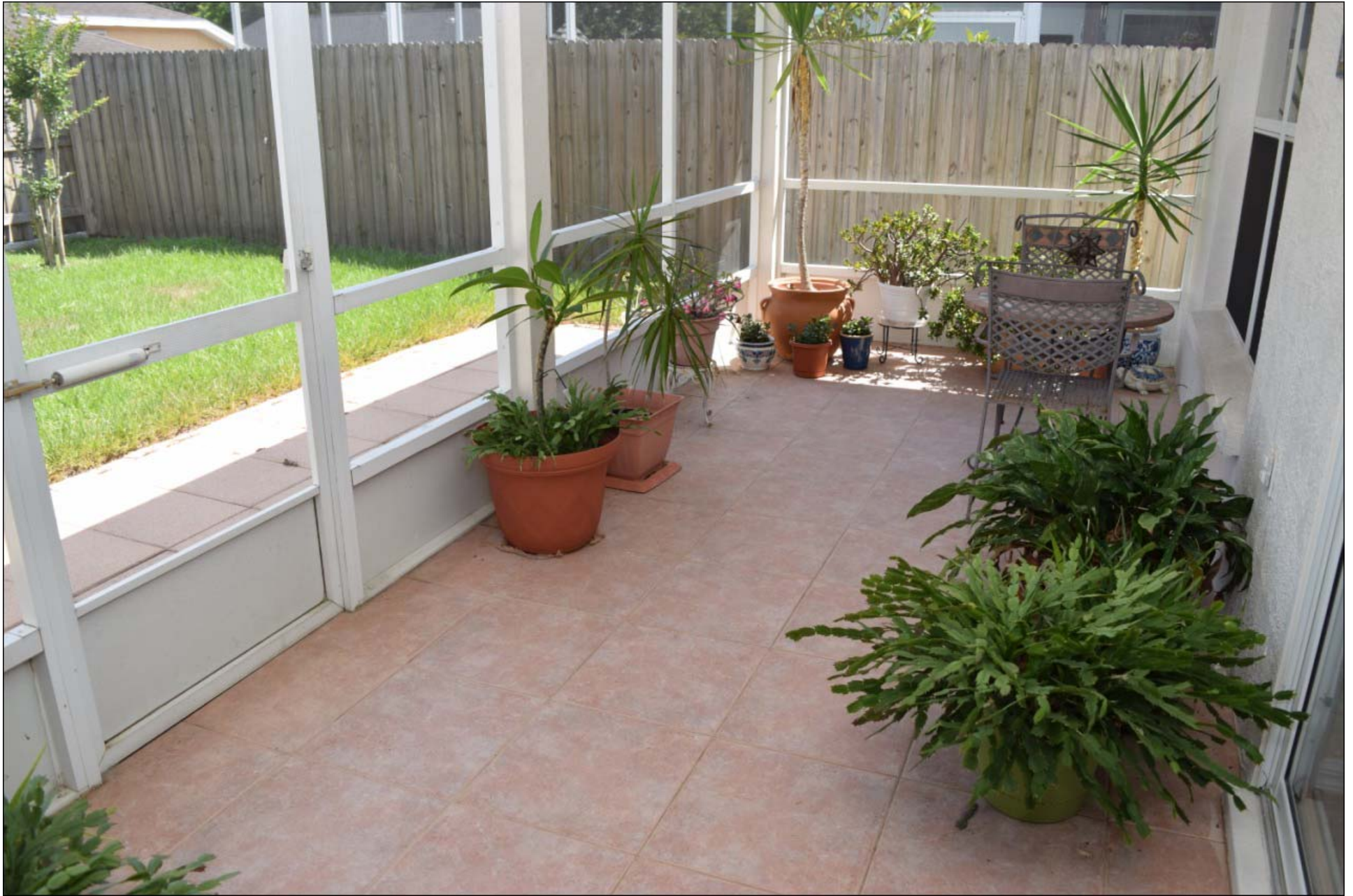
2 Sets of sliding doors onto Screened in Back Porch with fenced in back yard