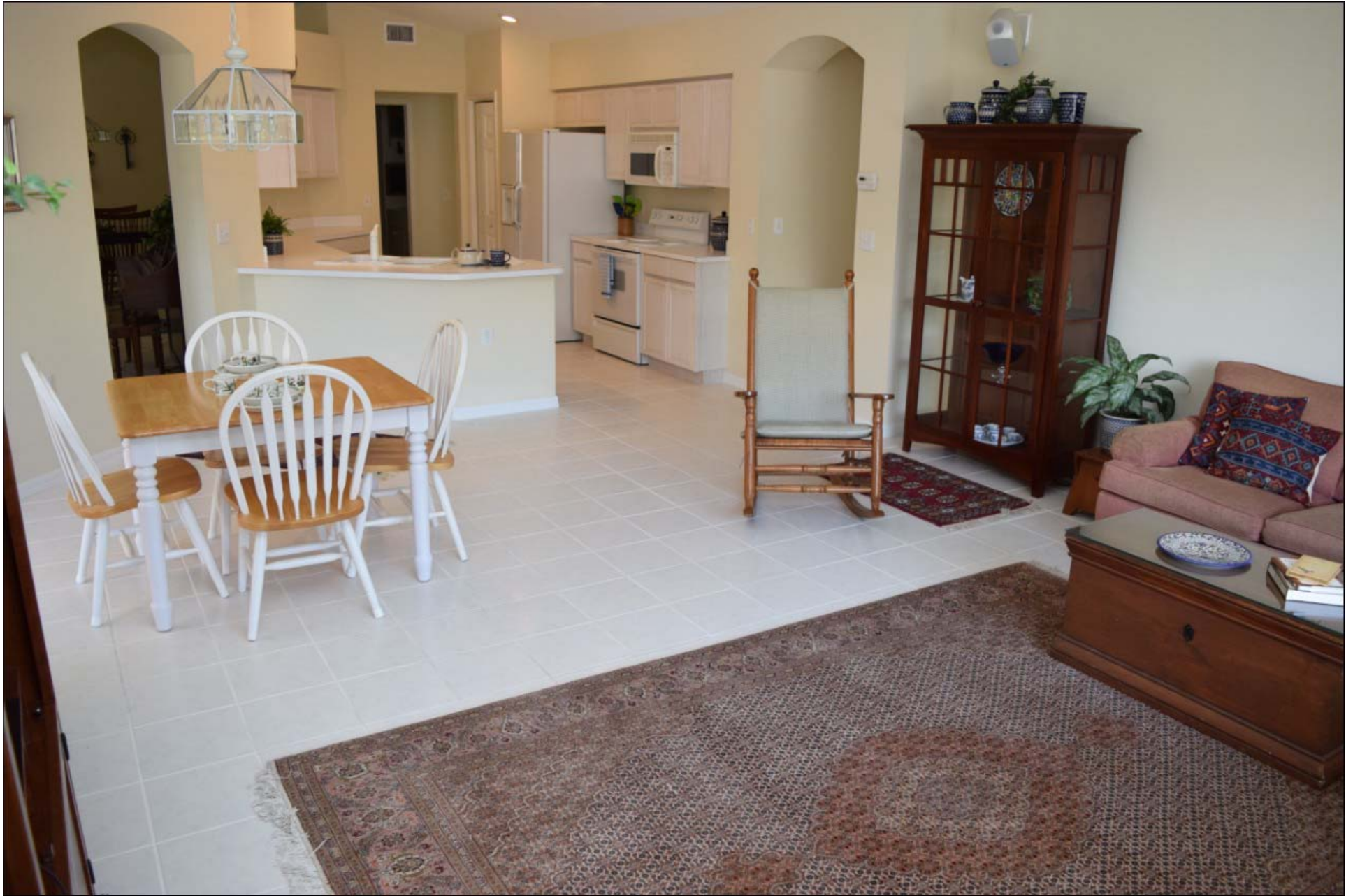
Family Room onto Kitchen