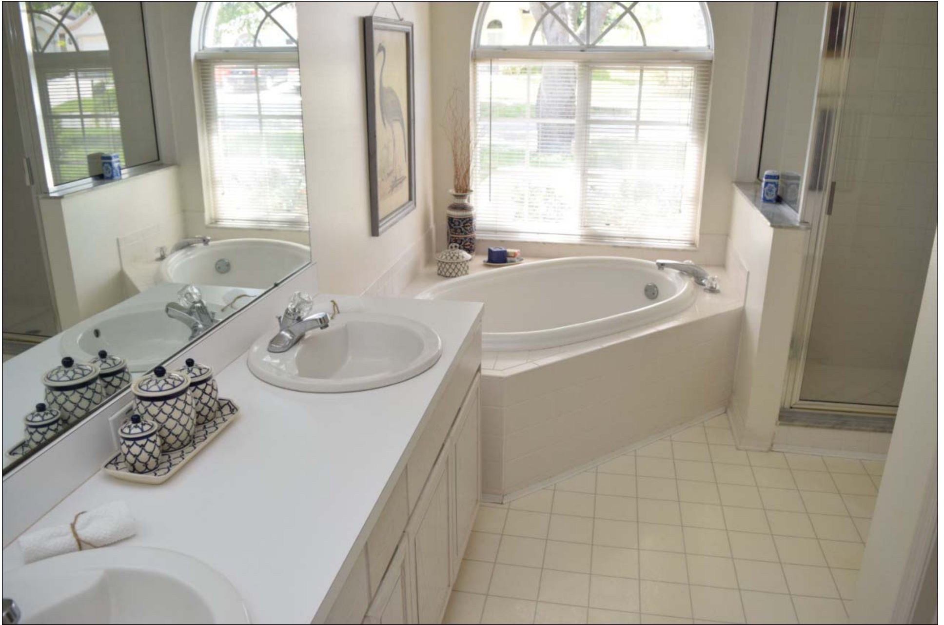
Master Bathroom with dual vanities, Large garden tub, Separate shower & Private W.C.