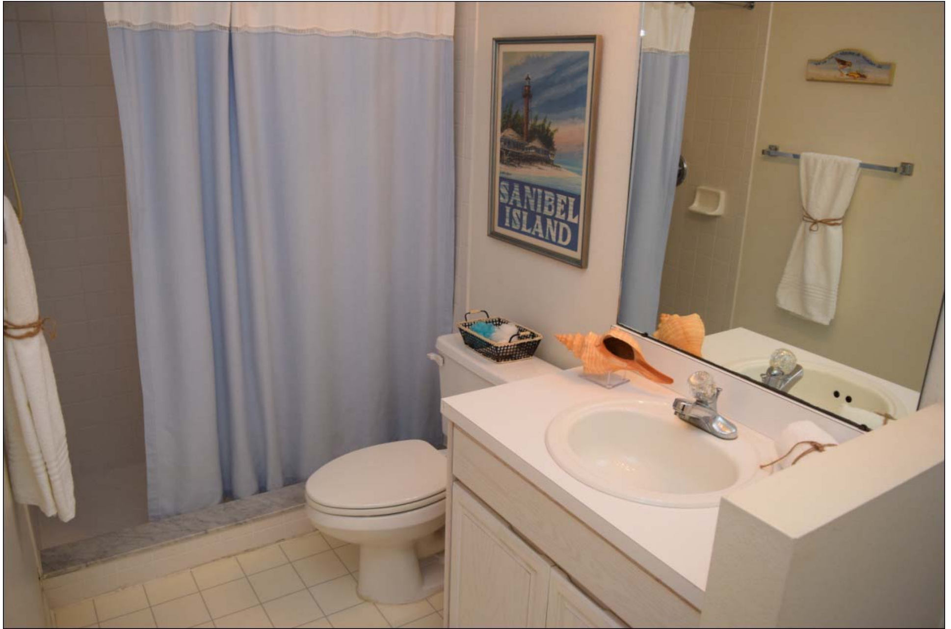
Private bathroom 3 off bedroom 4 making a perfect guest/granny suite