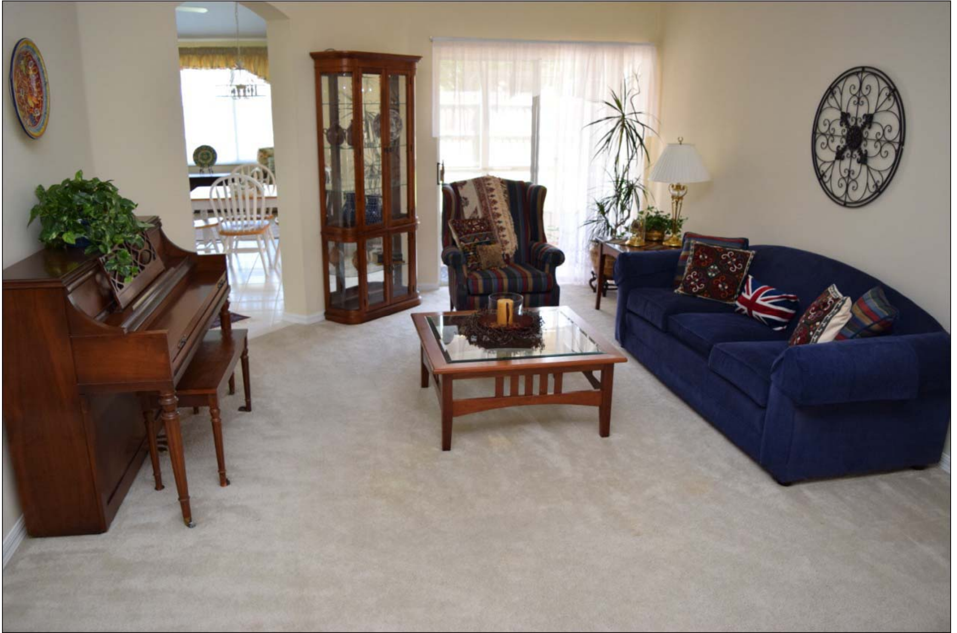
Formal Living Room 16x15