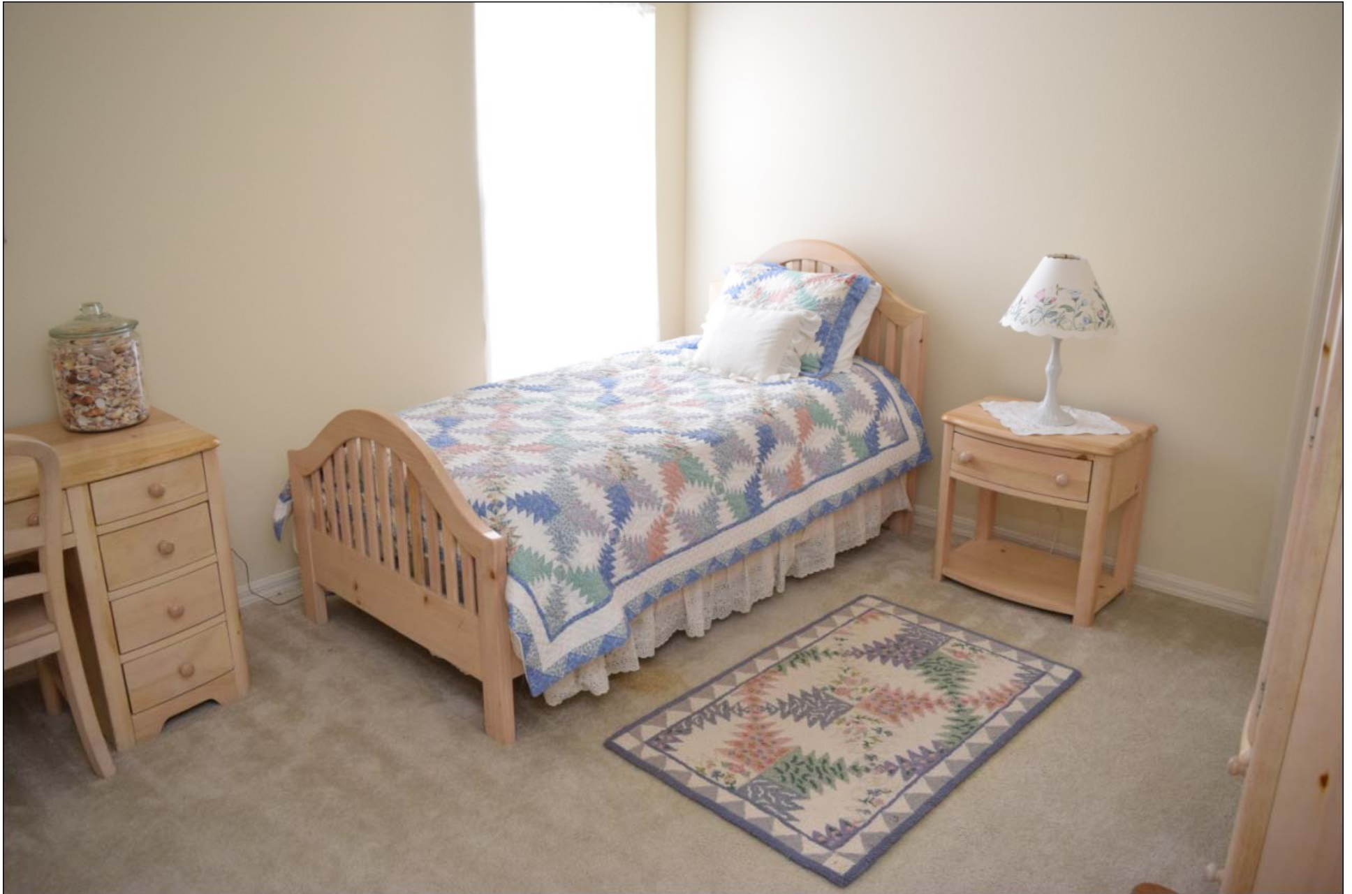
Bedroom 4 - 14X12