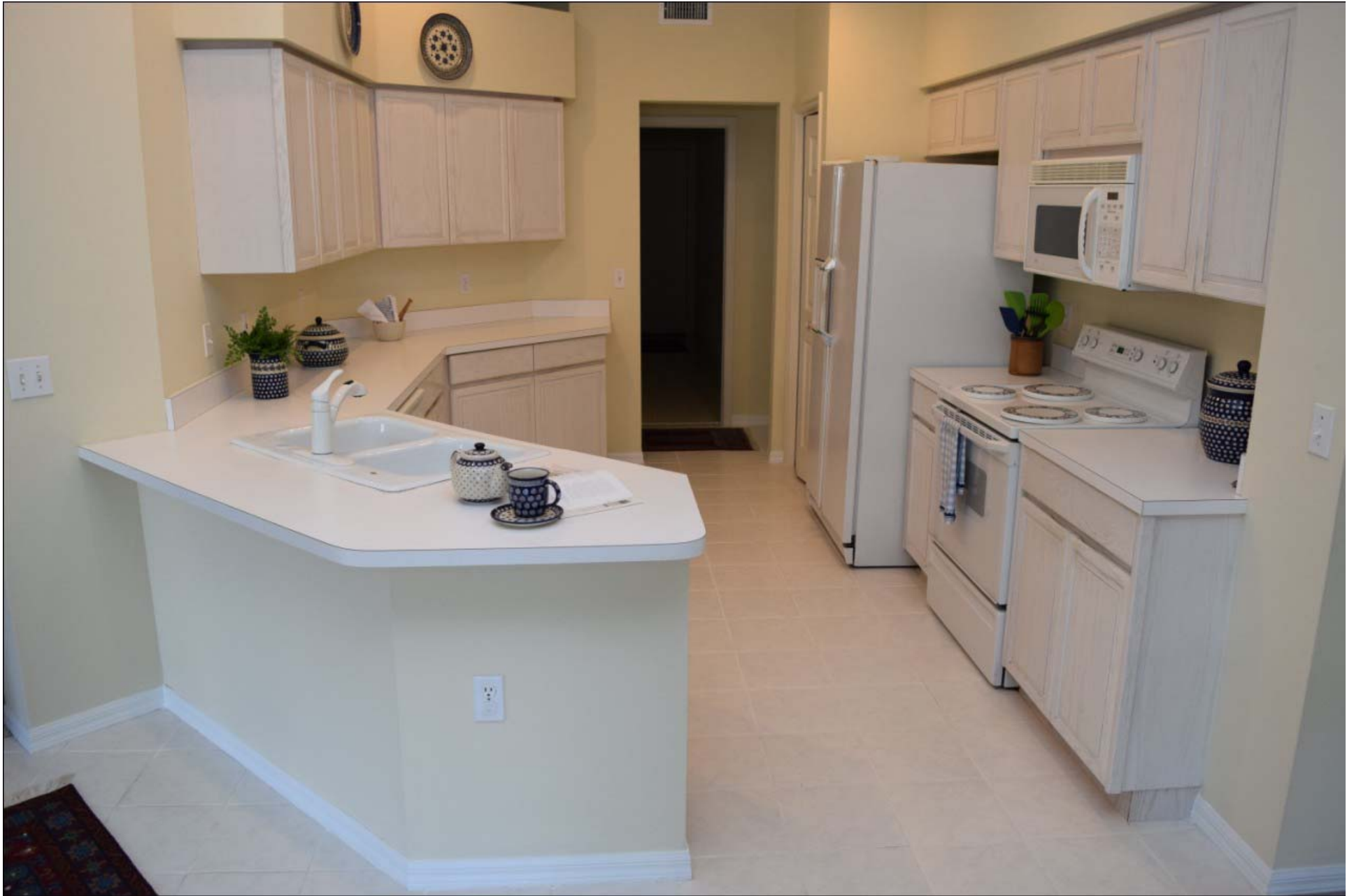
Kitchen with Solid Stone Washed cabinets and ceramic tiles 17x12