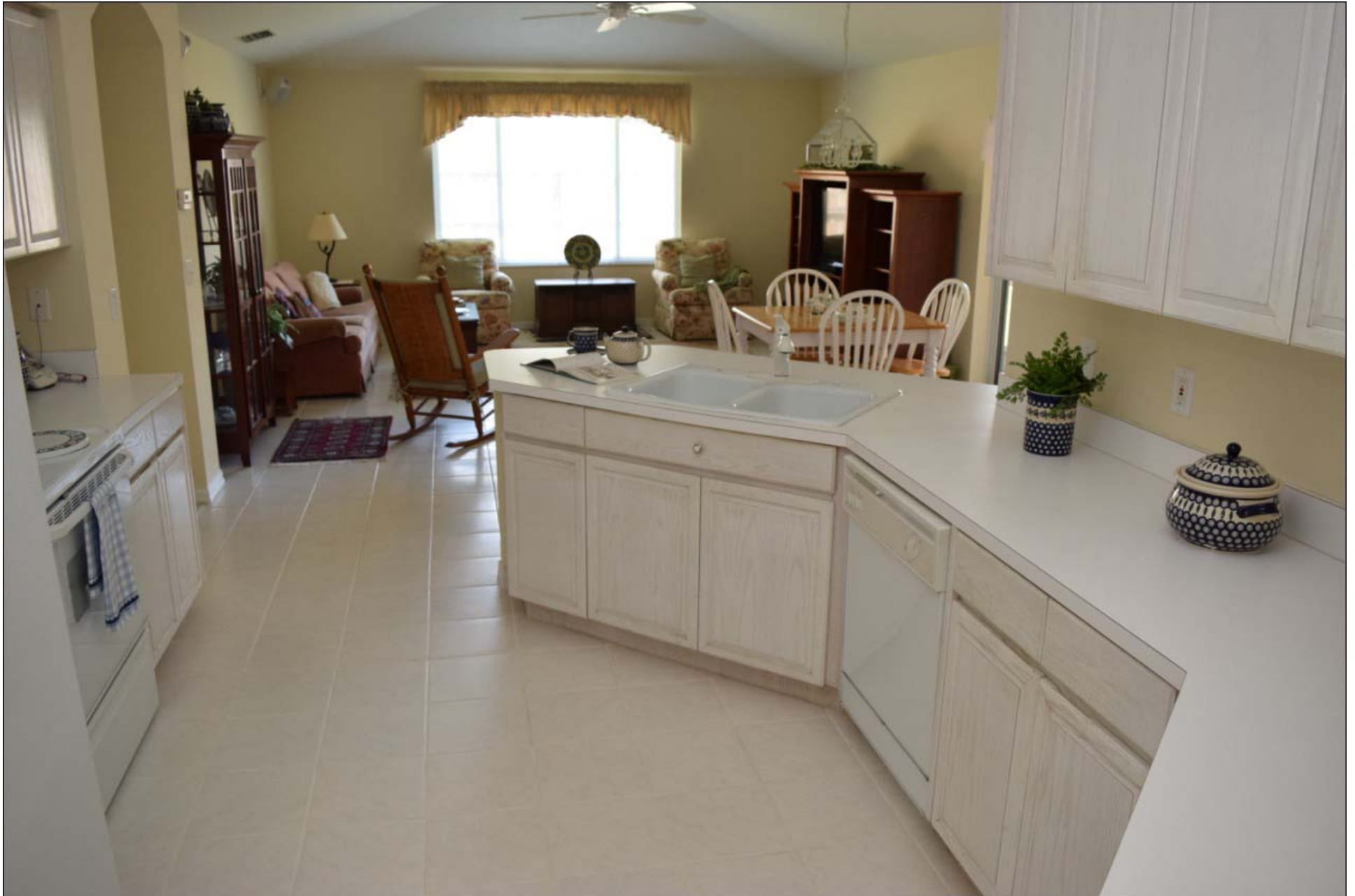
Open Plan Kitchen onto Family Room