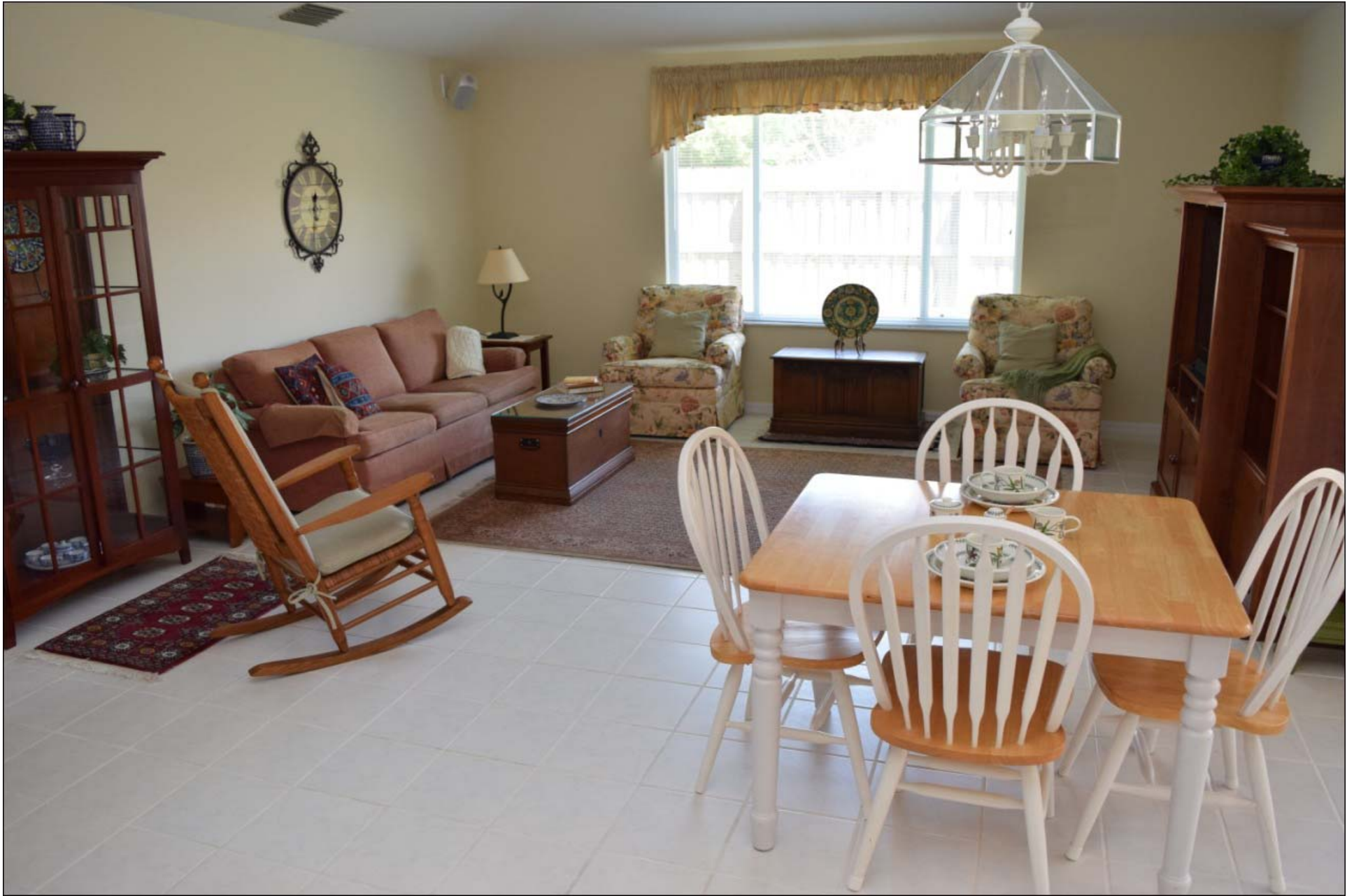
Dinette onto Family Room