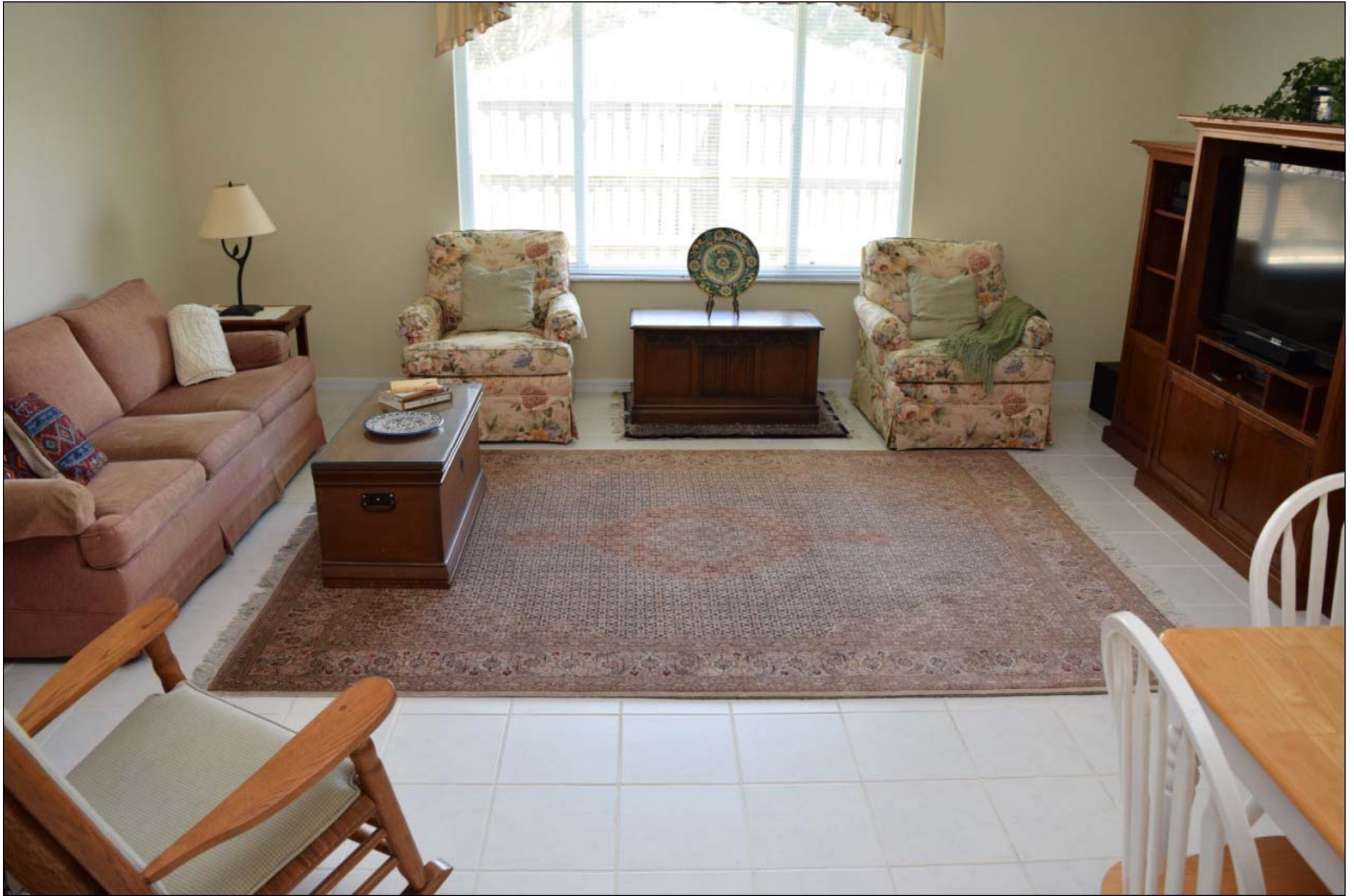
Large Family Room with back view 19x17