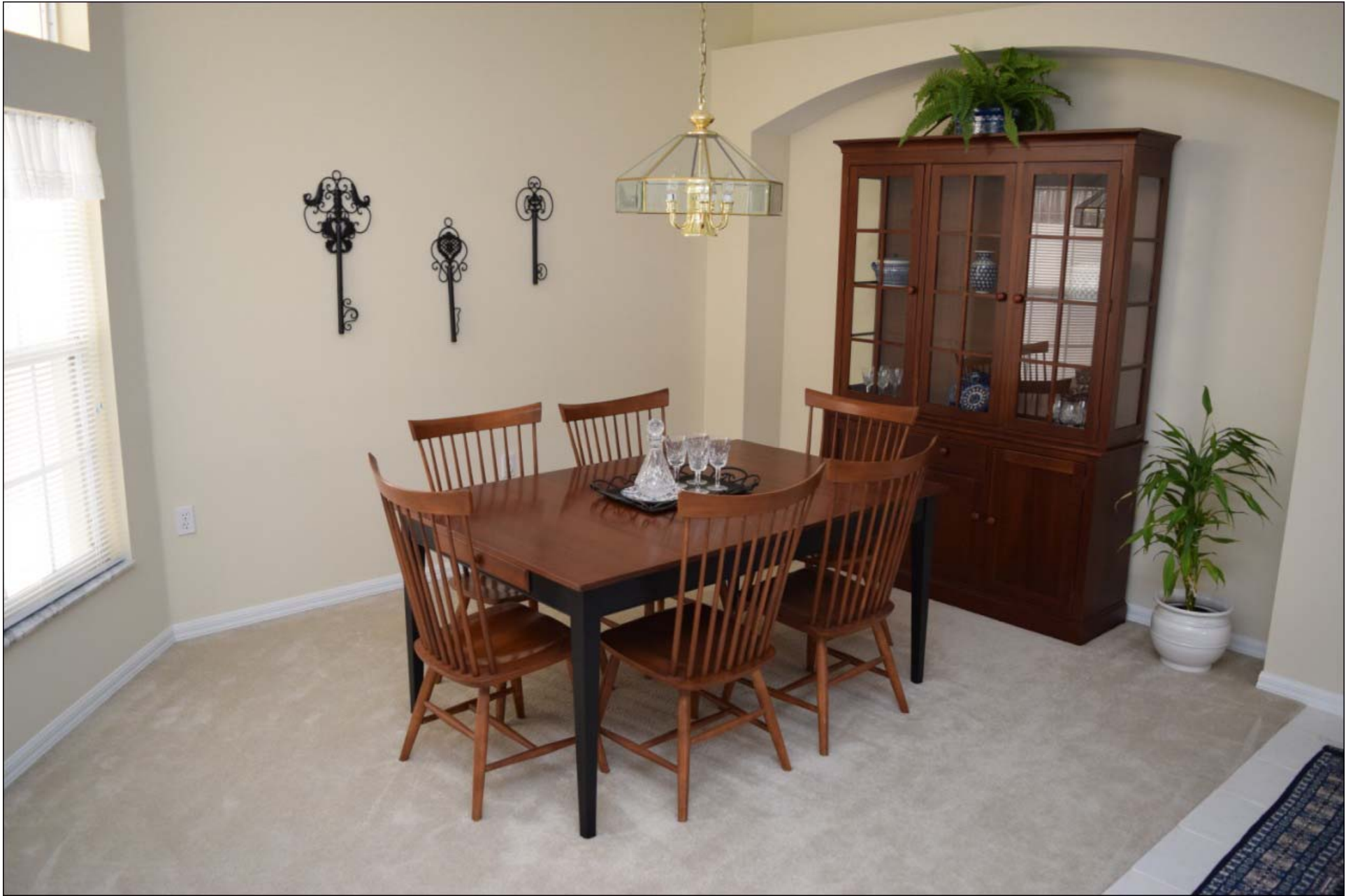
Elegant Dining Room with a front view 15x12