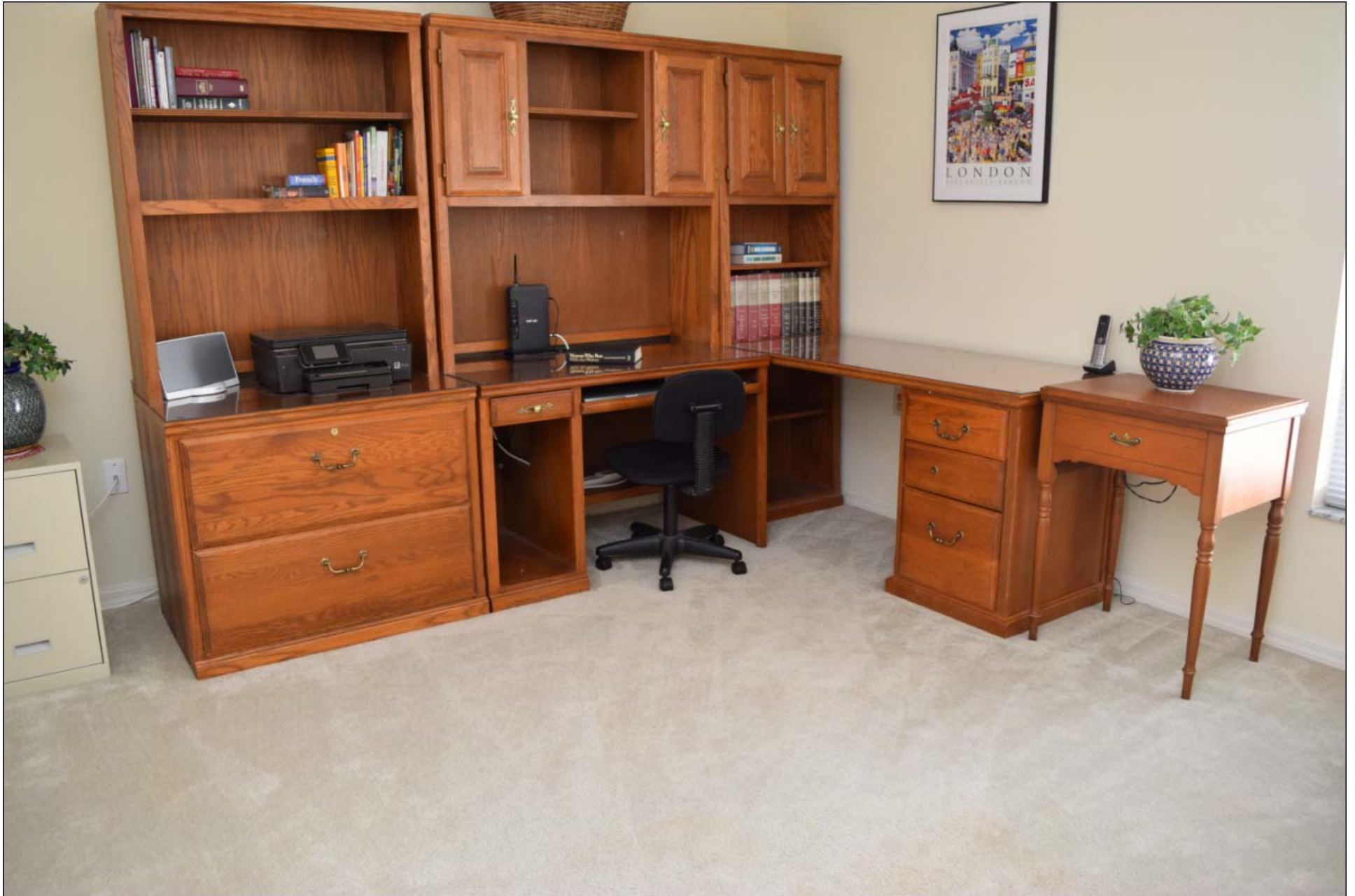
Office or Bedroom 2 - 12X12