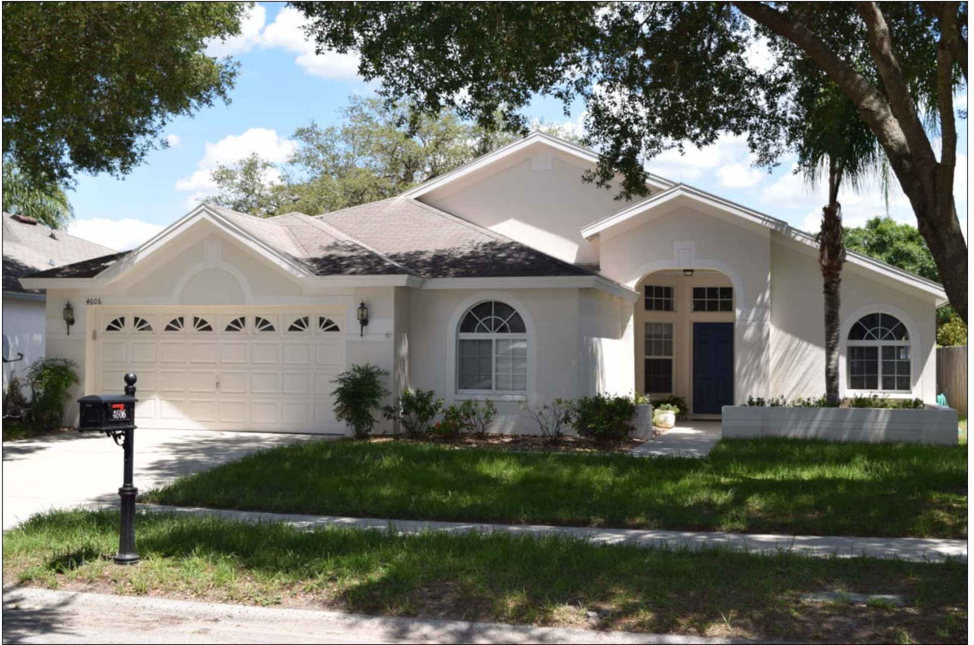
Front view - 4/3/3 - 2,283 sq/ft - 1997