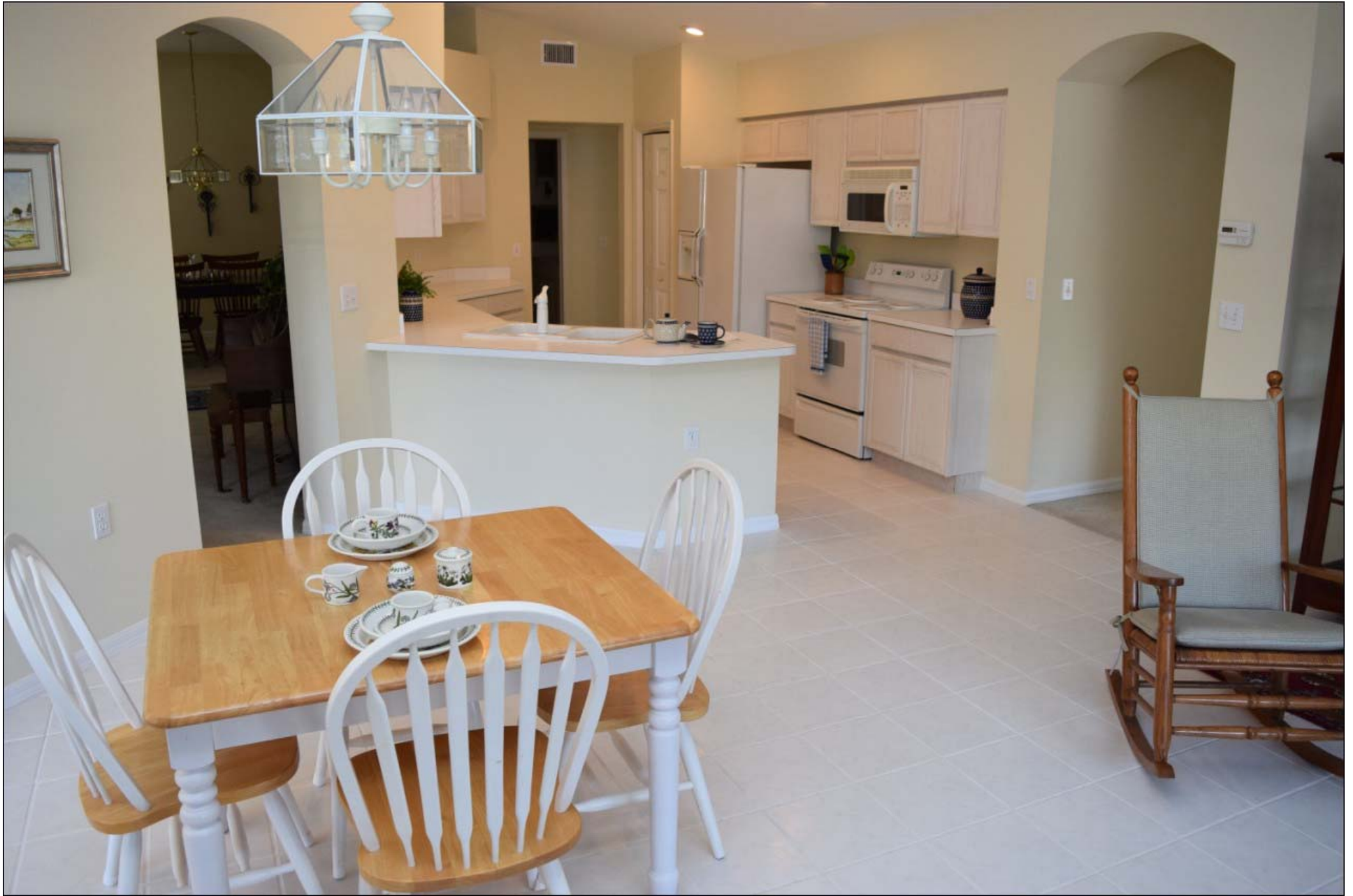
Dinette onto Kitchen