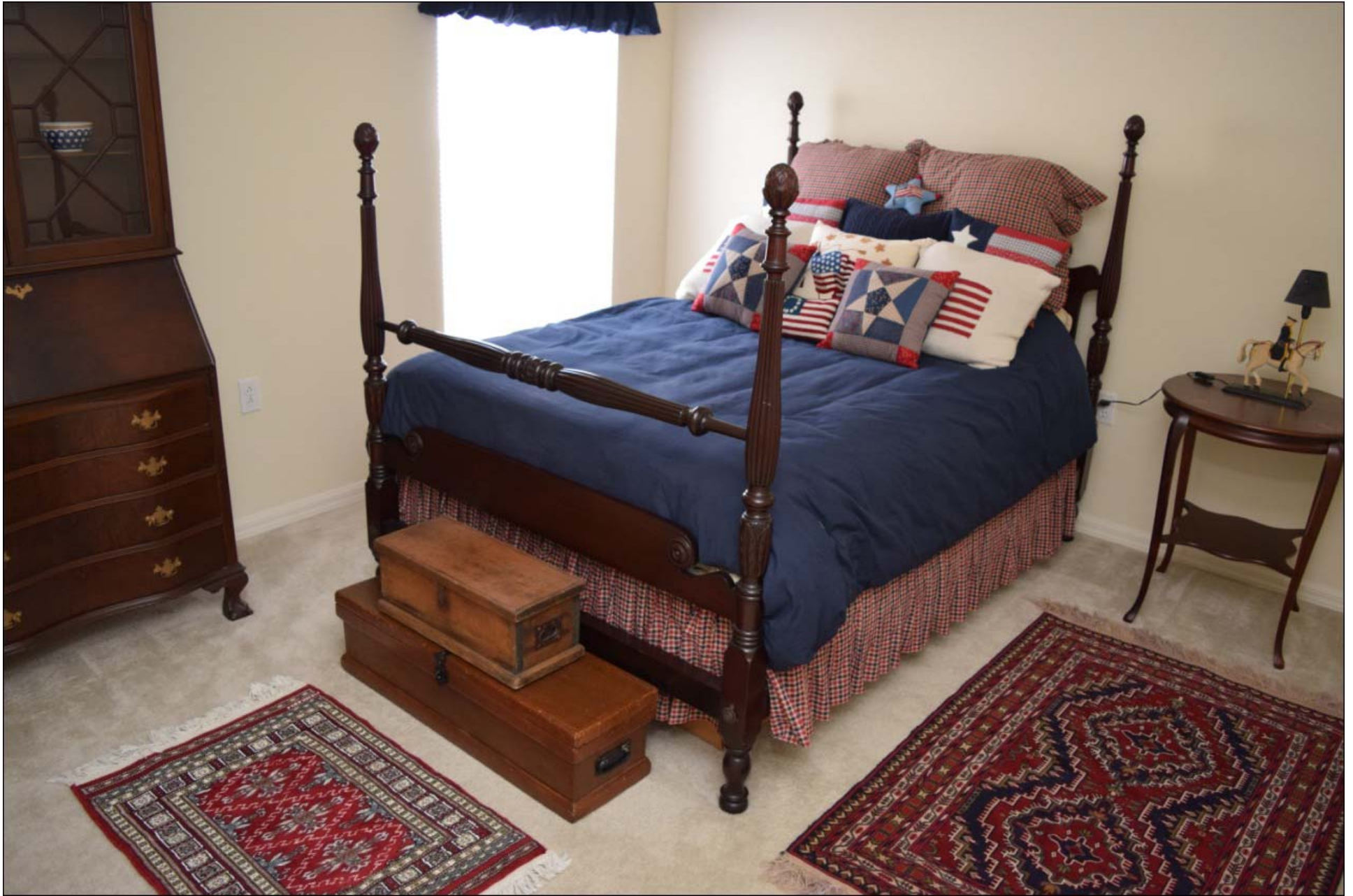
Bedroom 3 - 12X12