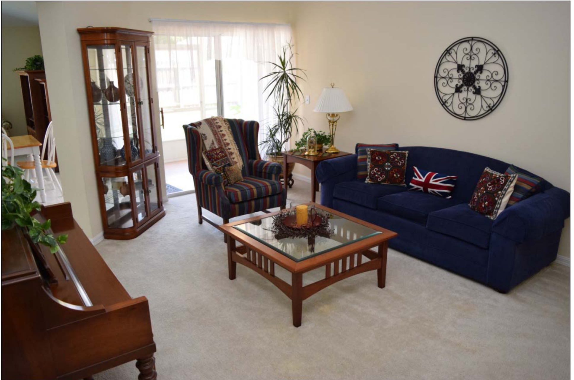
Formal Living Room with Sliding door on Back Patio 16x15