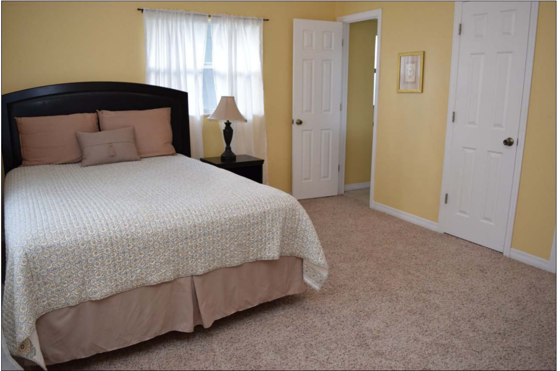
Master Bedroom with his&hers closets