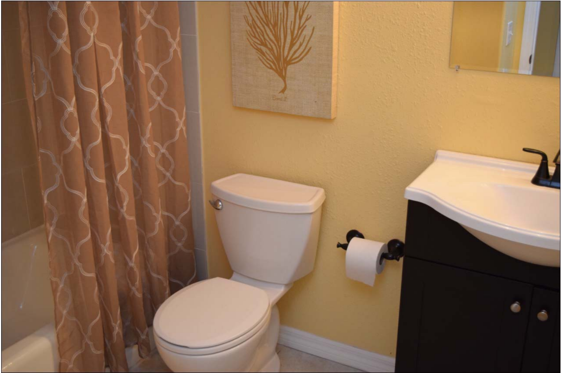
Bathroom 2 with vanity, mirror & shower-in-tub