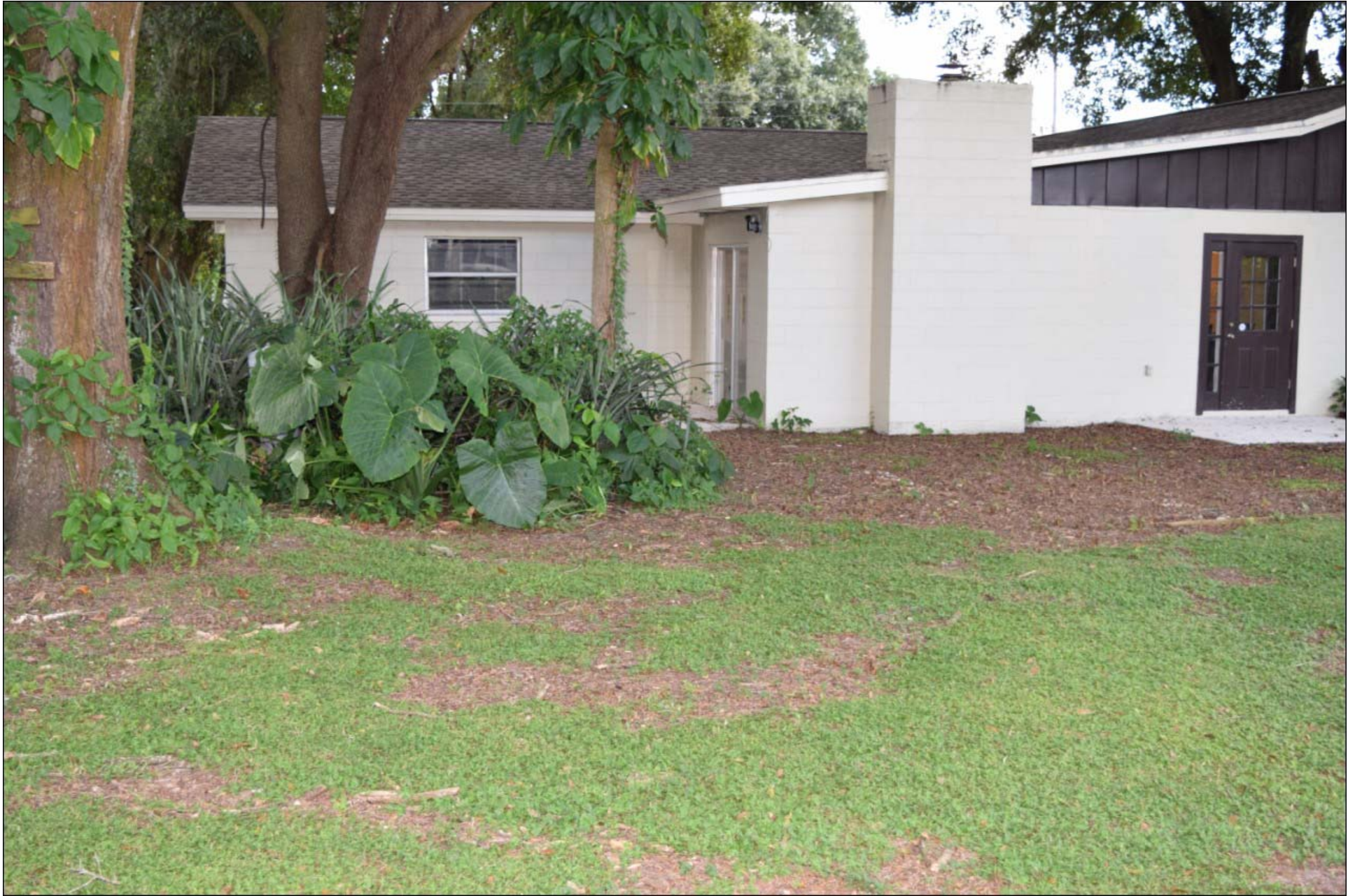
Back doors & patios off Dining & Living Rooms