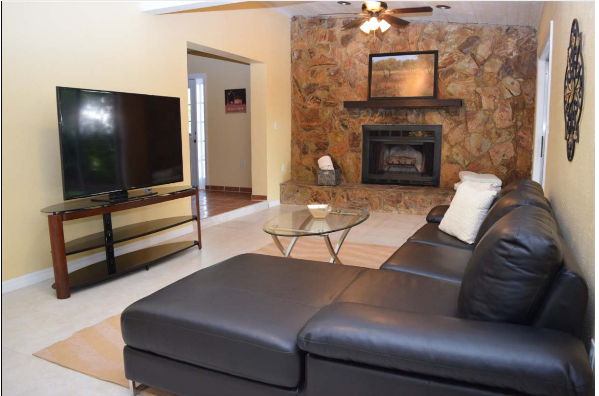
Living Room with wood burning fire place