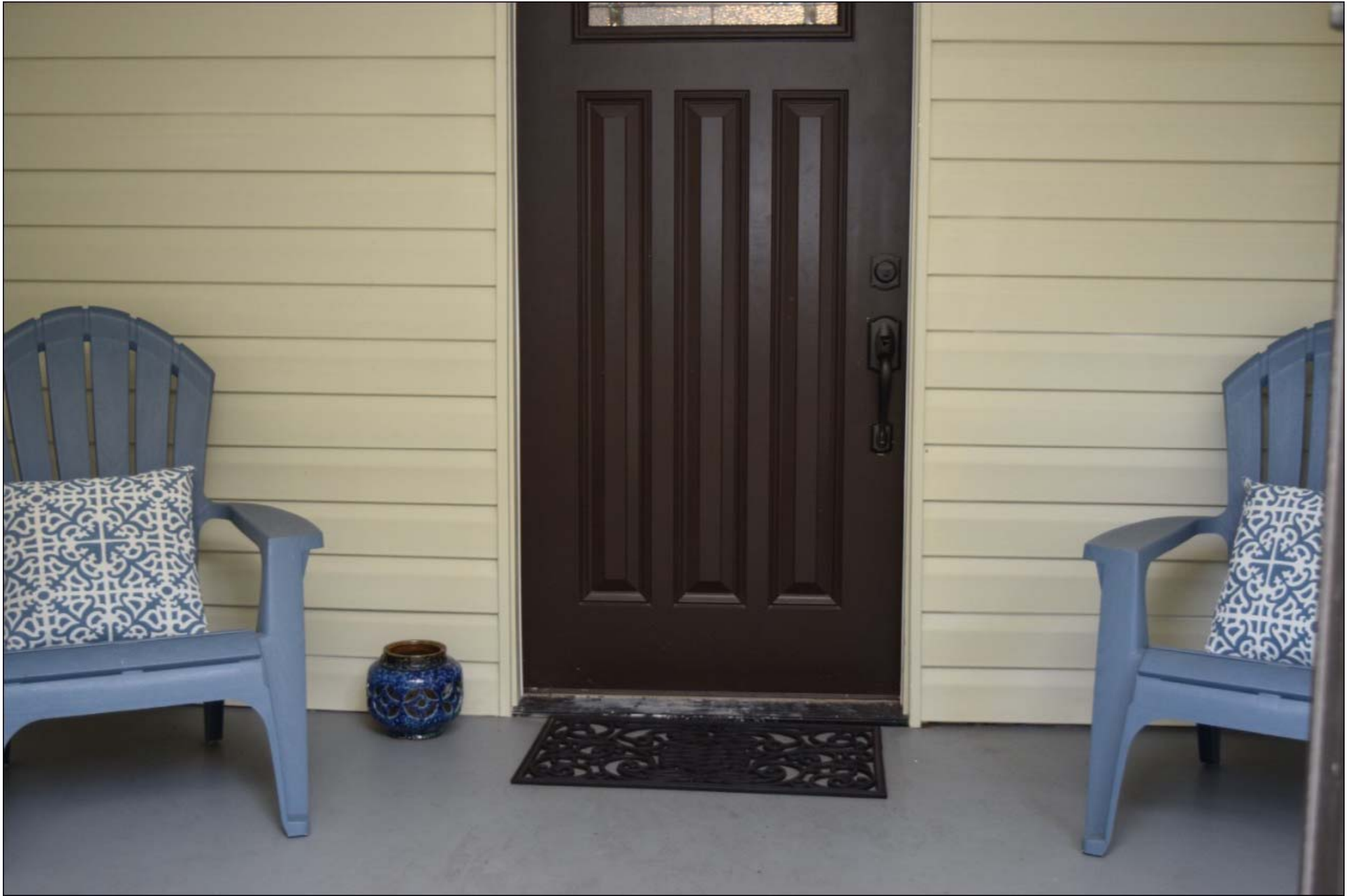
Front Porch – Front Door