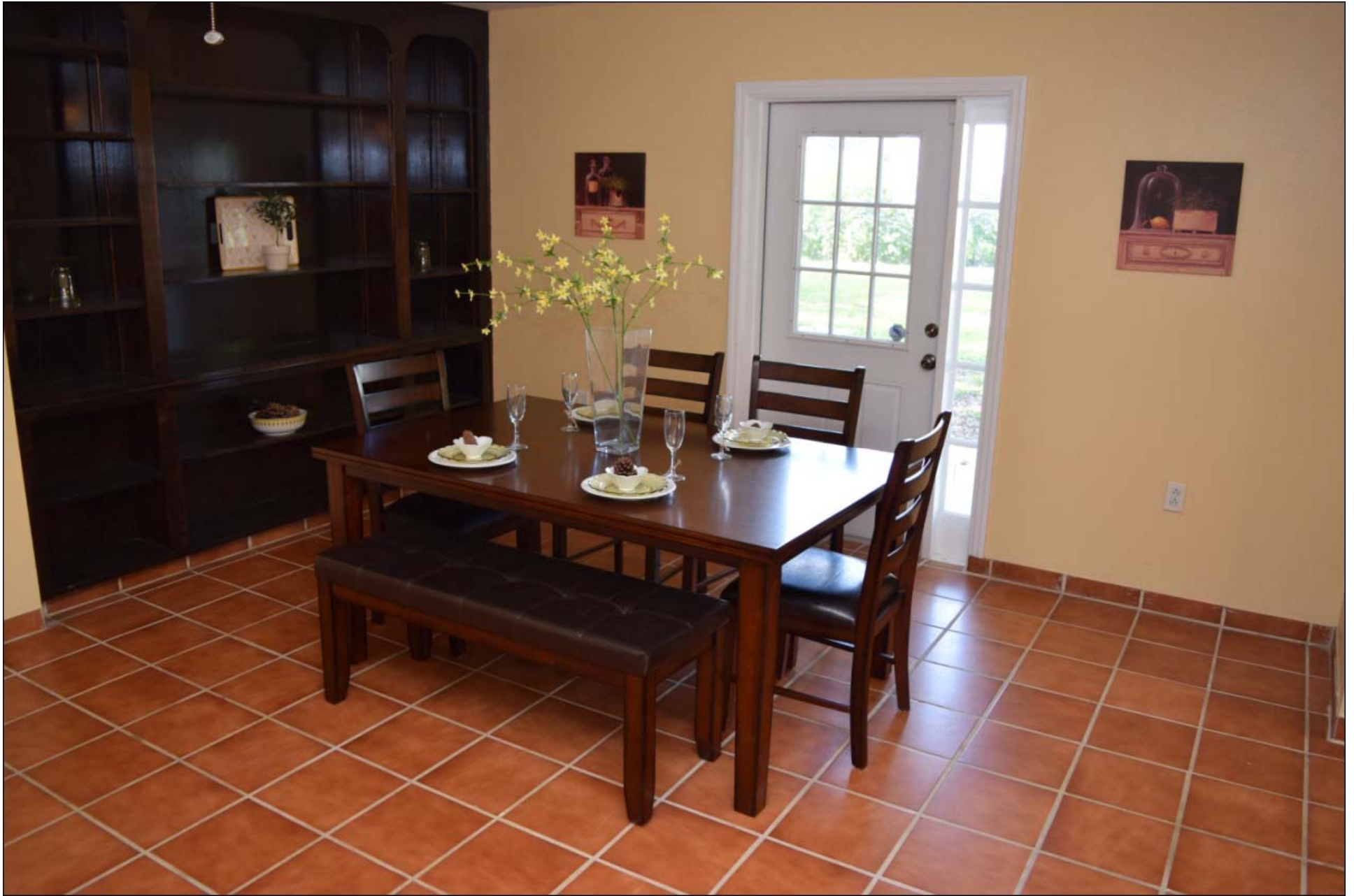
Dining Room with French door to back yard giving natural light