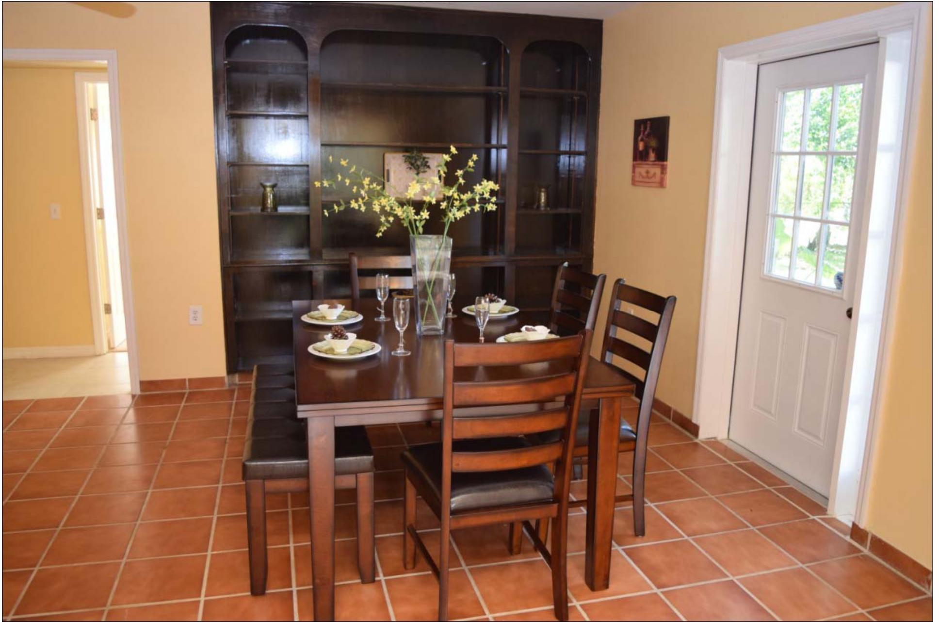
Large Dining Room porcelain floor tiles 16' x 16'