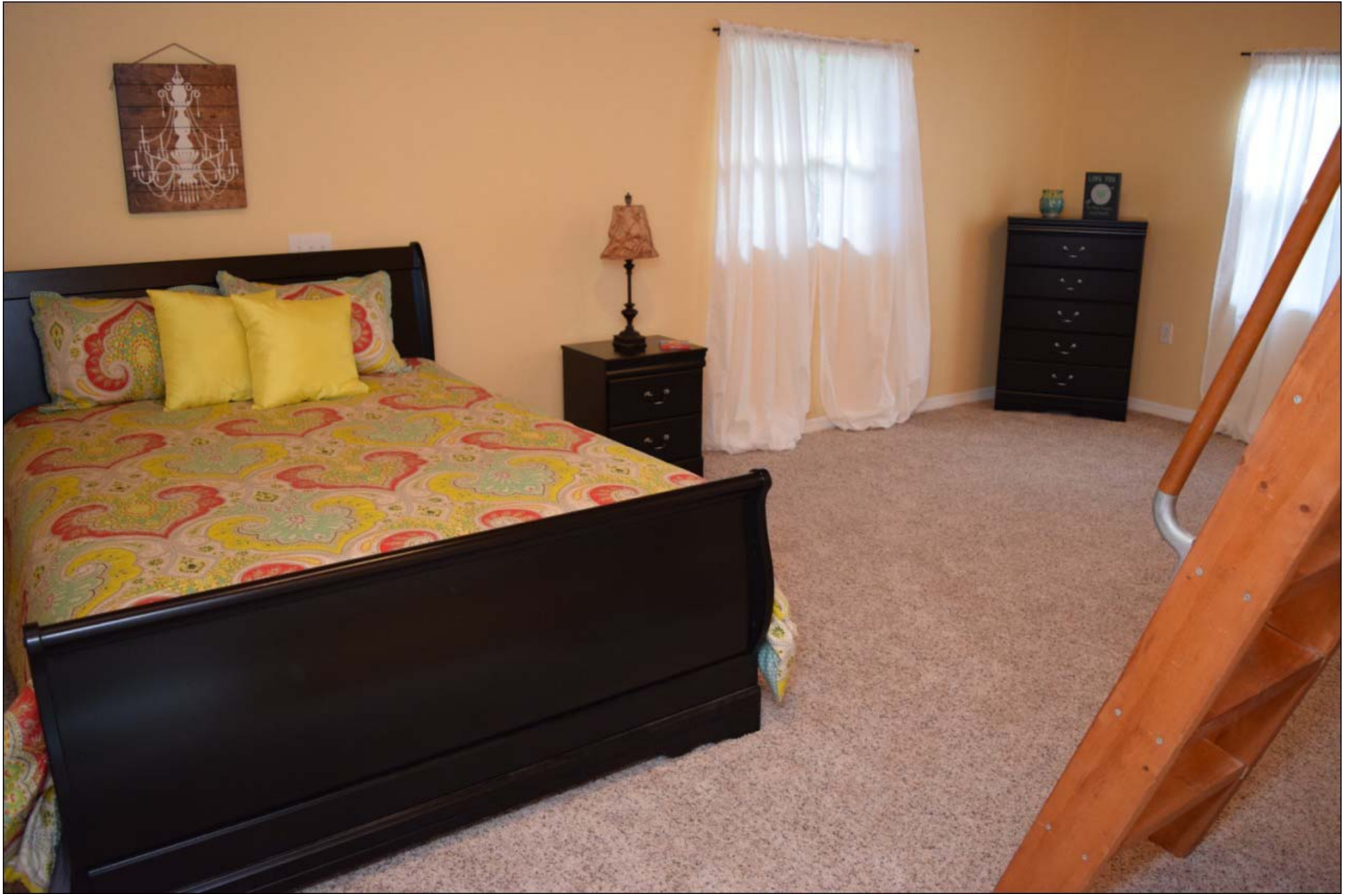
Large Bedroom 2 – 20' x 12'