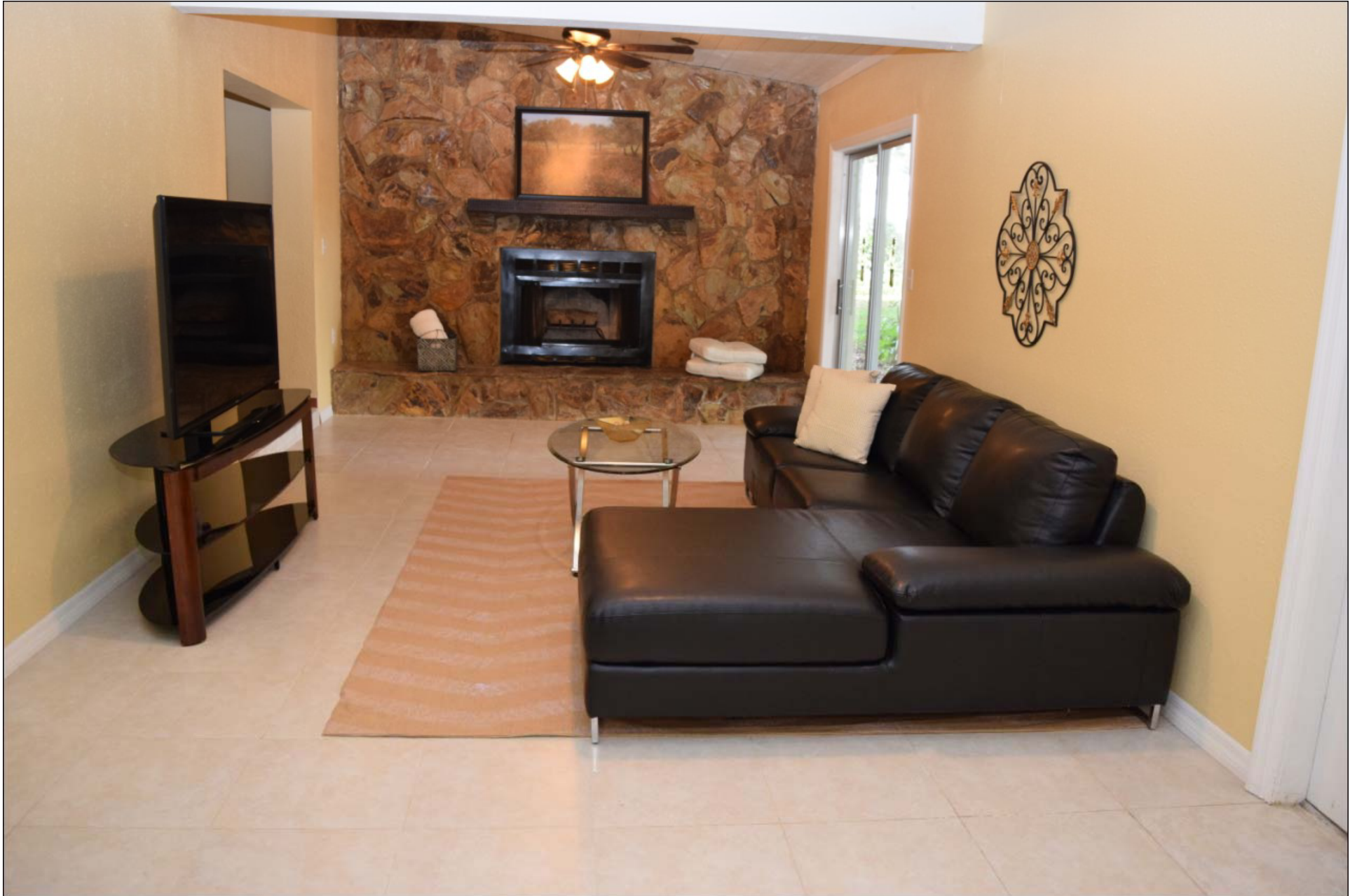
Large Living Room with sliding doors to back patio 25' x 12'