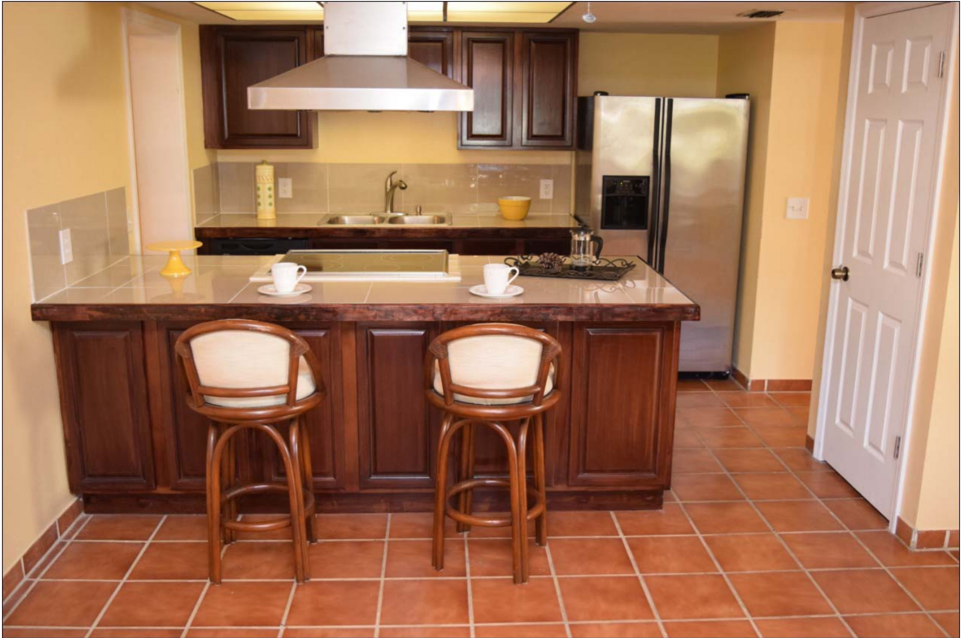
Kitchen with Breakfast Bar & Closet Pantry 16' x 11'