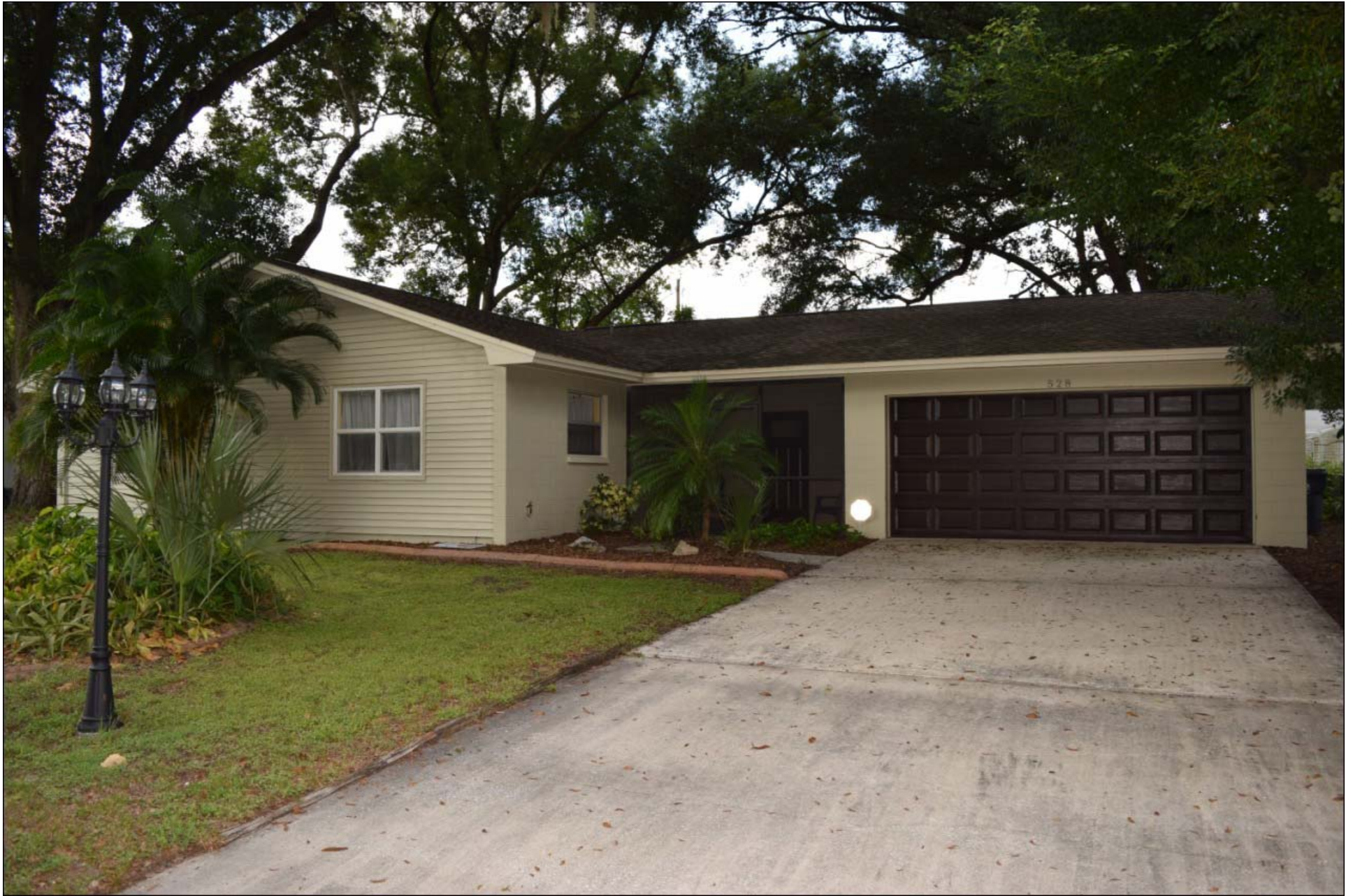
Front View – .27 Acre level lot – NOT in a flood zone – Fenced