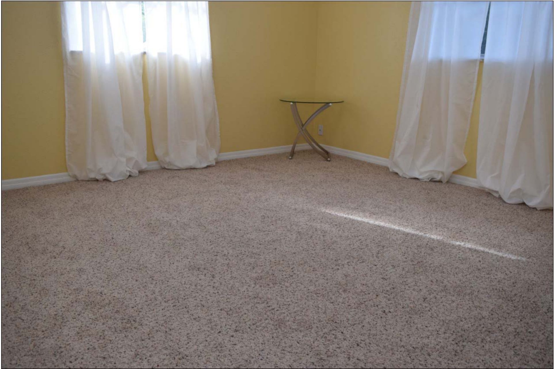
Bedroom 4 with back & side windows – 12' x 12'