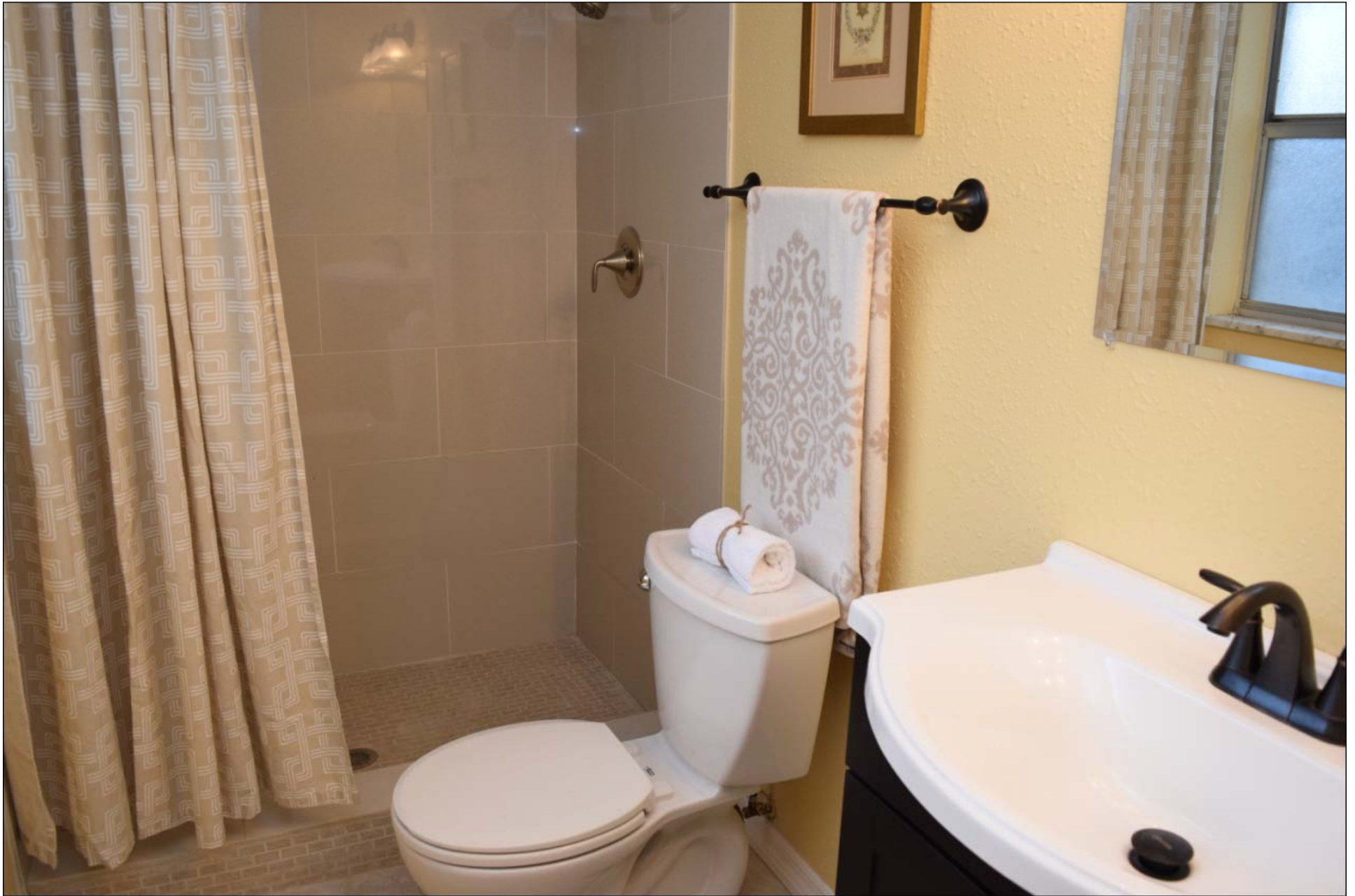
Master Bathroom with vanity, mirror & walk-in shower