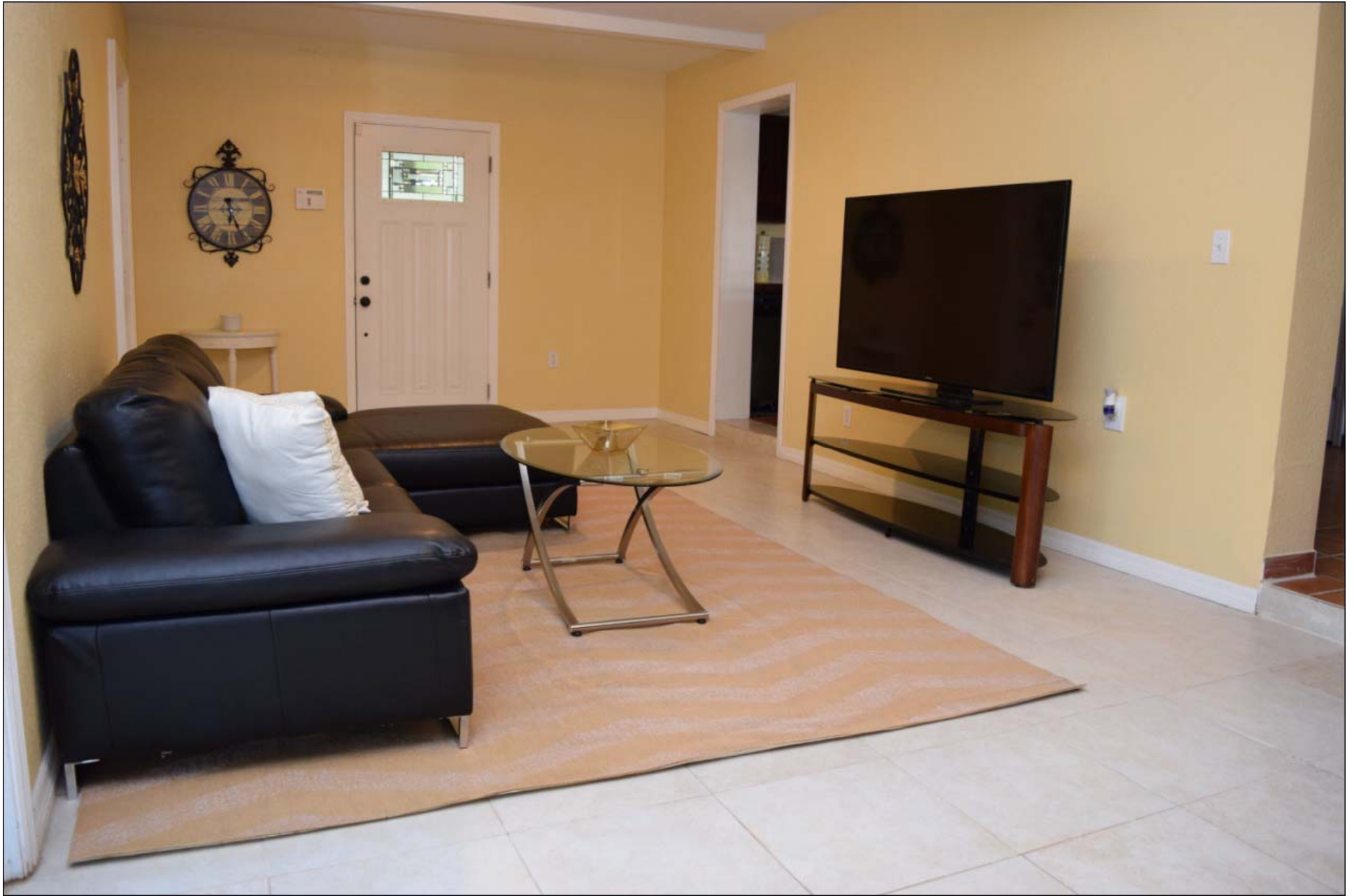
Living Room with ceramic floor tiles