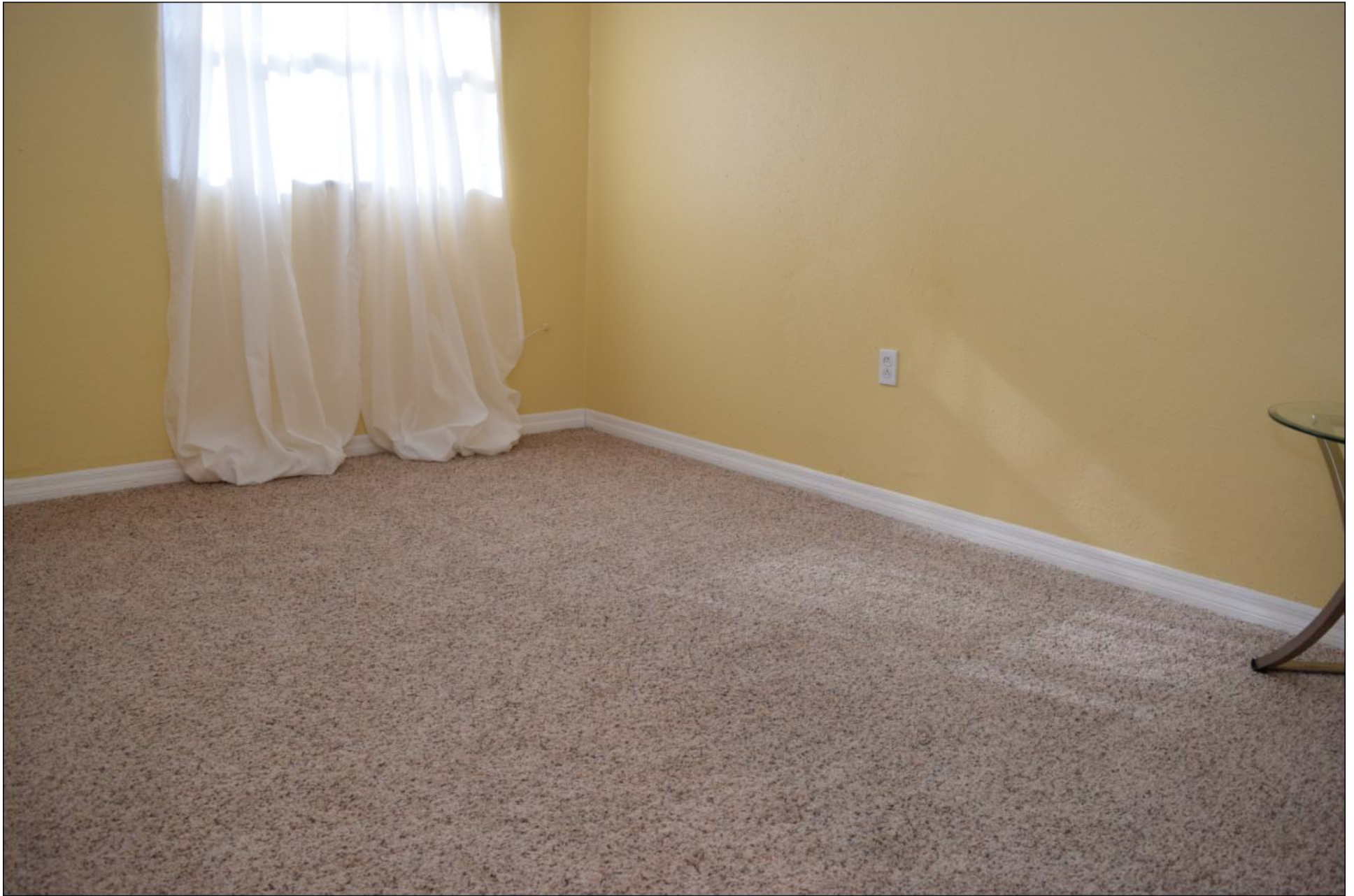
Bedroom 3 – 12' x 9'