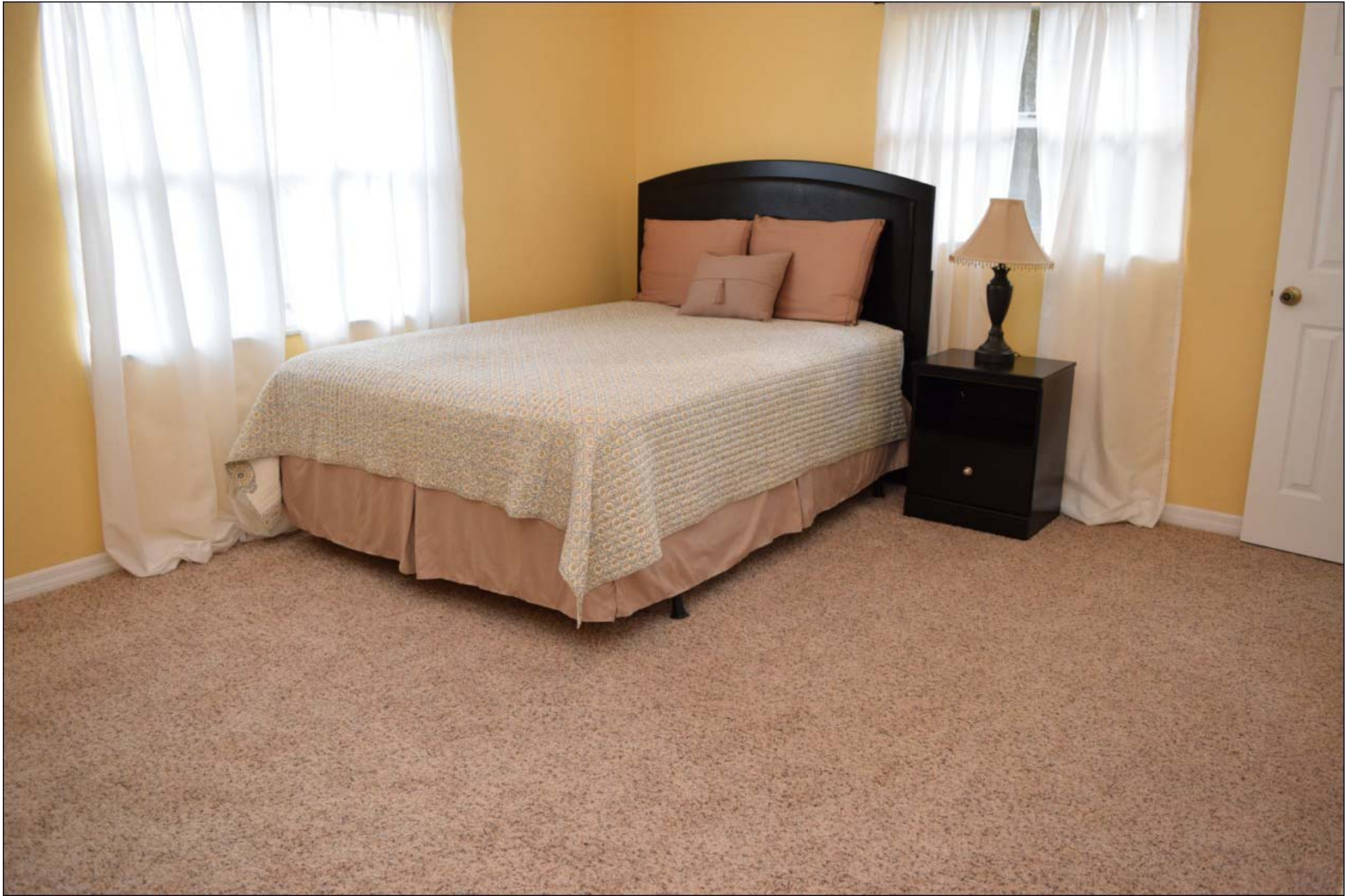
Master Bedroom 15' x 12'