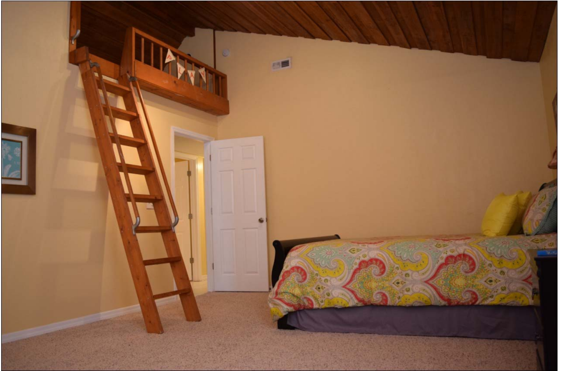
Bedroom 2 with adorable upstairs play Loft