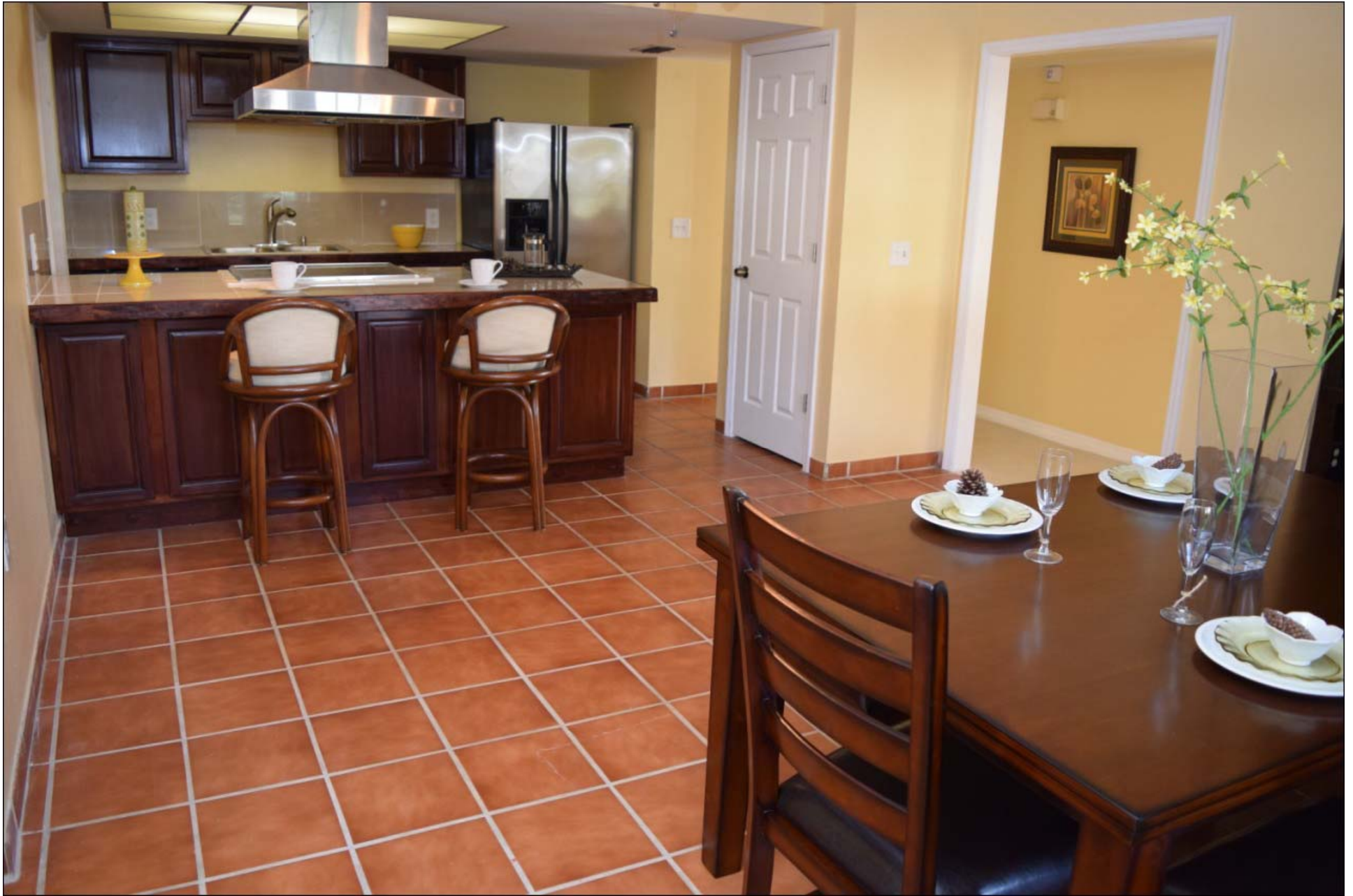
Dining Room onto Kitchen