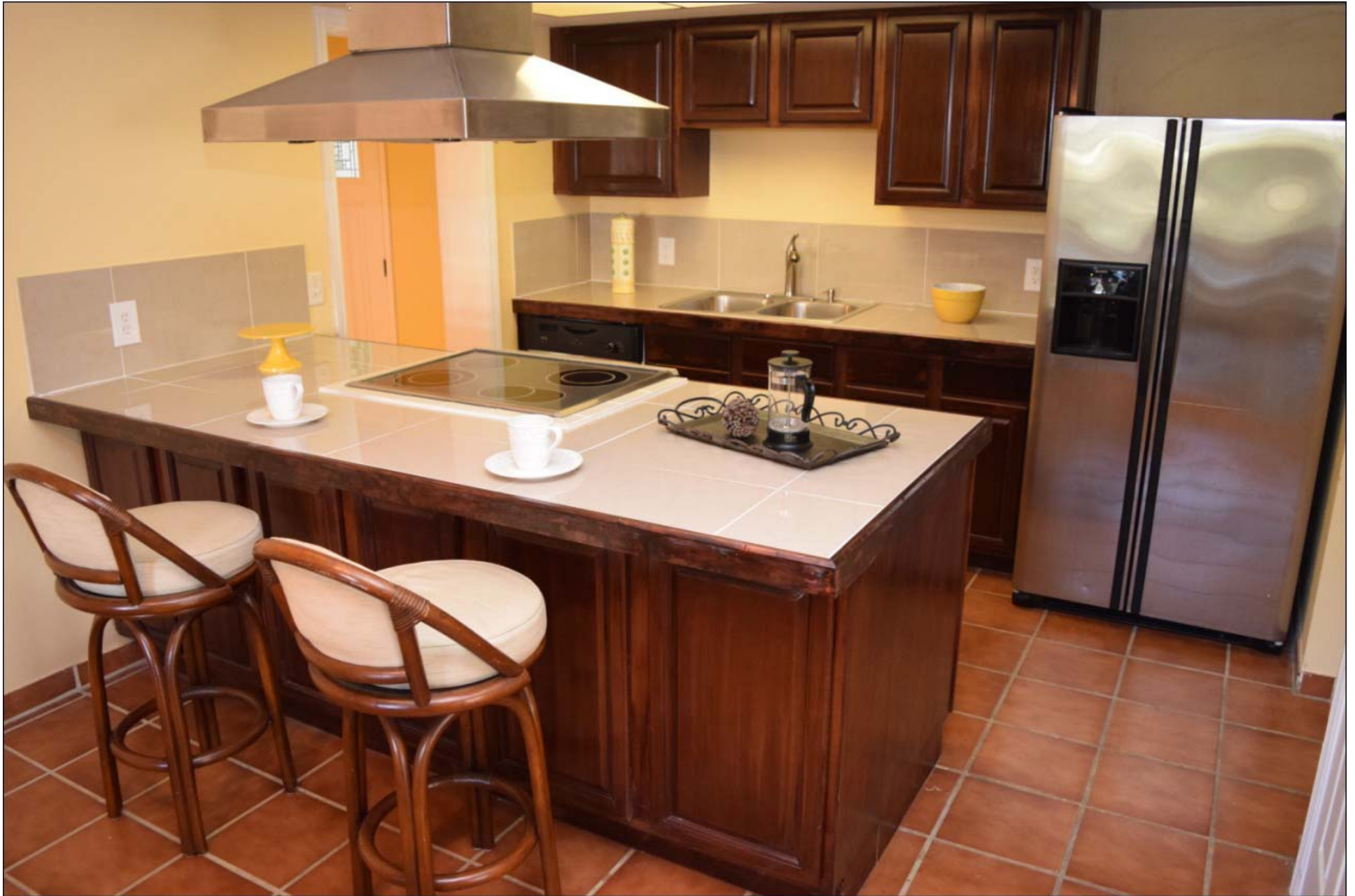
Kitchen with range & stainless steel extractor hood