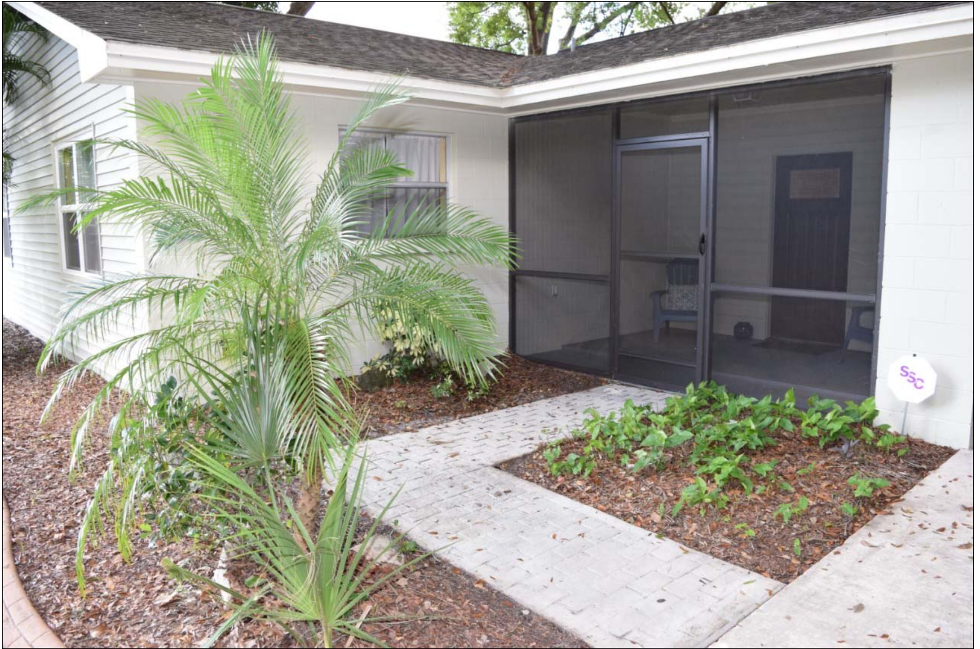
Front Entrance with screened-in Front Porch