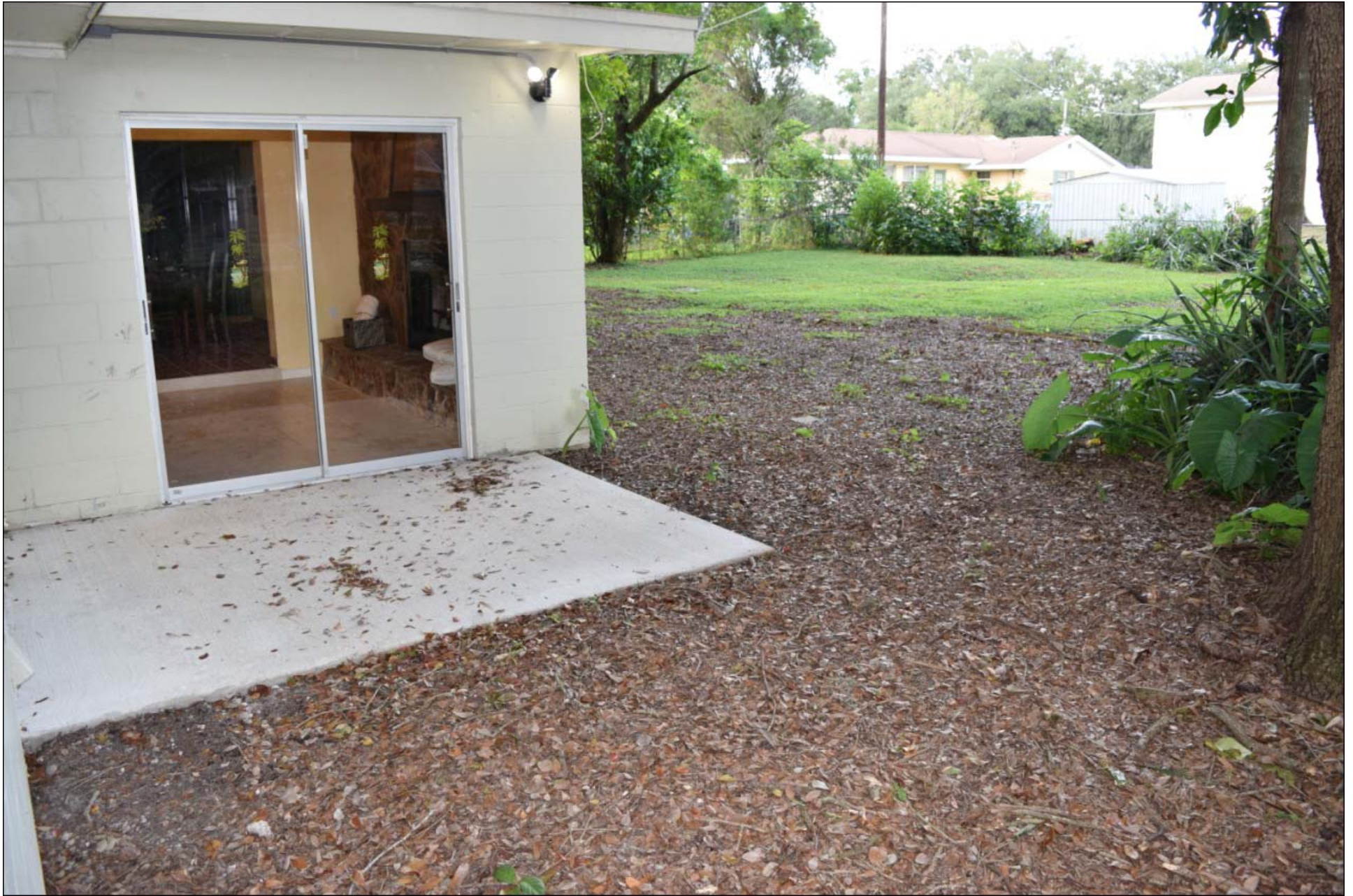
Back patio off Living Room