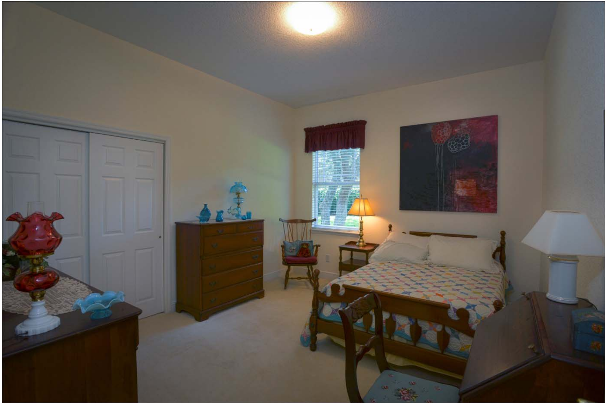
Bedroom 3 – 14' x 12'