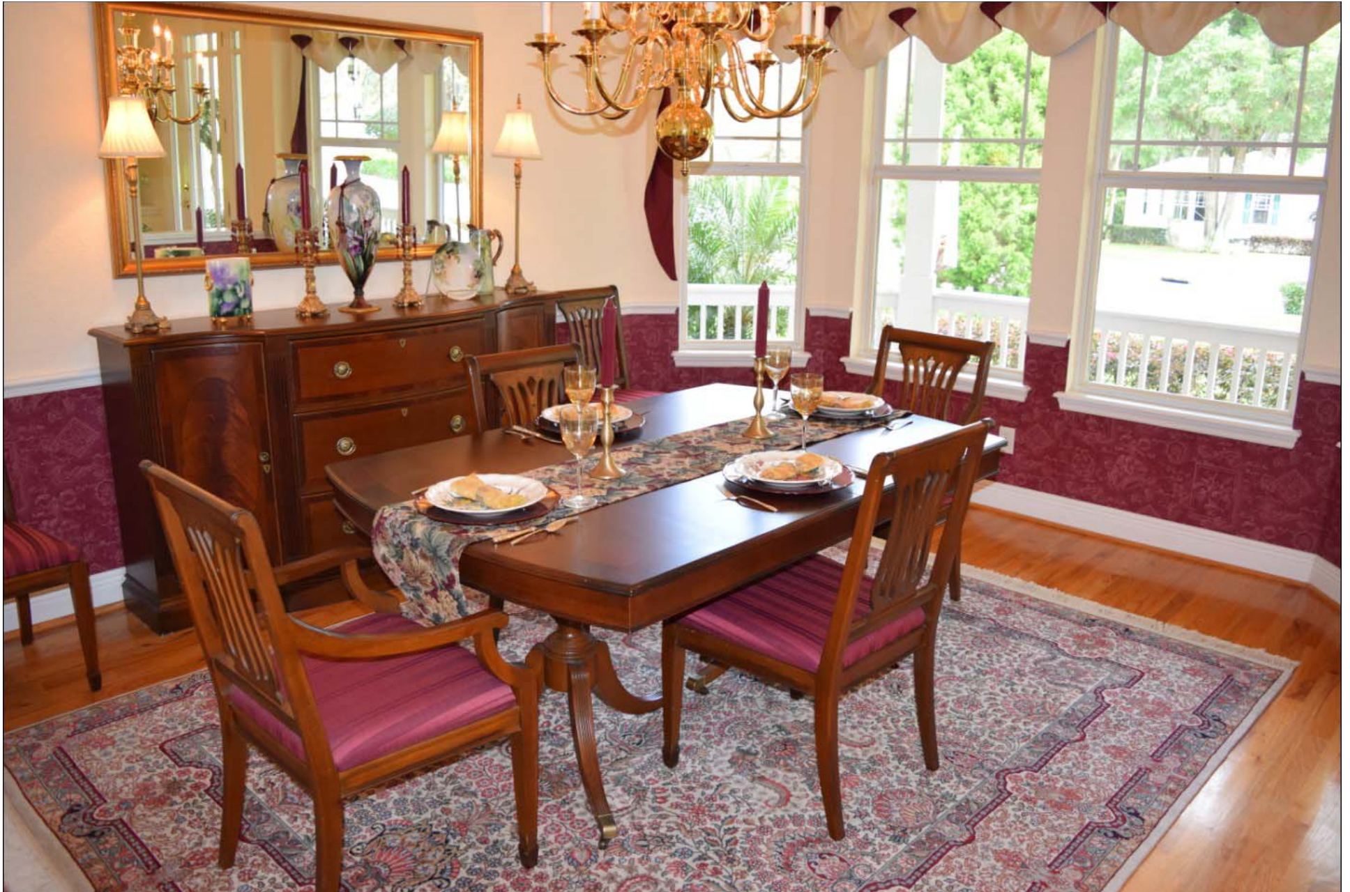
Formal Dining Room with bay windows 15' x 12'