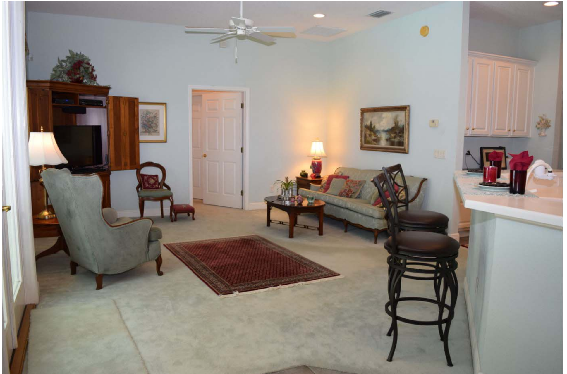
Open Plan Family Room 15' x 15'