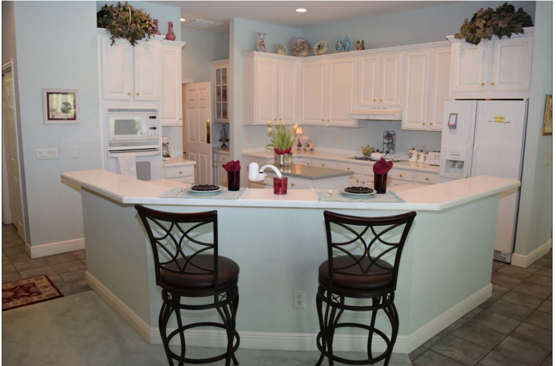
Kitchen with walk-in-pantry & office desk 15' x 15'