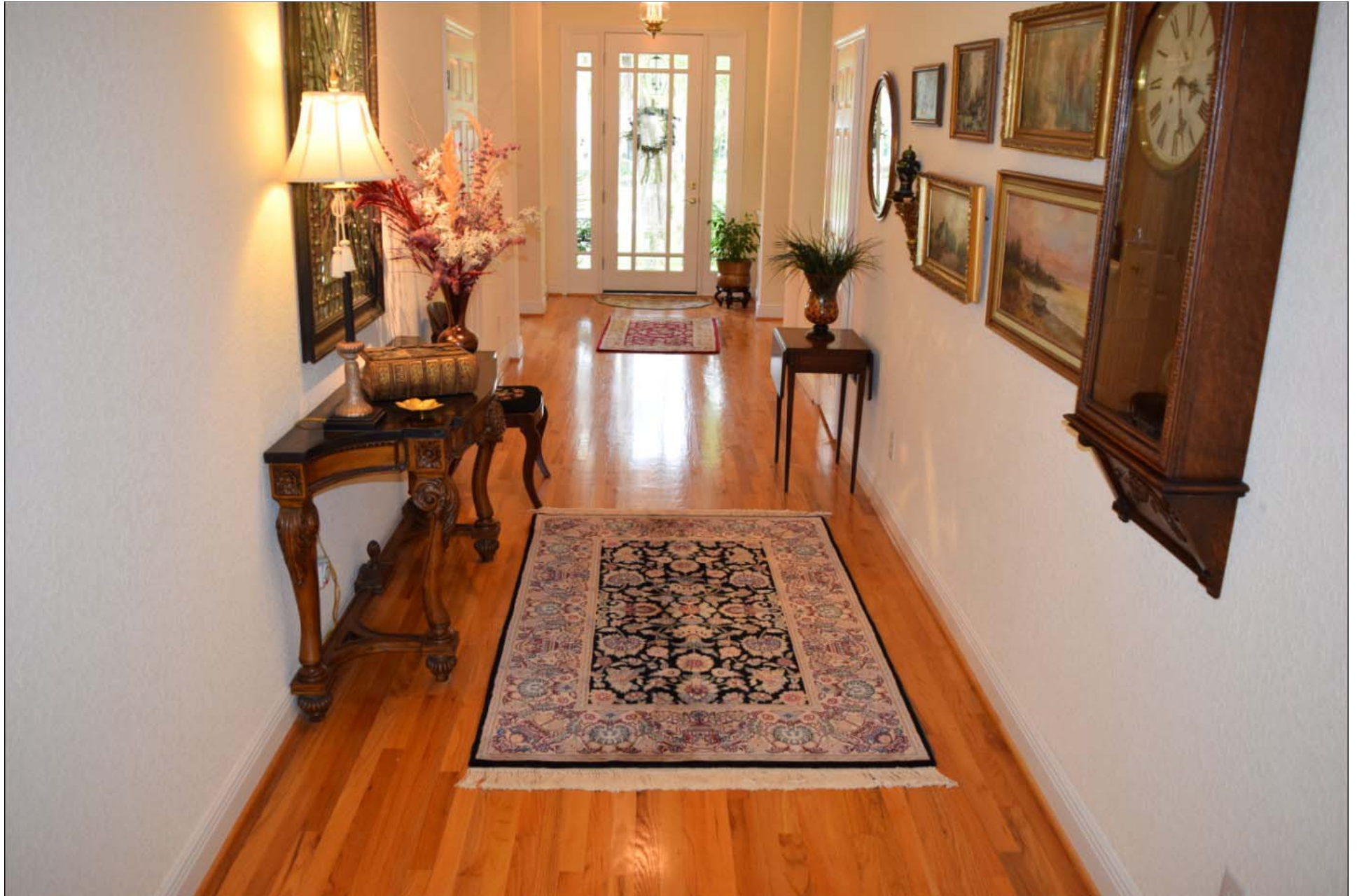
Hallway/Gallery – front to back of house