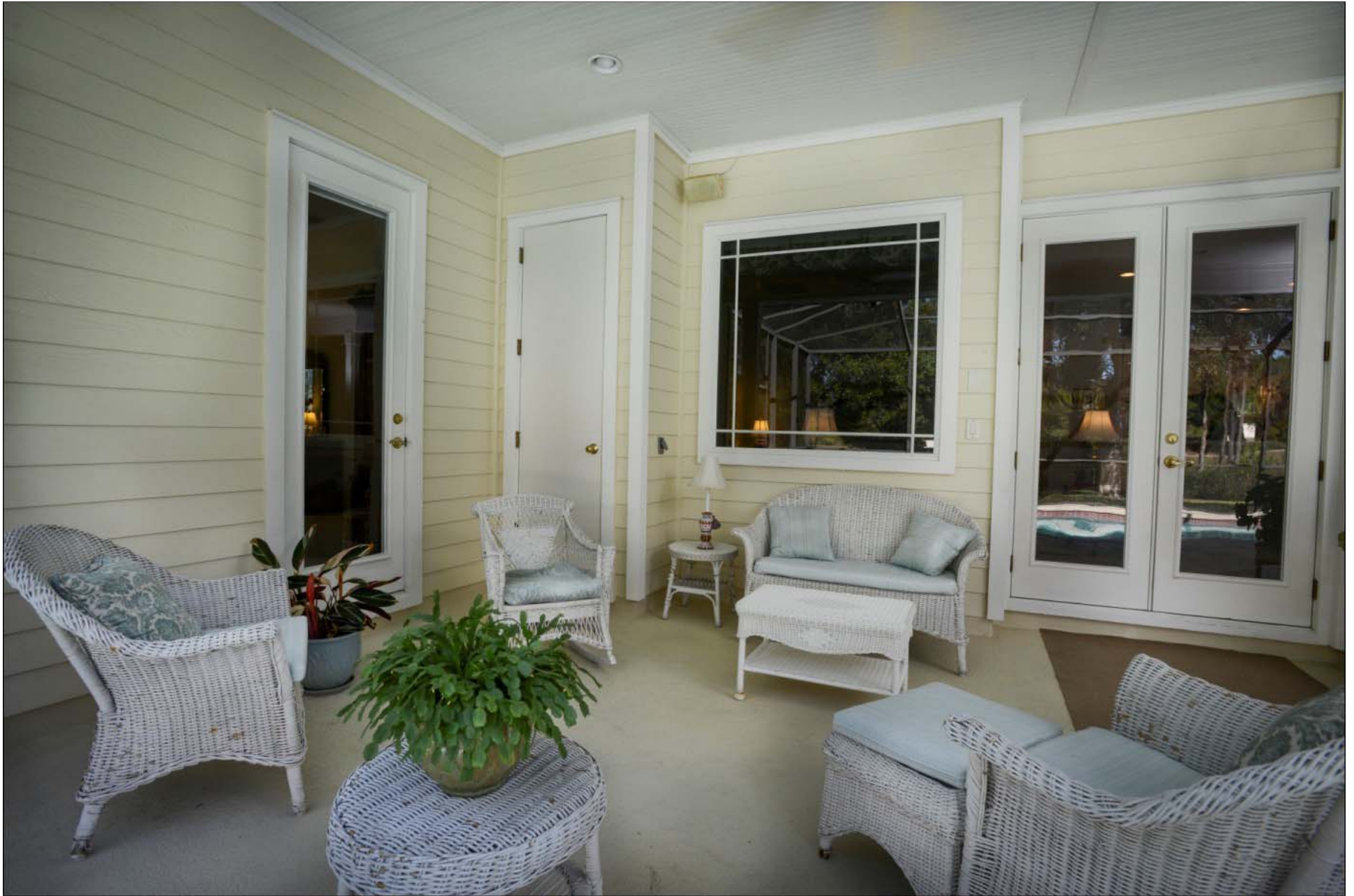
Sitting area on patio