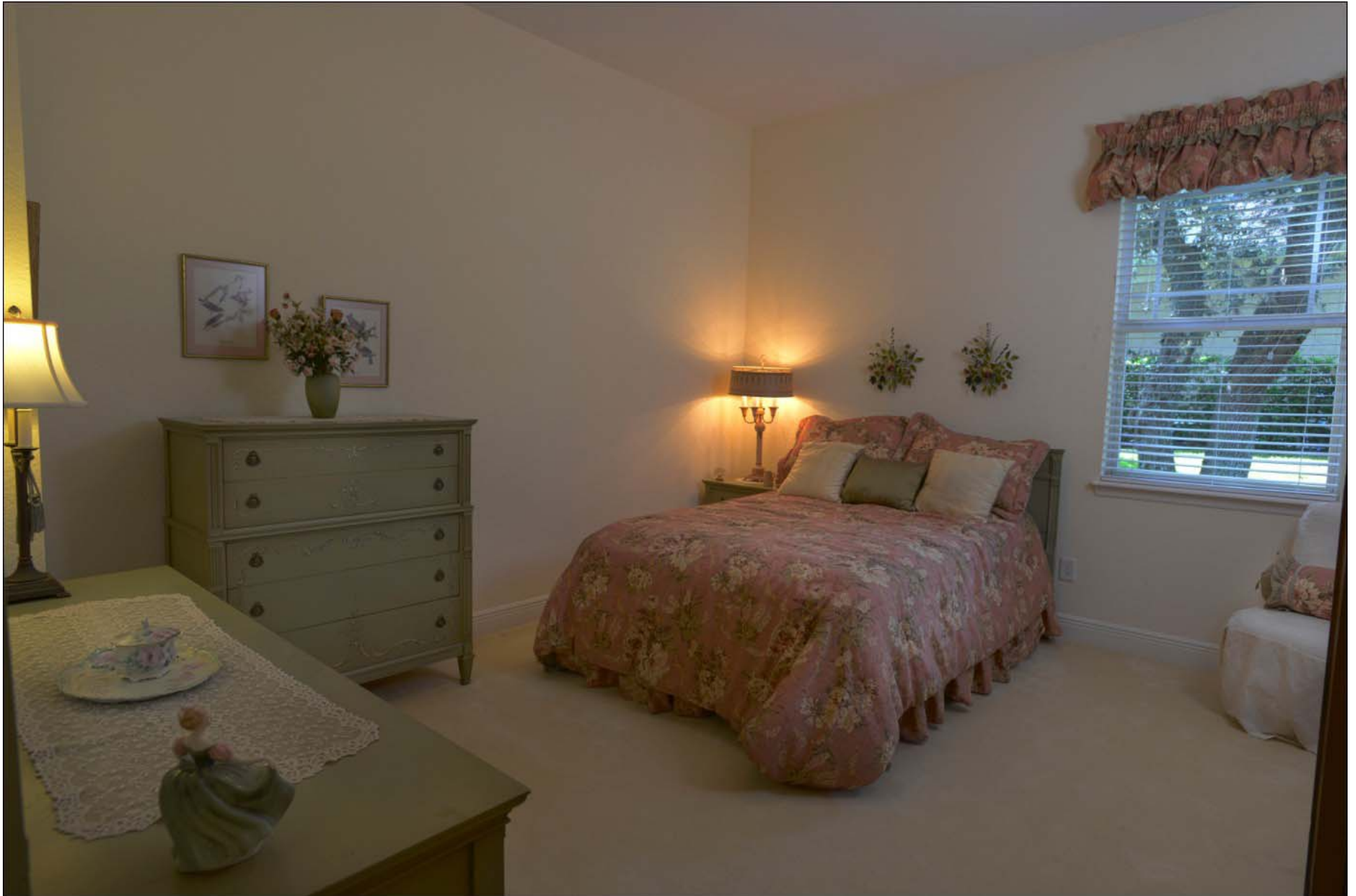
Bedroom 2 – 14' x 12'