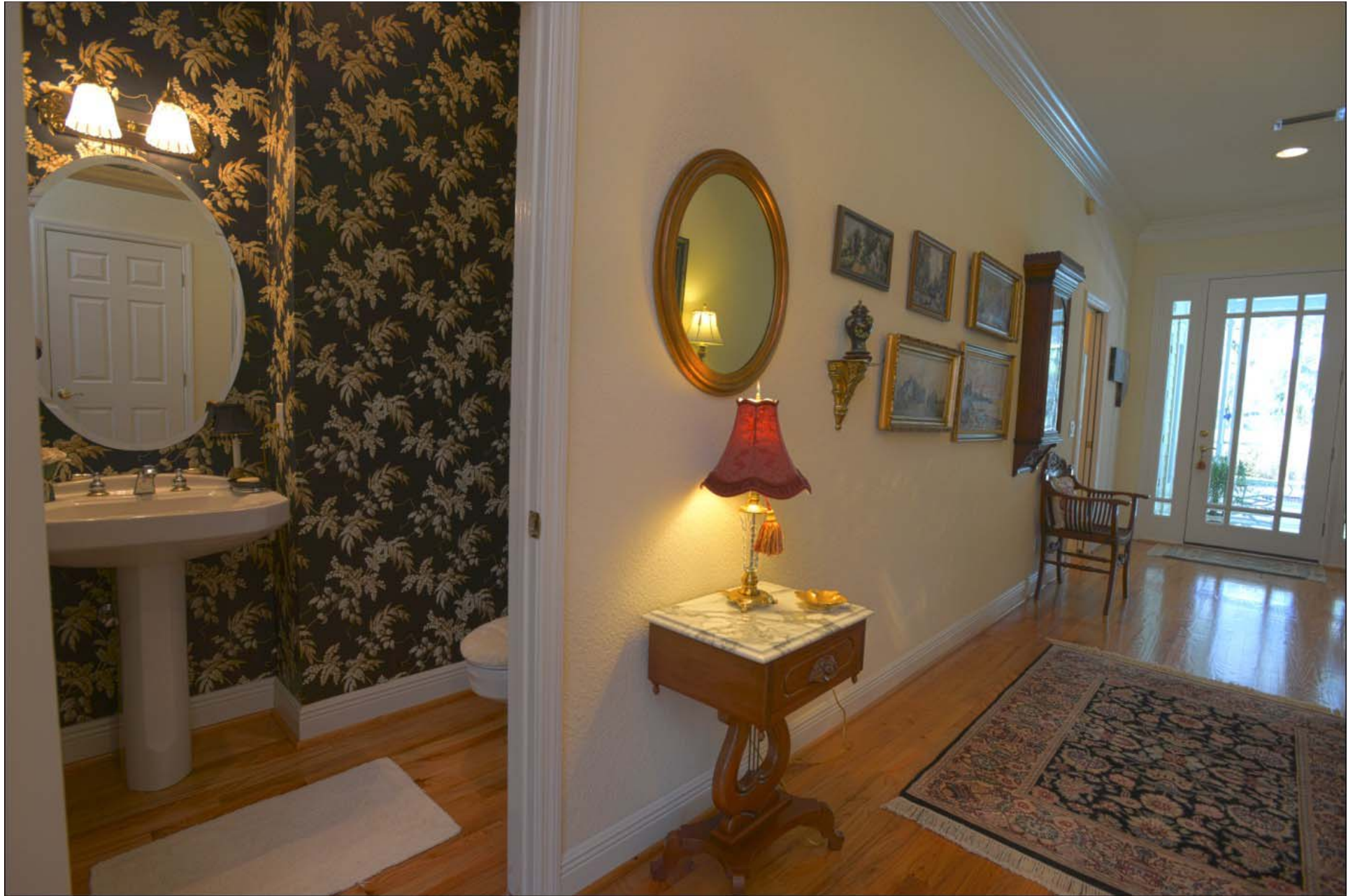
Half Bathroom off Hallway/Gallery