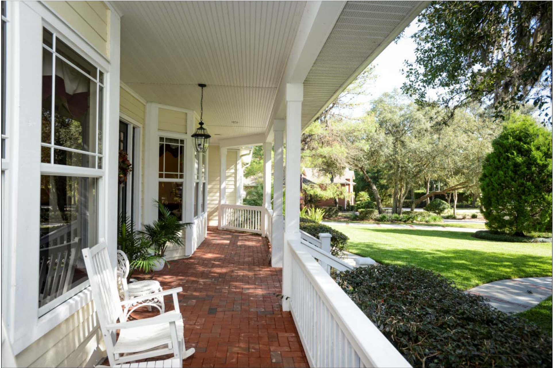
Large Front Porch with swing