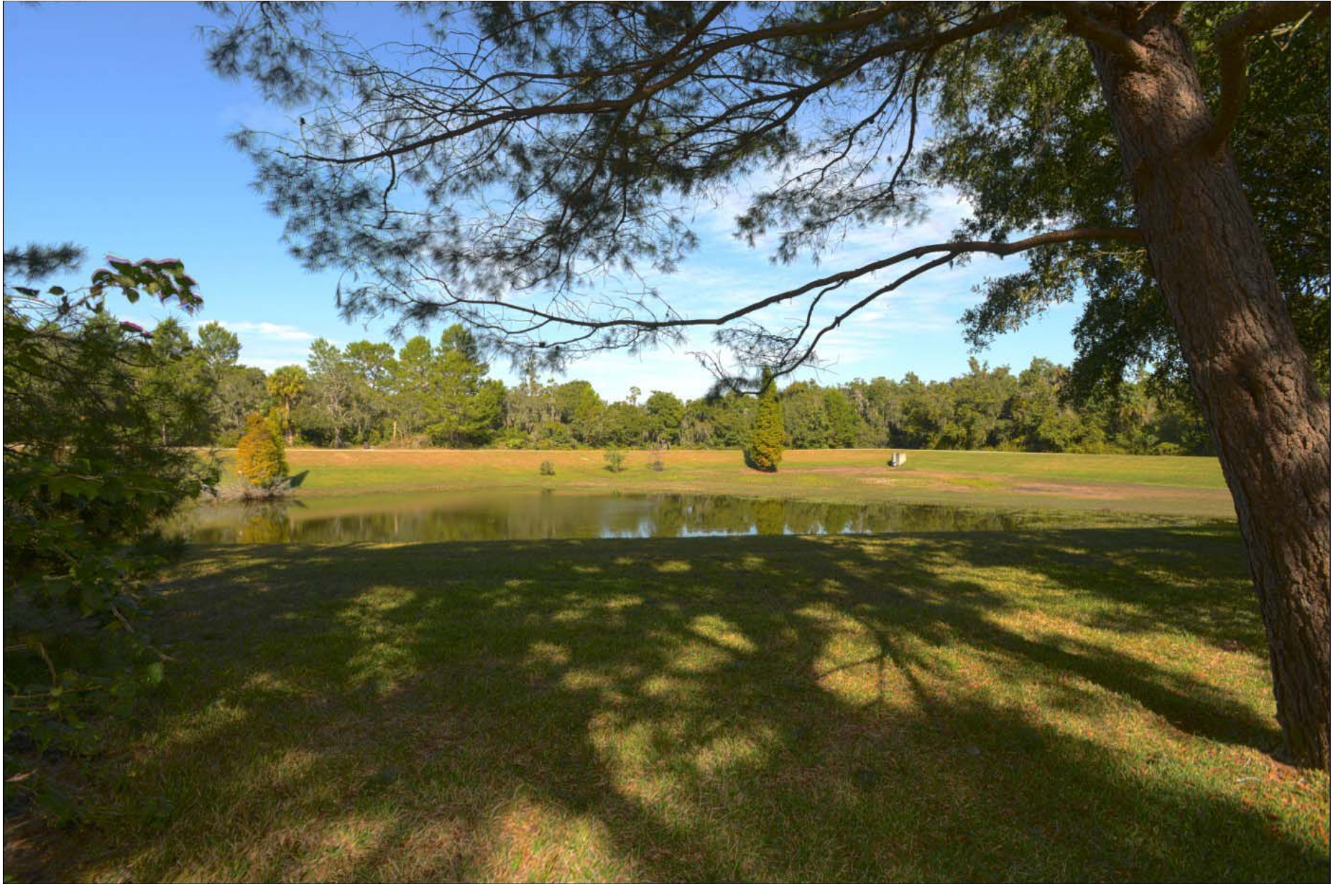
Back Pond & Conservation view with walking trails