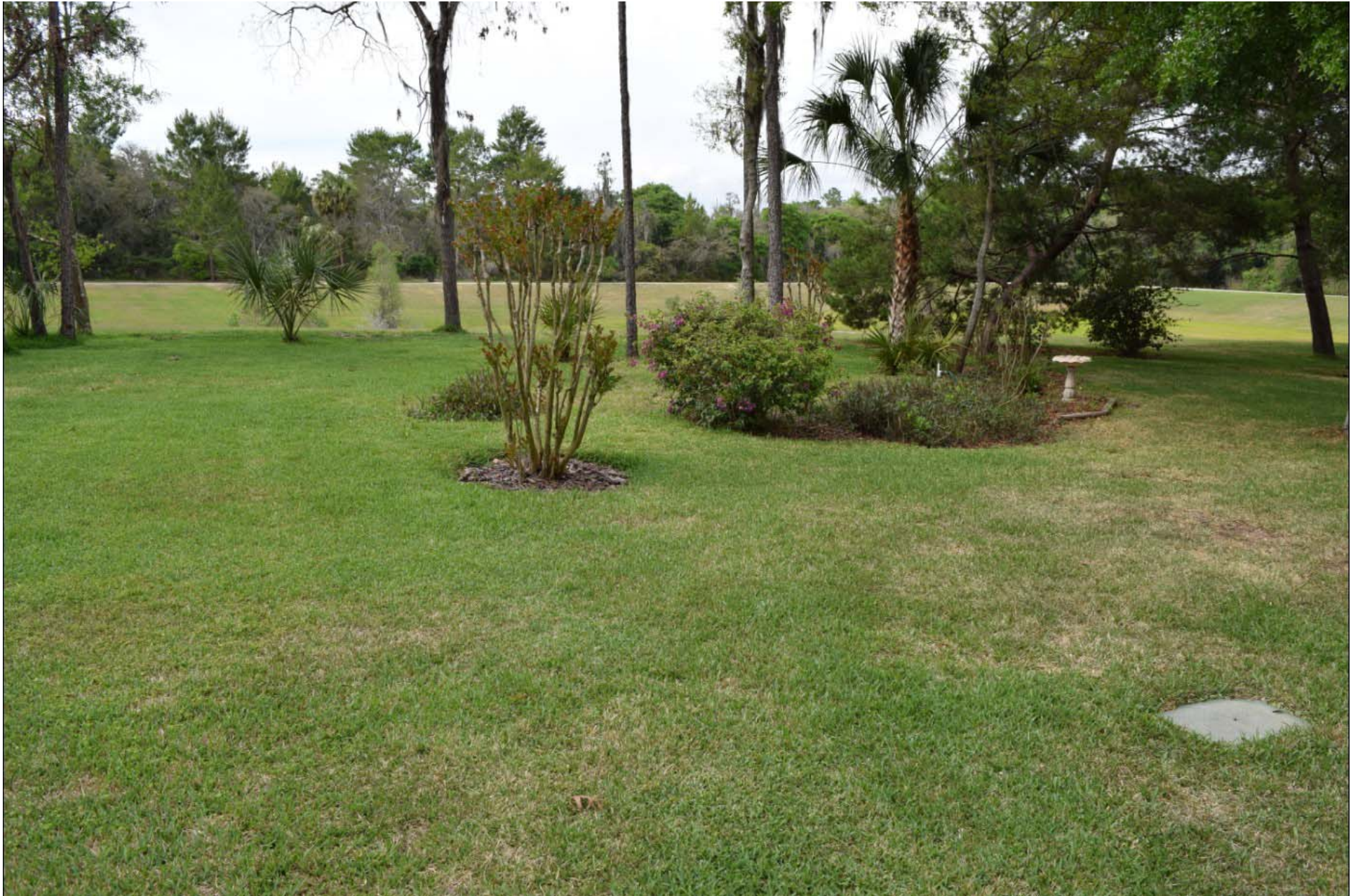
Large Back Yard with Stunning View