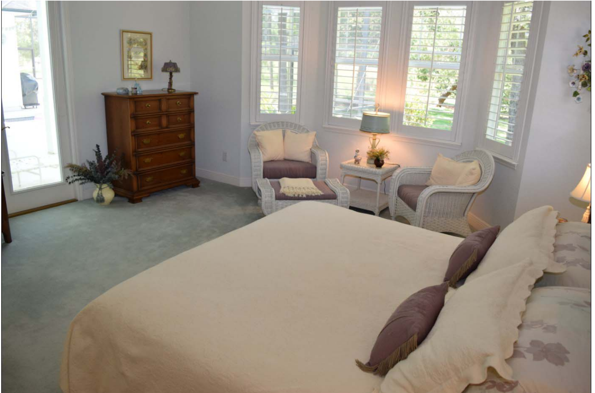
Master Bedroom – dual walk-in-closets 18' x 17'