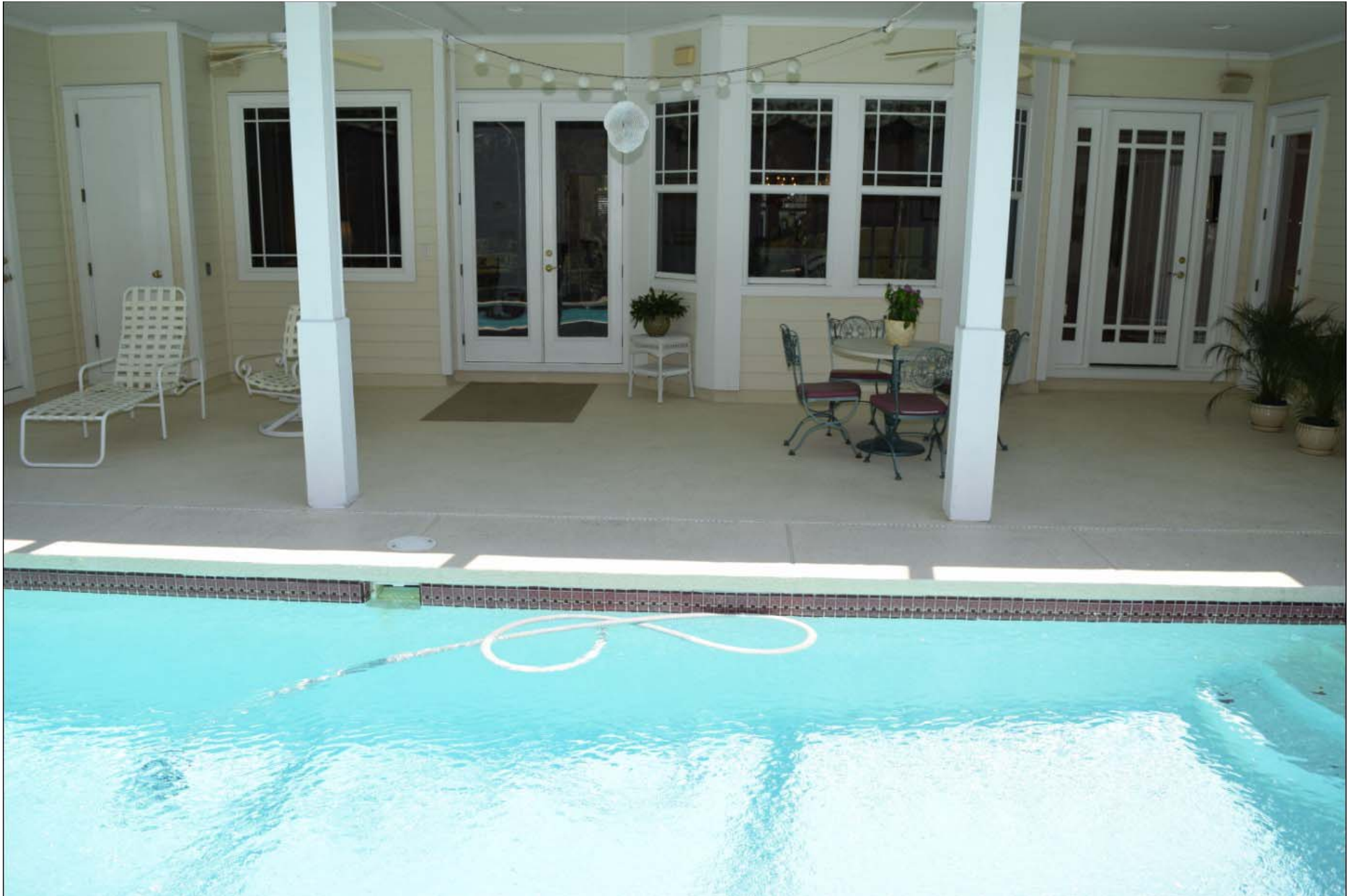
Pool & Large Privacy Entertainment Back Patio