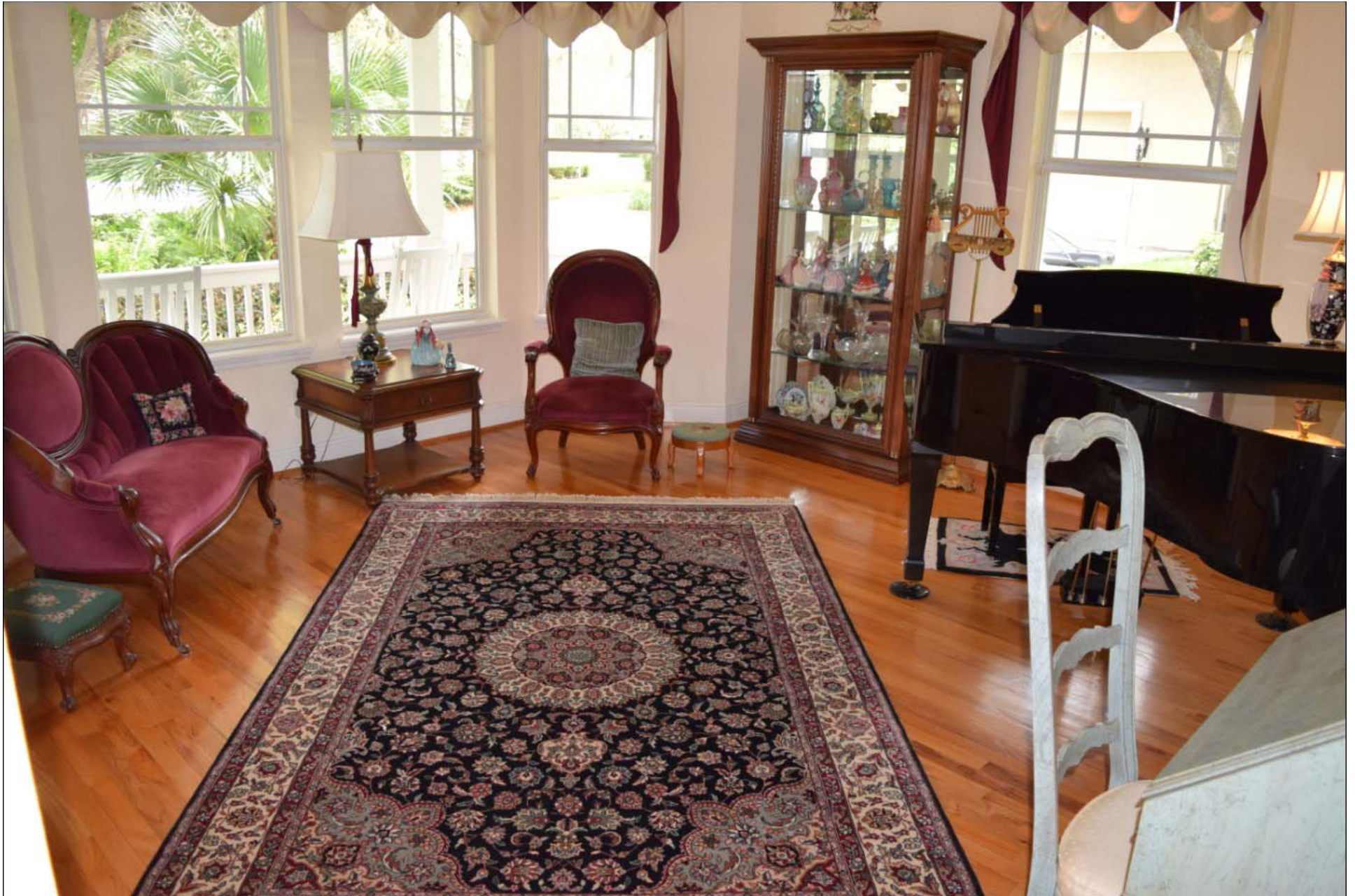
Formal Living Room with bay windows 15' x 15'