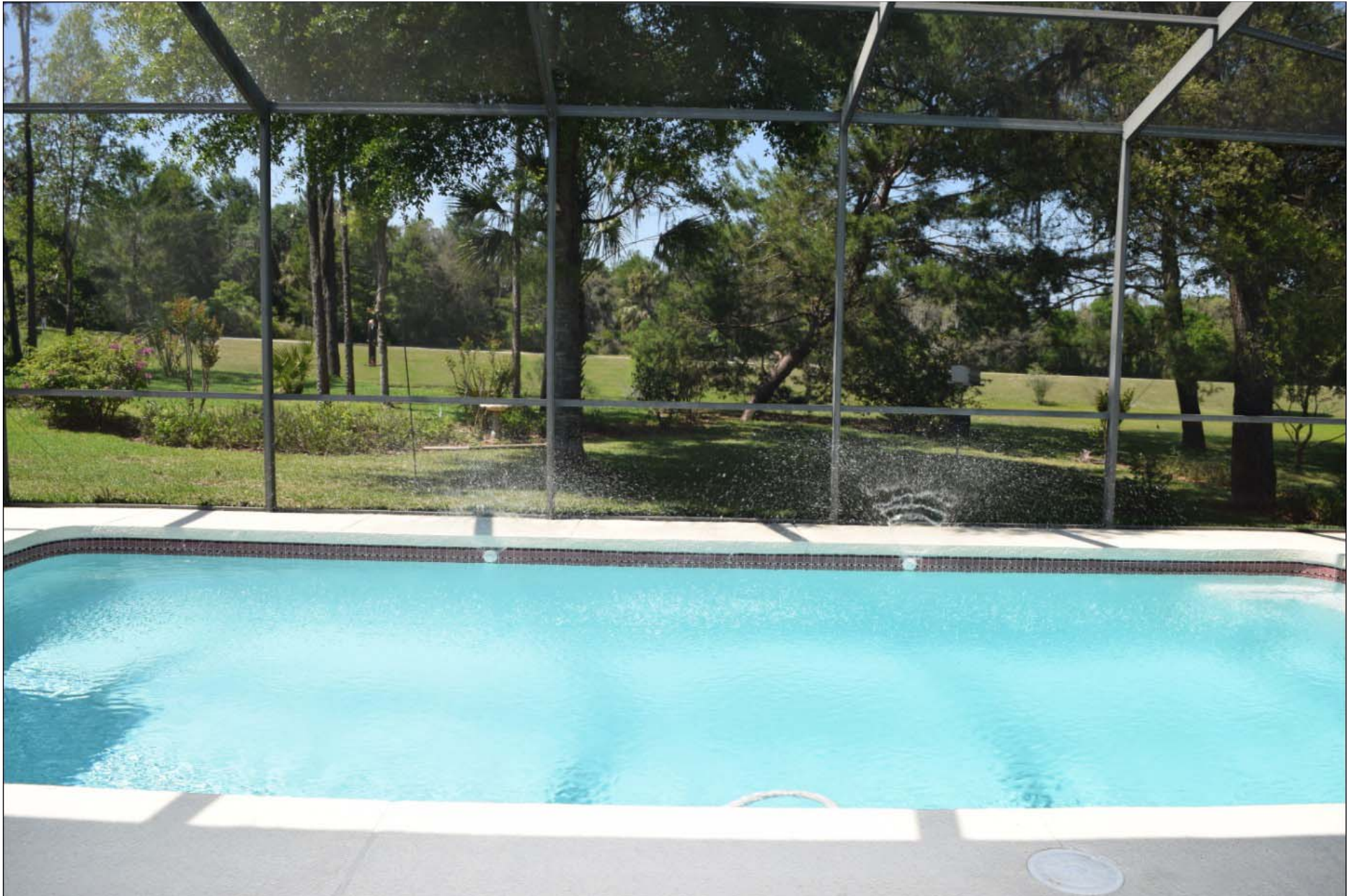
Pool & Lanai – several acres of conservation