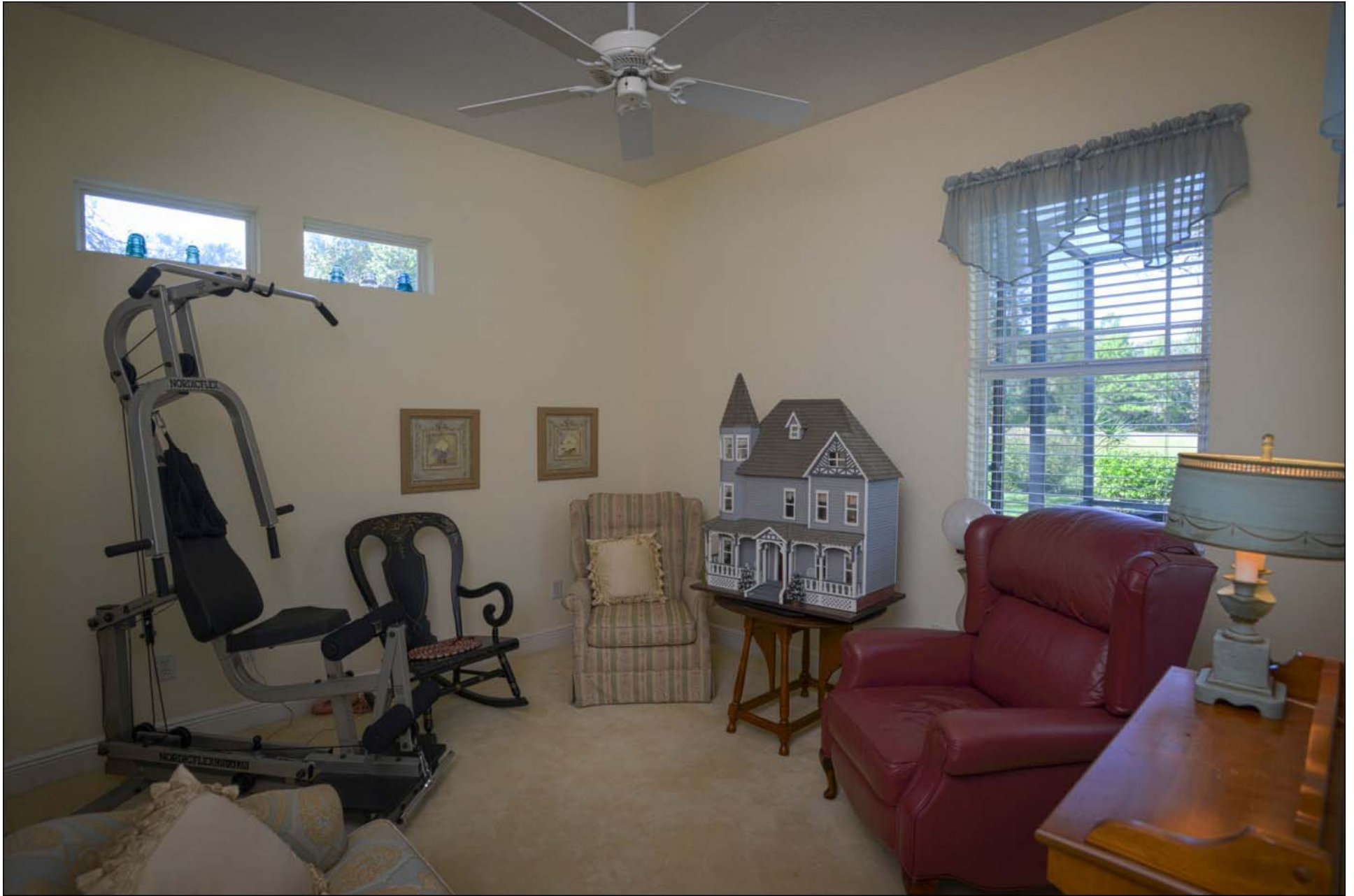
Bedroom 4 – 12' x 11'