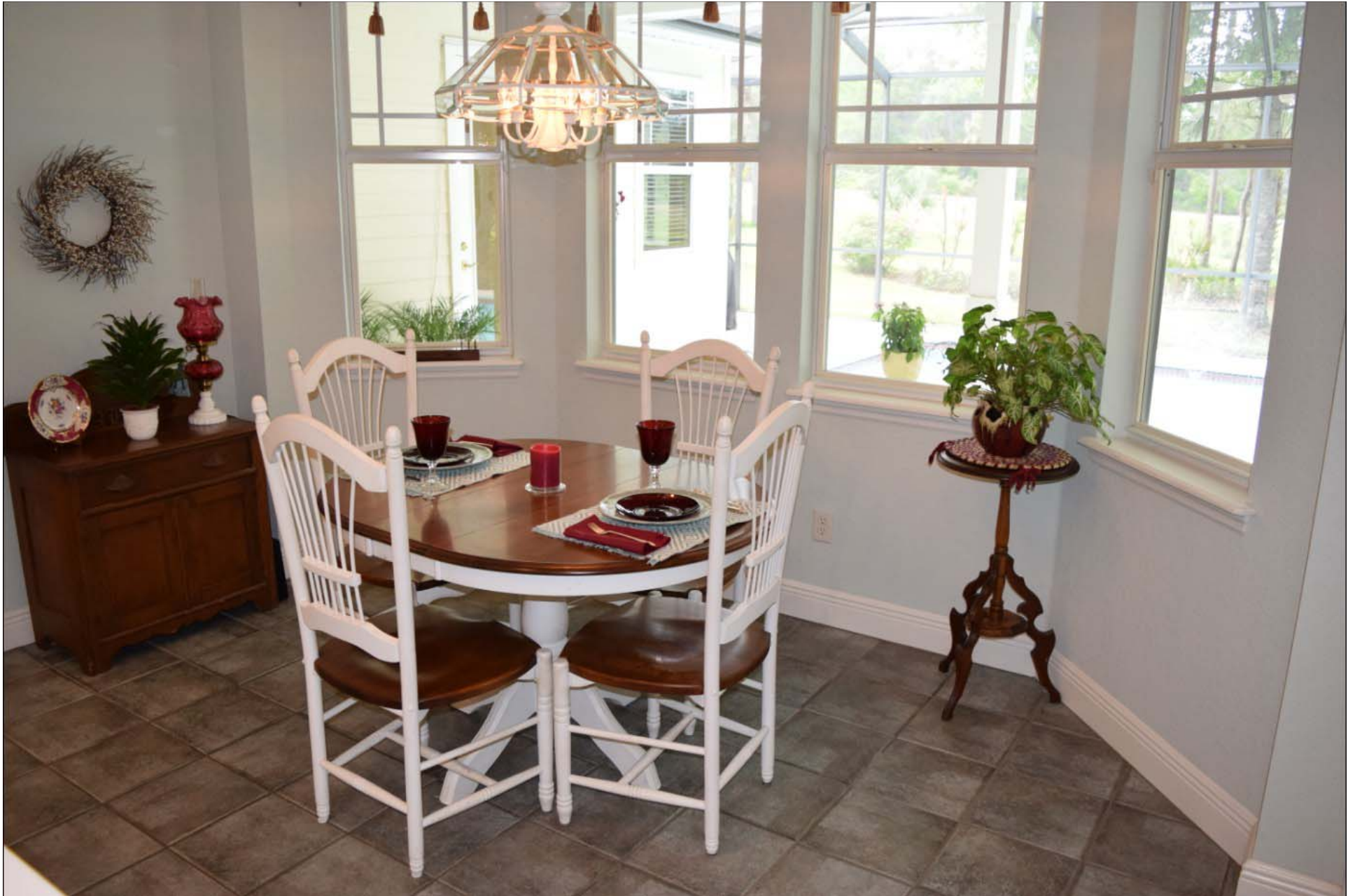
DINETTE 14' x 10'