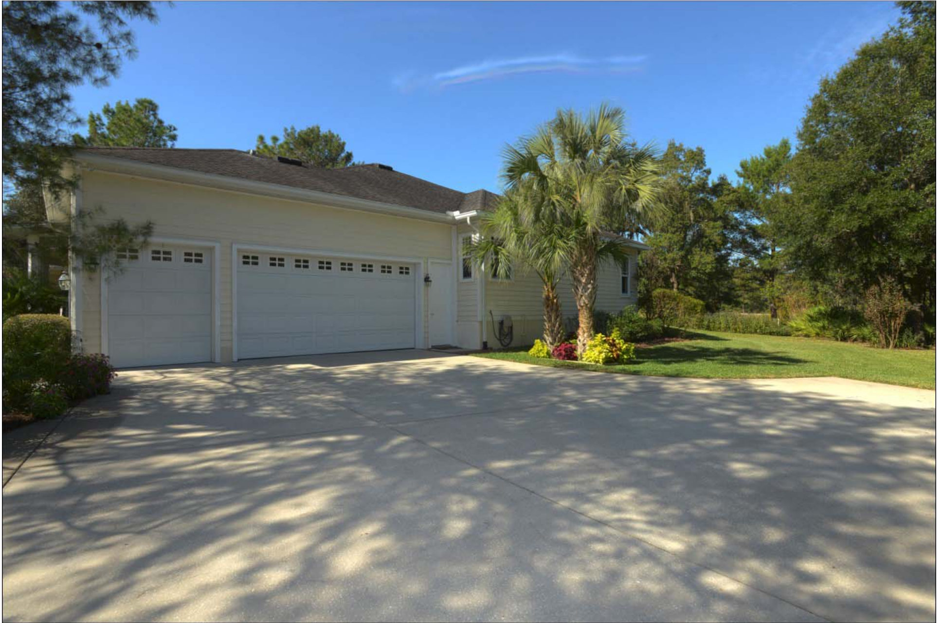
Oversized 3 Car Garage with side entry door