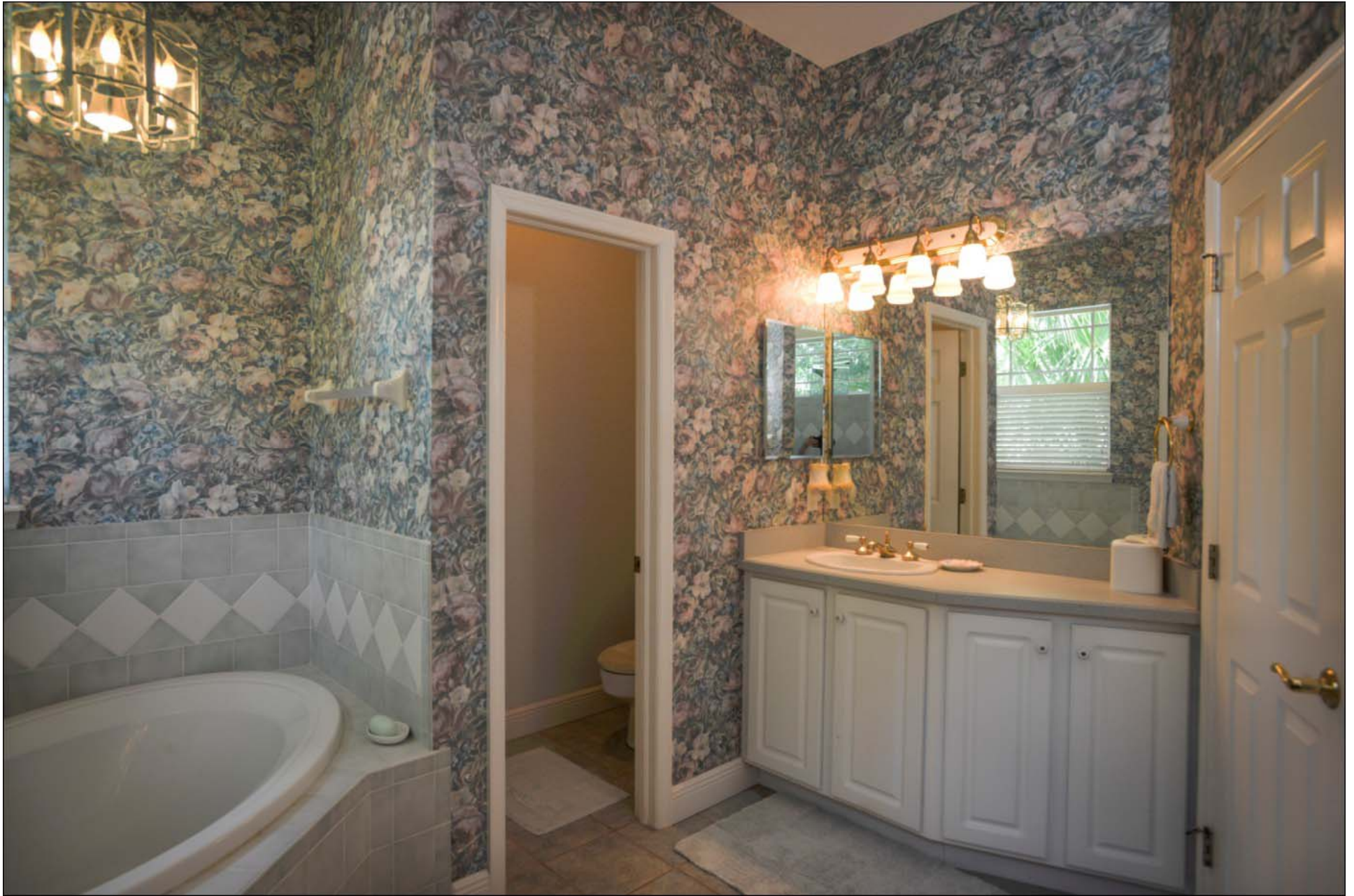
Master Bathroom with his&hers vanities & tub