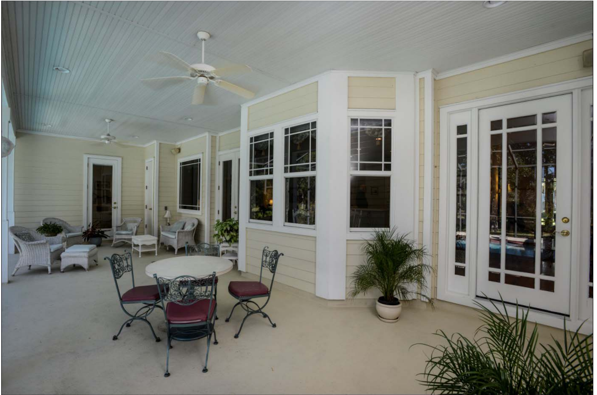
Large Covered Back Patio