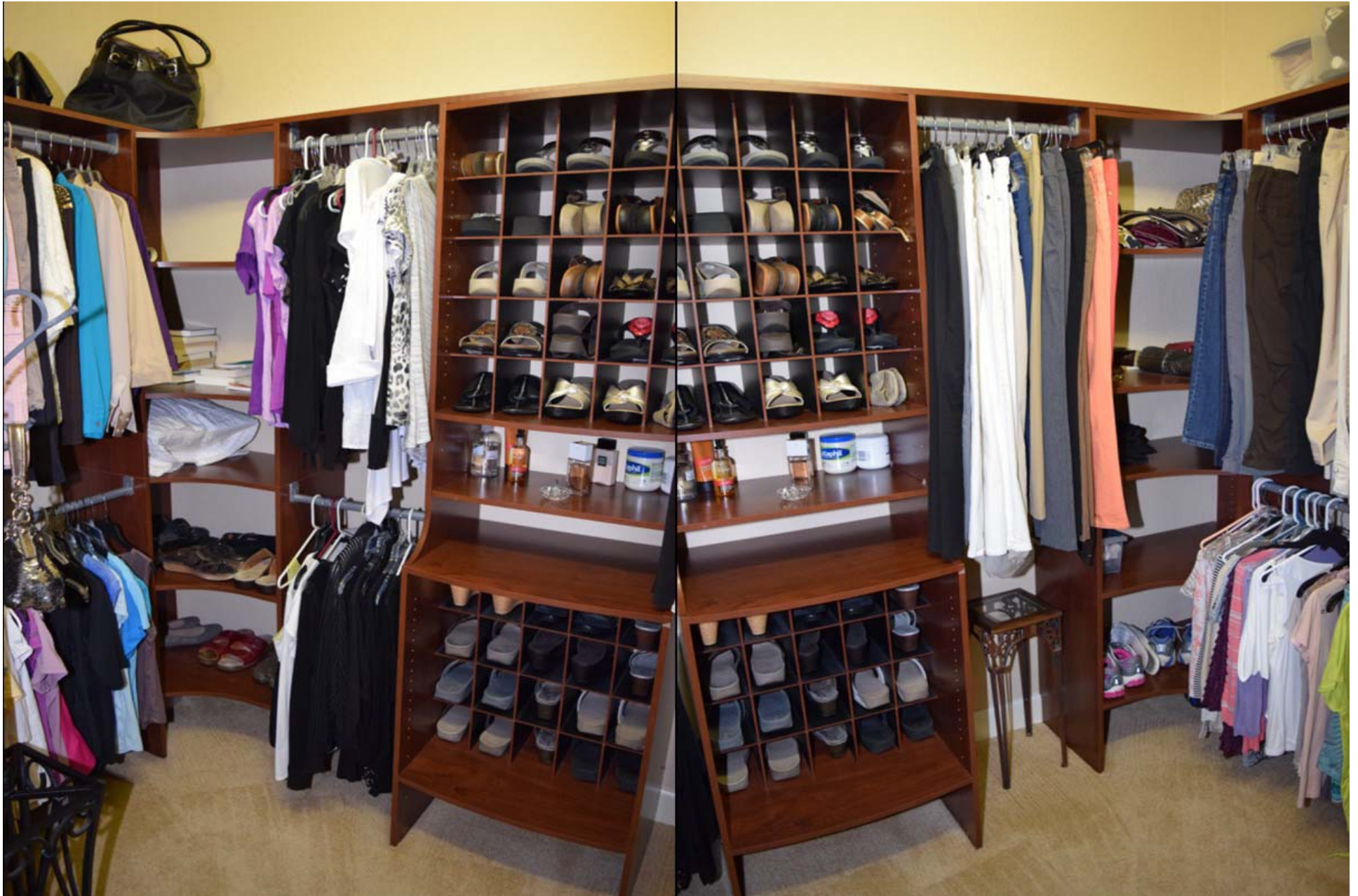
Master Bedroom - side by side pics of Her fitted walk-in-closet