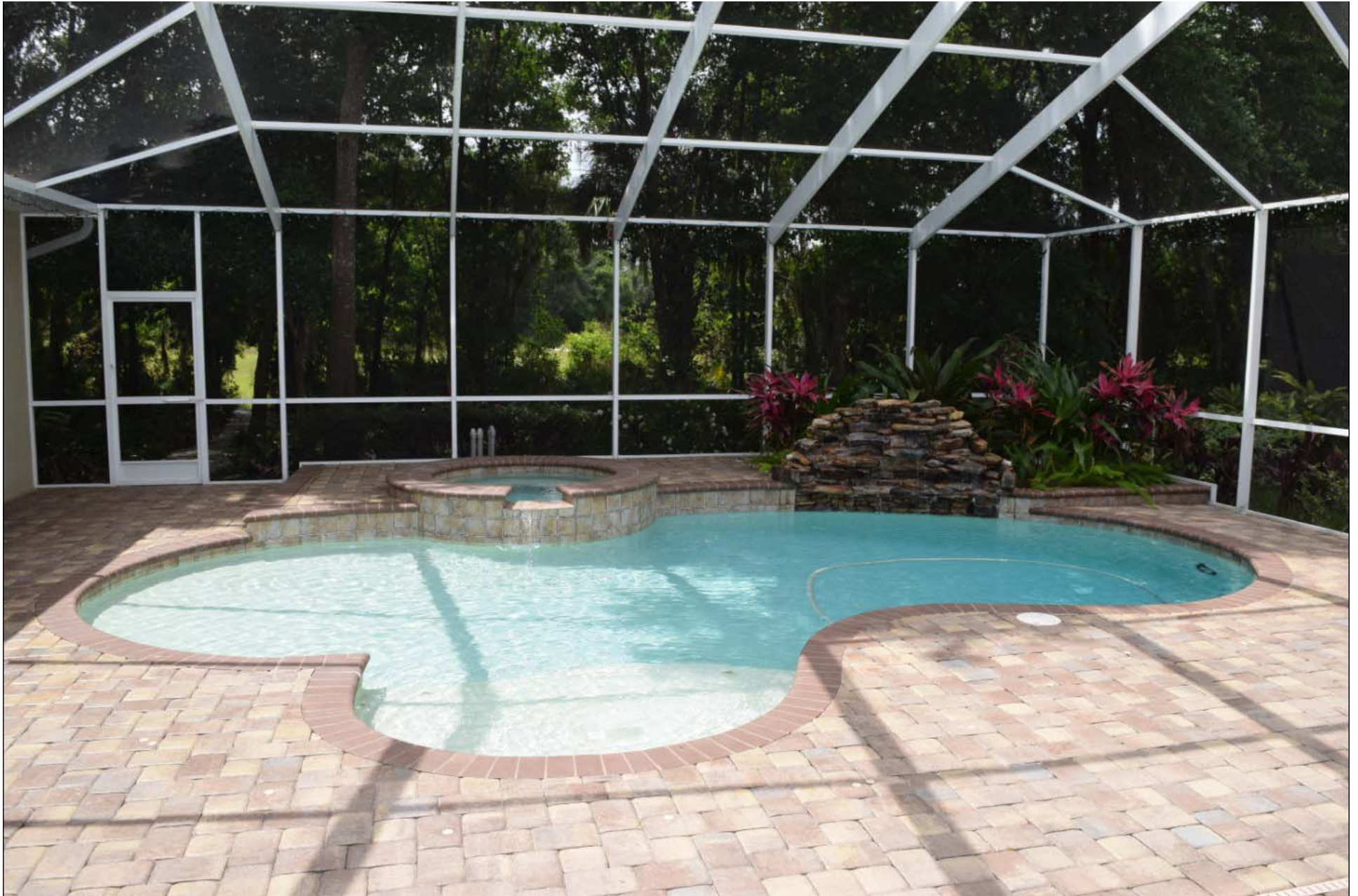
Salt Pool with Spa, Rock Waterfall, Raised Decks & Lanai