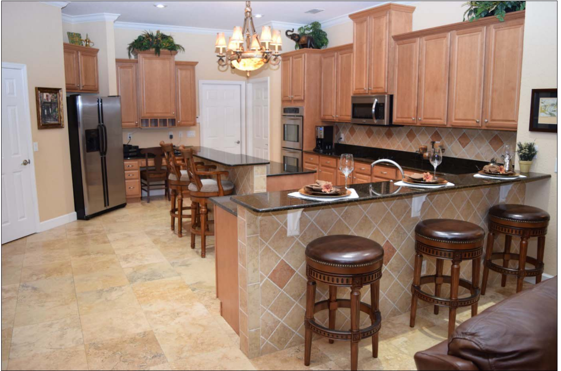
Kitchen w/ stunning Travertine (natural stone) floors 20' x 14'