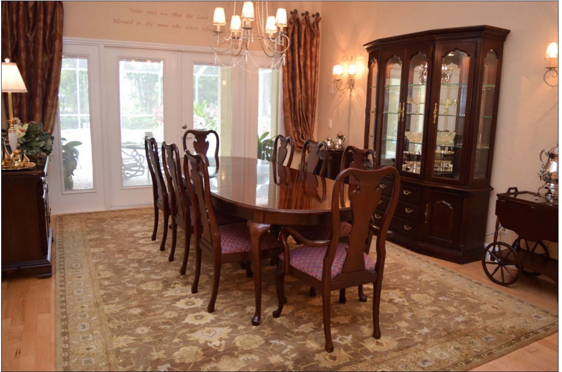
Formal Dining Room (or living room) 19' x 14'