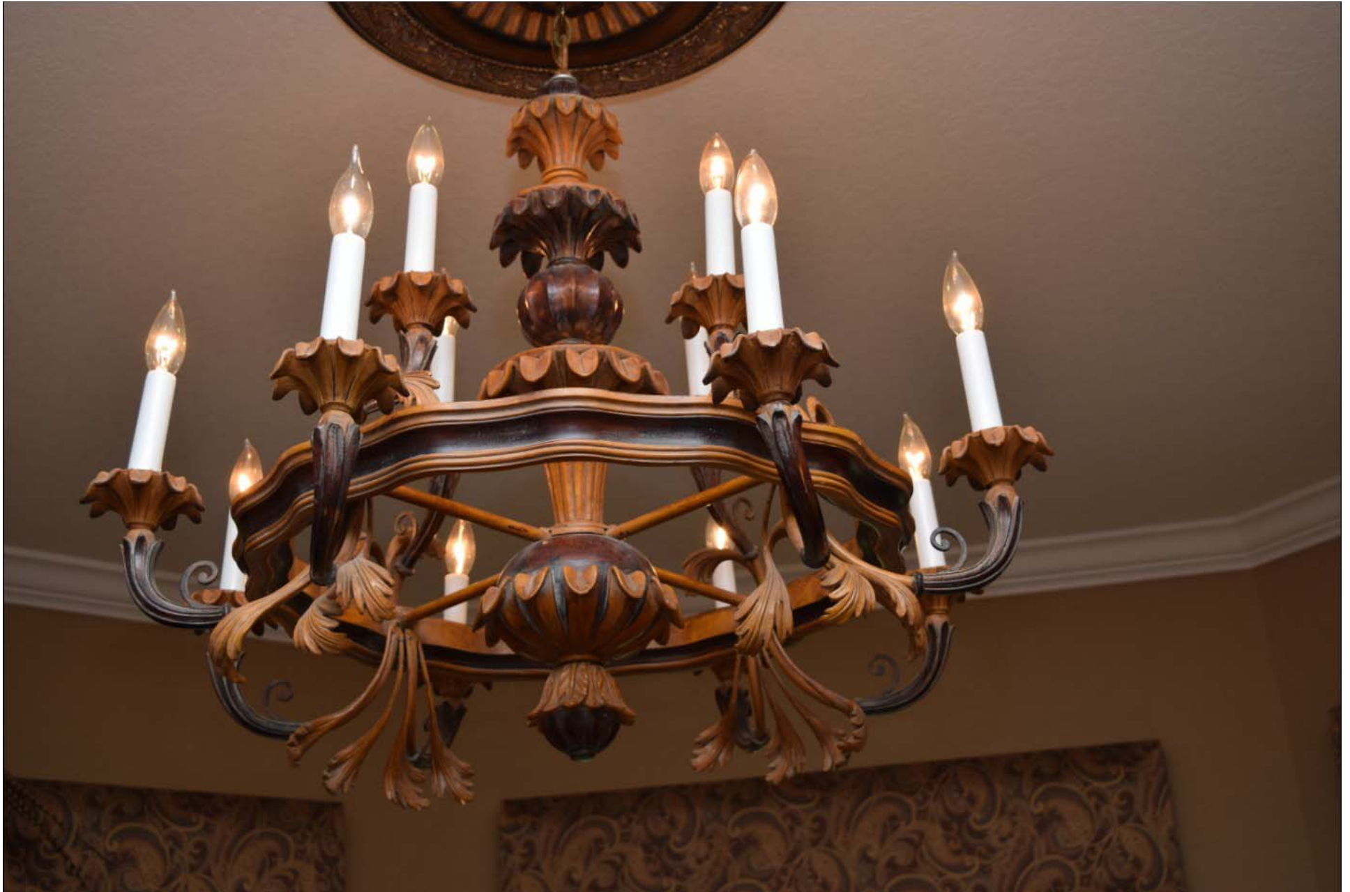
Unique Light Fitting in Bedroom 4