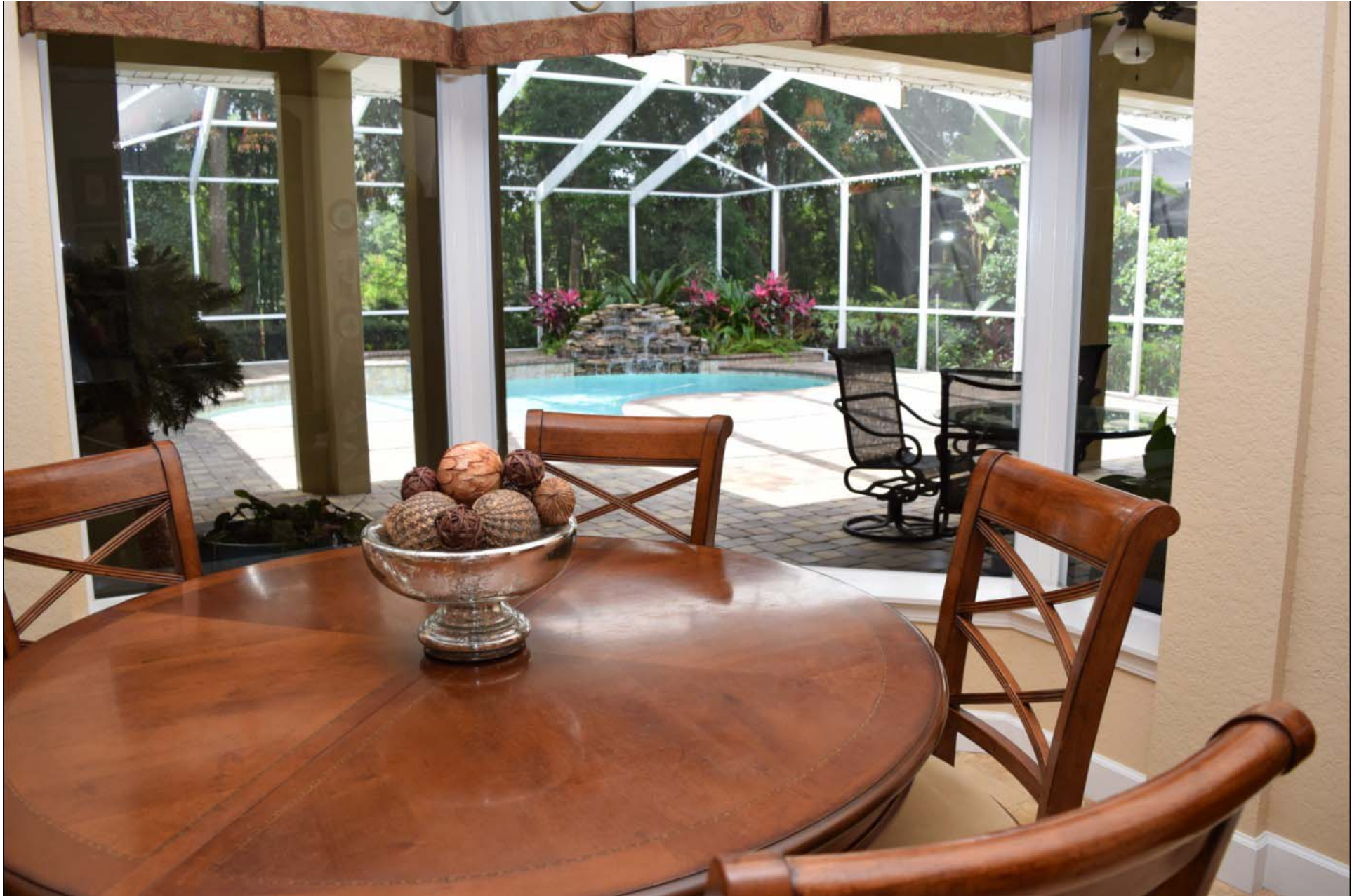
Dinette with panoramic waterfall, conservation view