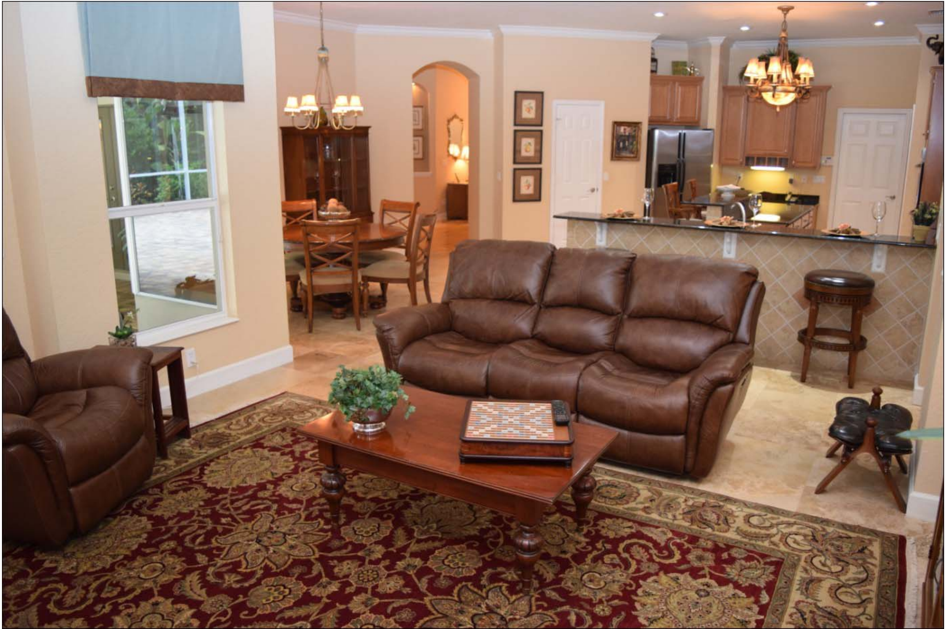
Family Room to Kitchen & Dinette 17' x 16'