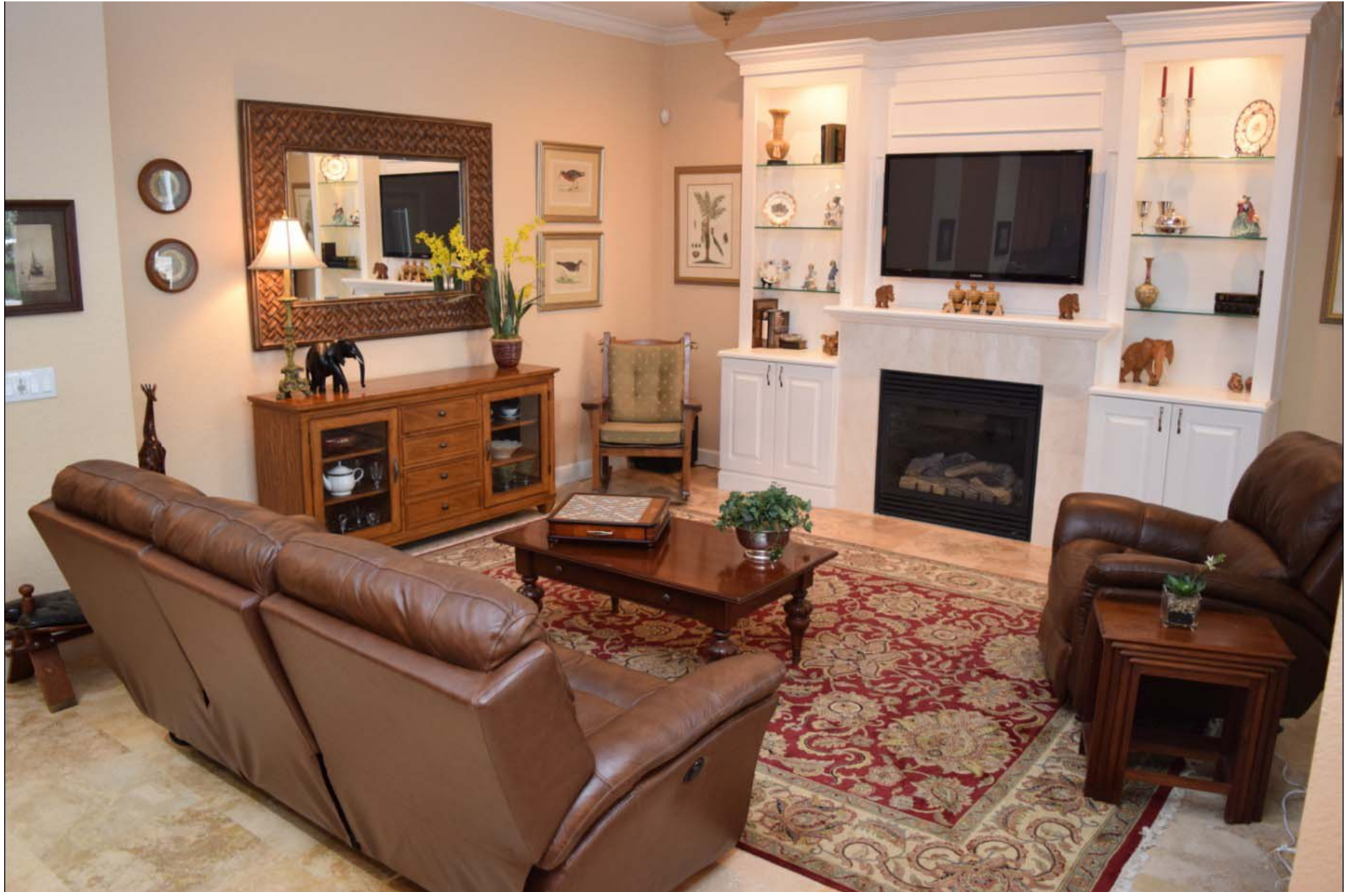
Family Room includes TV, Blu Ray, Surround Sound 17' x 16'