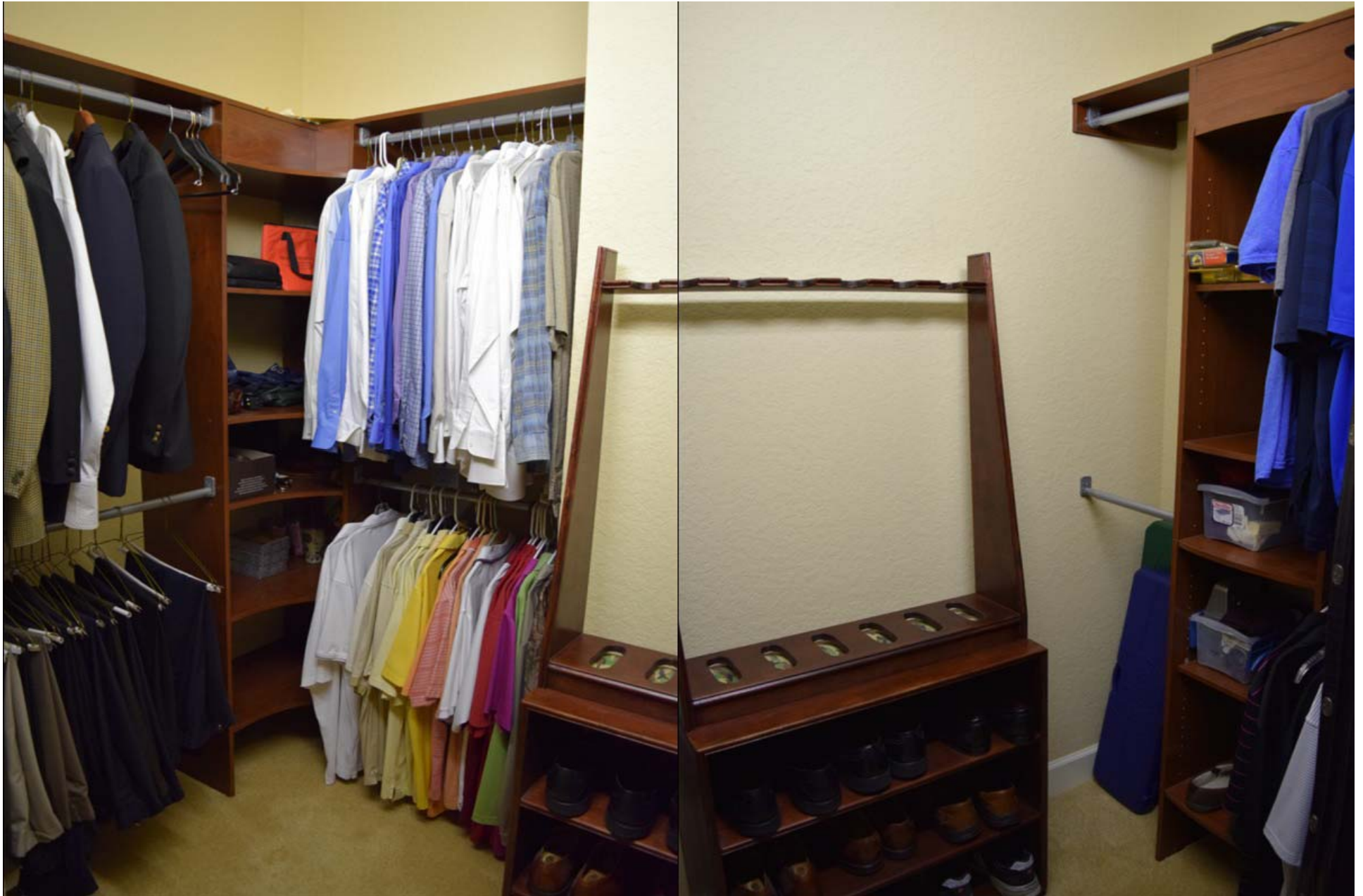
Master Bedroom - side by side pics of His fitted walk-in-closet