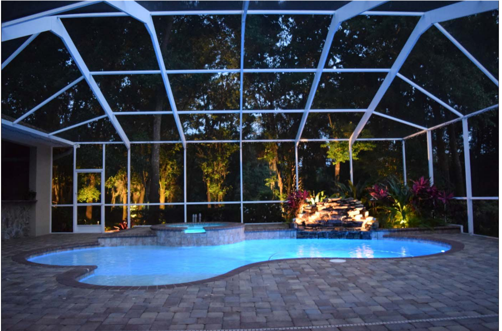
Solar Heated Pool & Conservation lit up at night - party time!