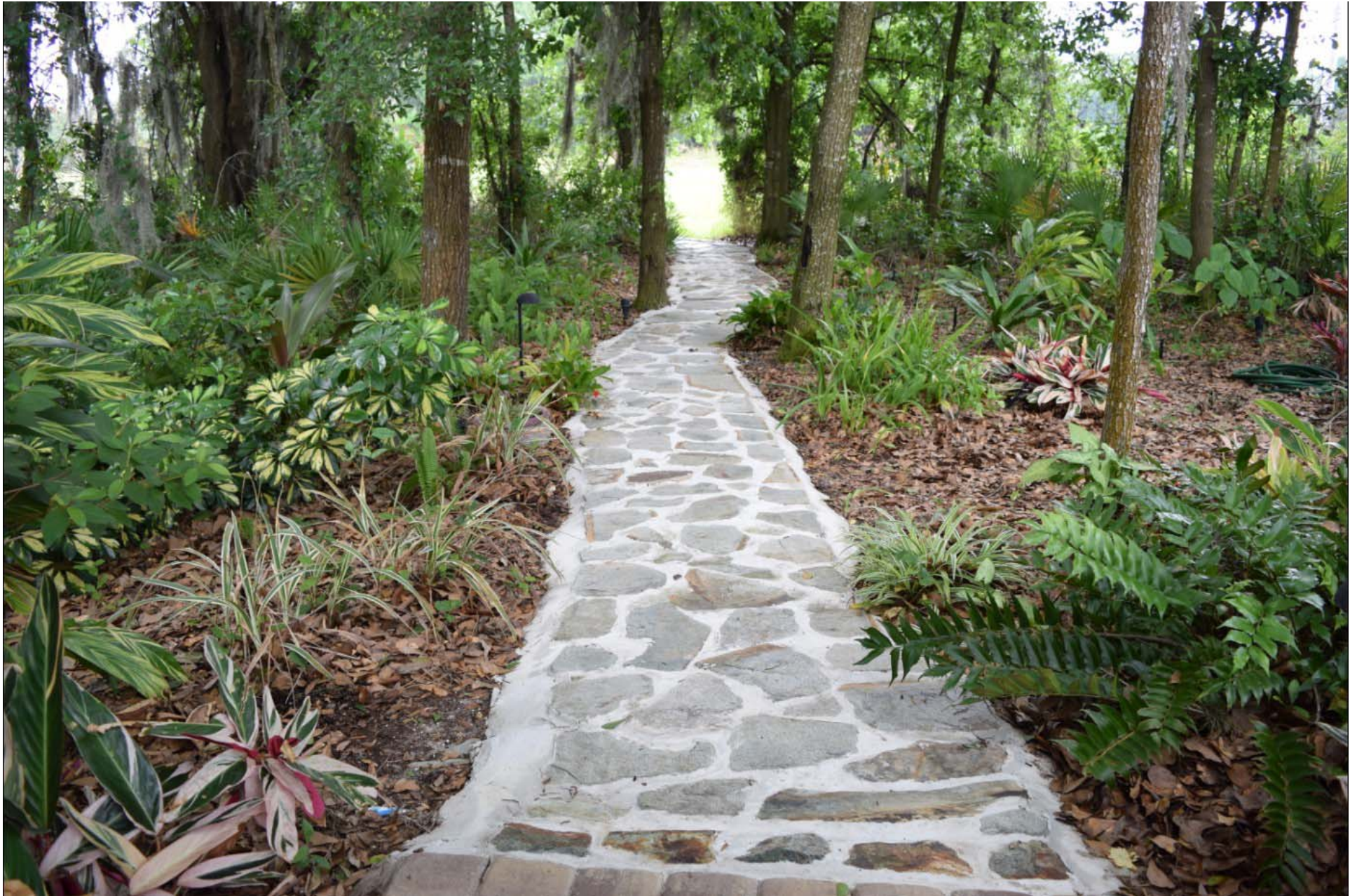
Stone paved path through conservation to walking trails