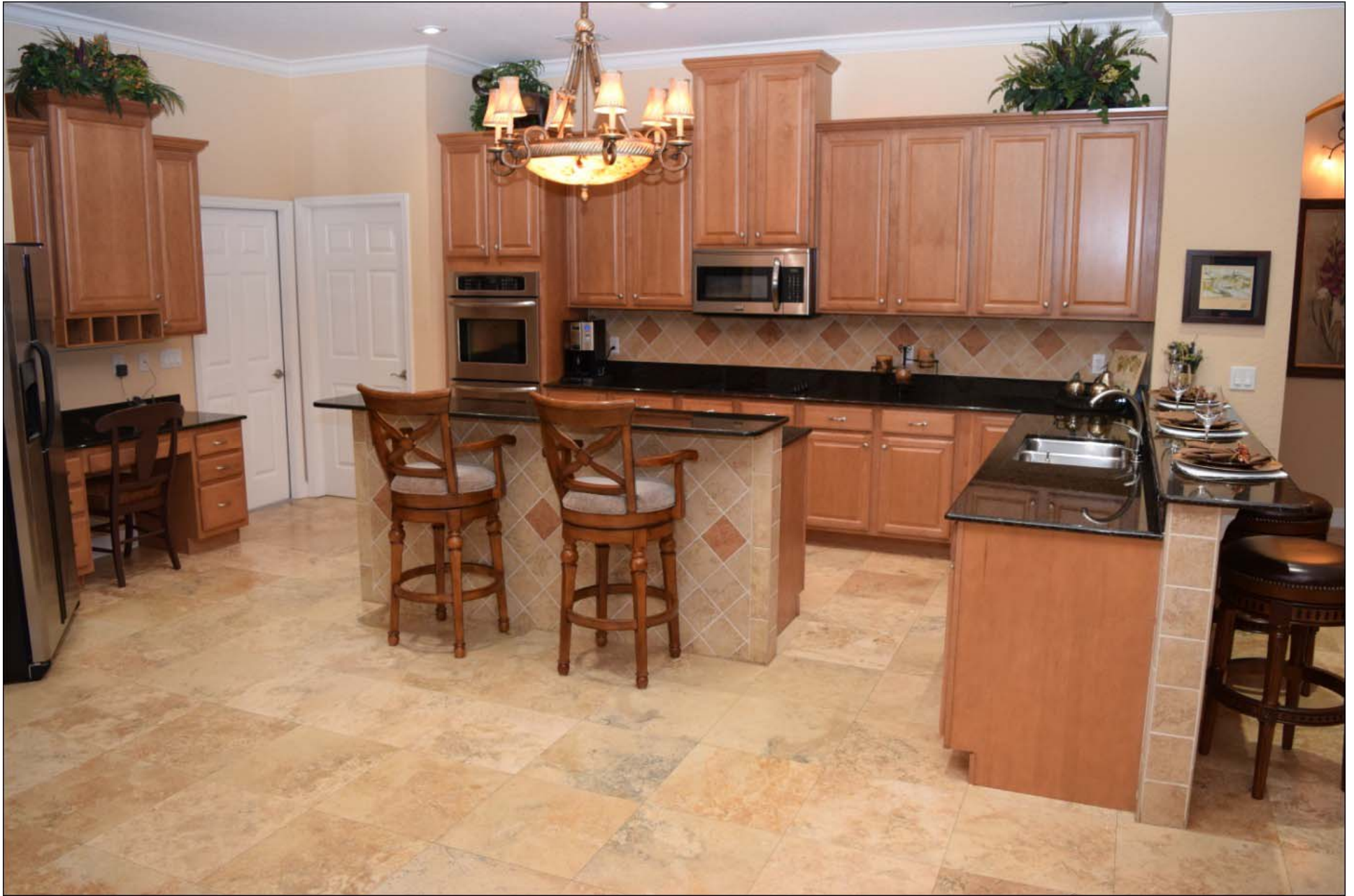
Kitchen w/ granite counters, backsplash & much more 20' x 14'