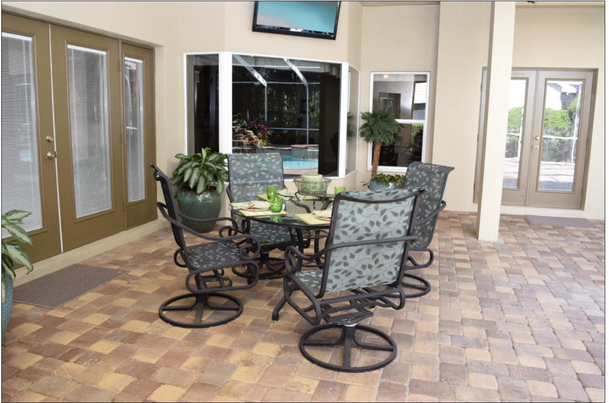
Large Back Patio with surround sound 23' x 14'