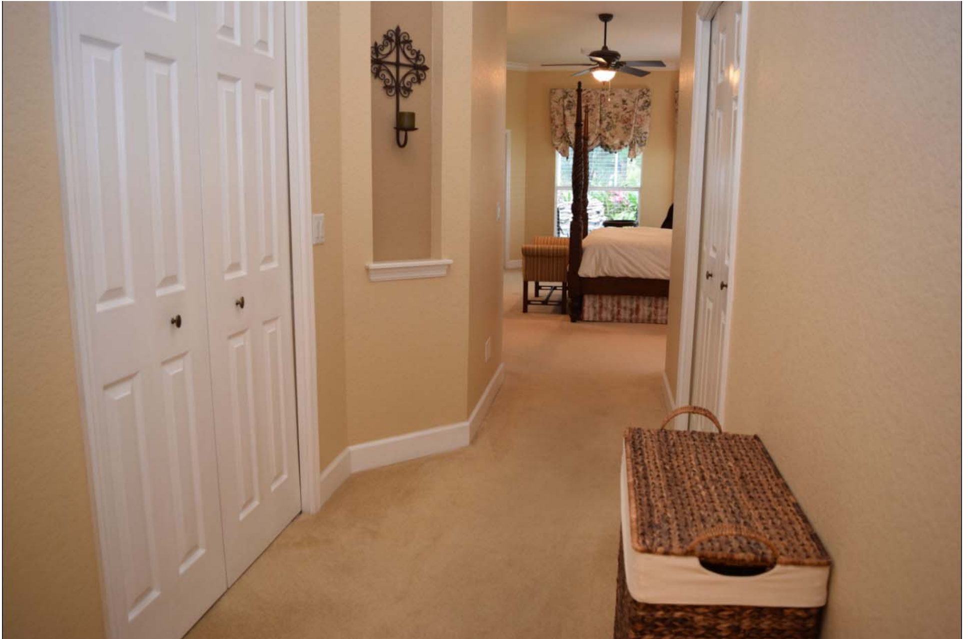
Master Bedroom with his&hers fitted closets