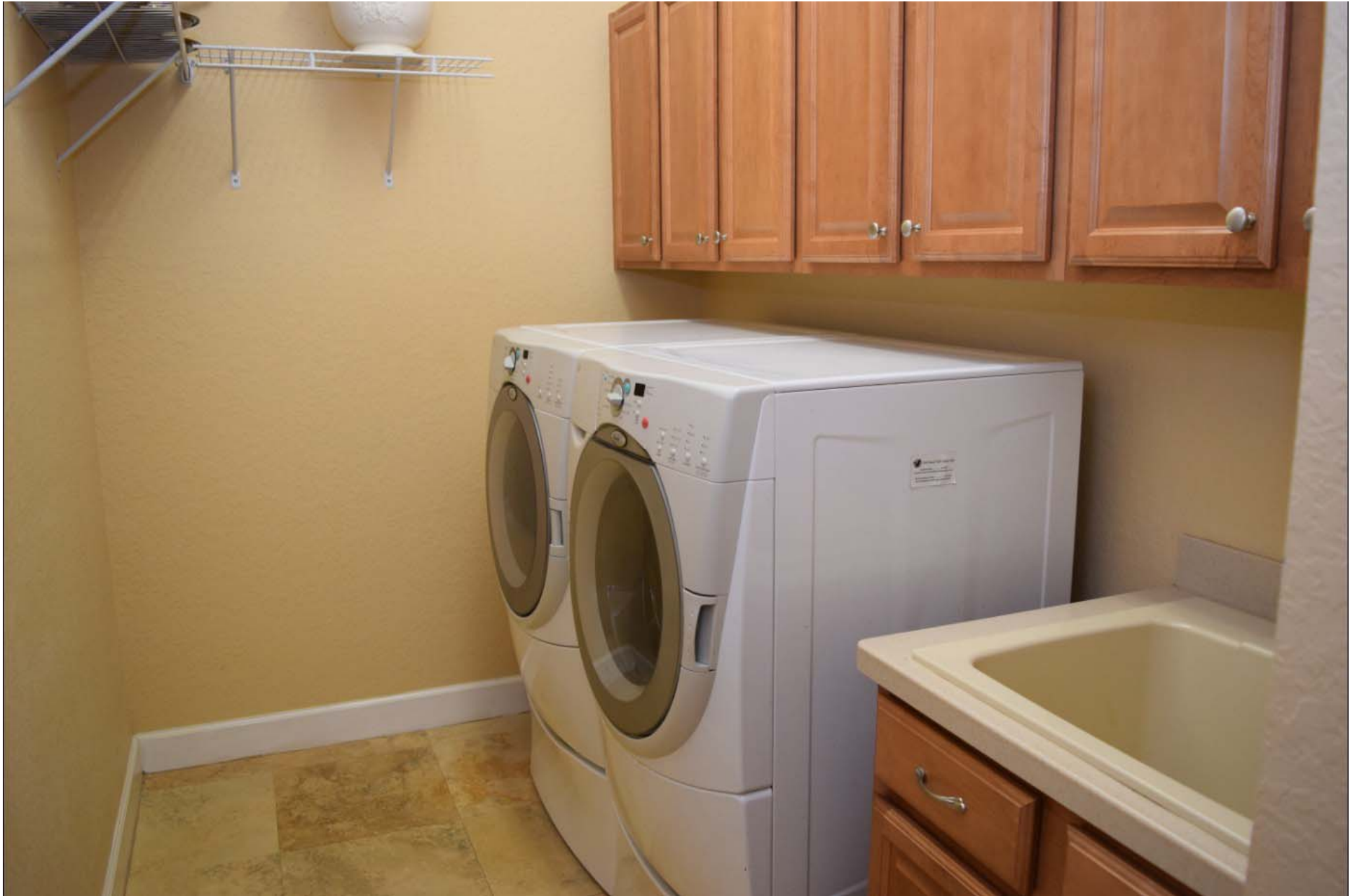
Laundry off Kitchen (not a walk-through)