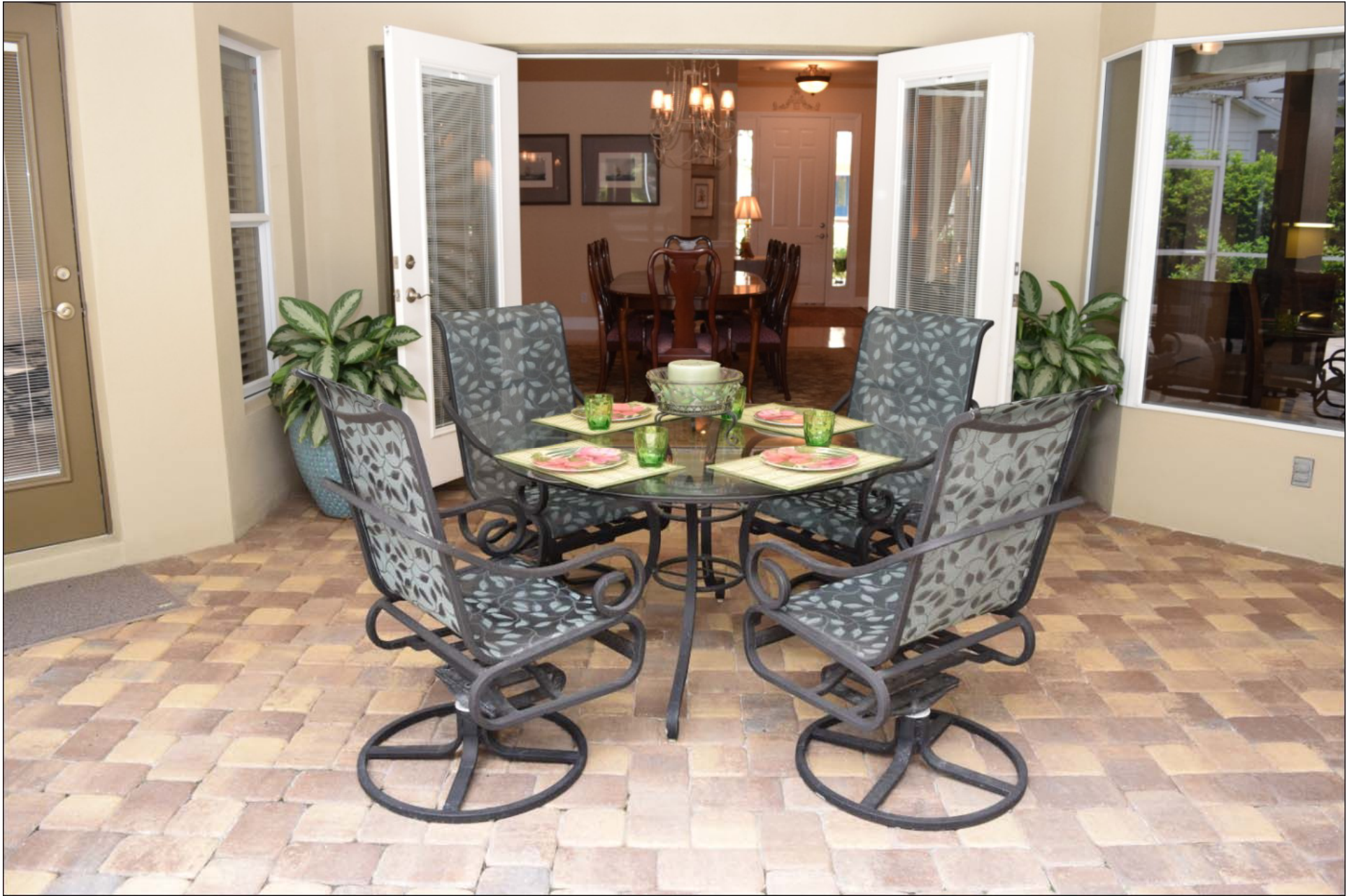
Back Patio to Dining Room