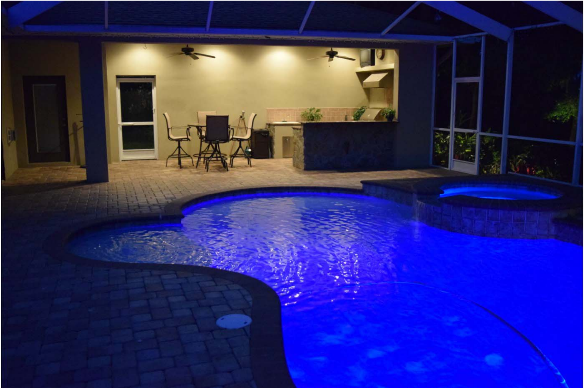
Salt Pool onto Outdoor Kitchen - Summer nights swim time