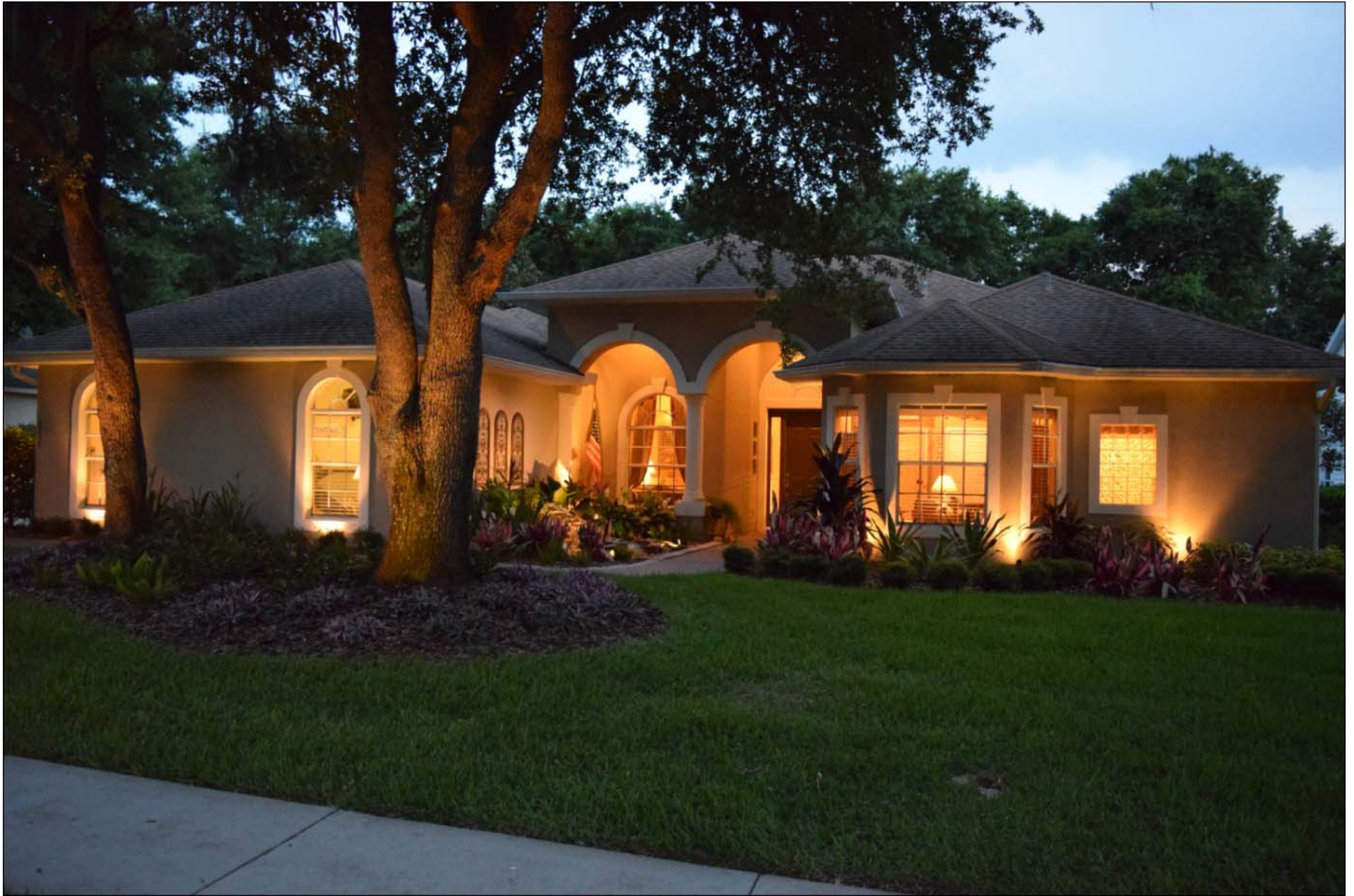
Front View - Located in Safe and Serene Fish Hawk Trails