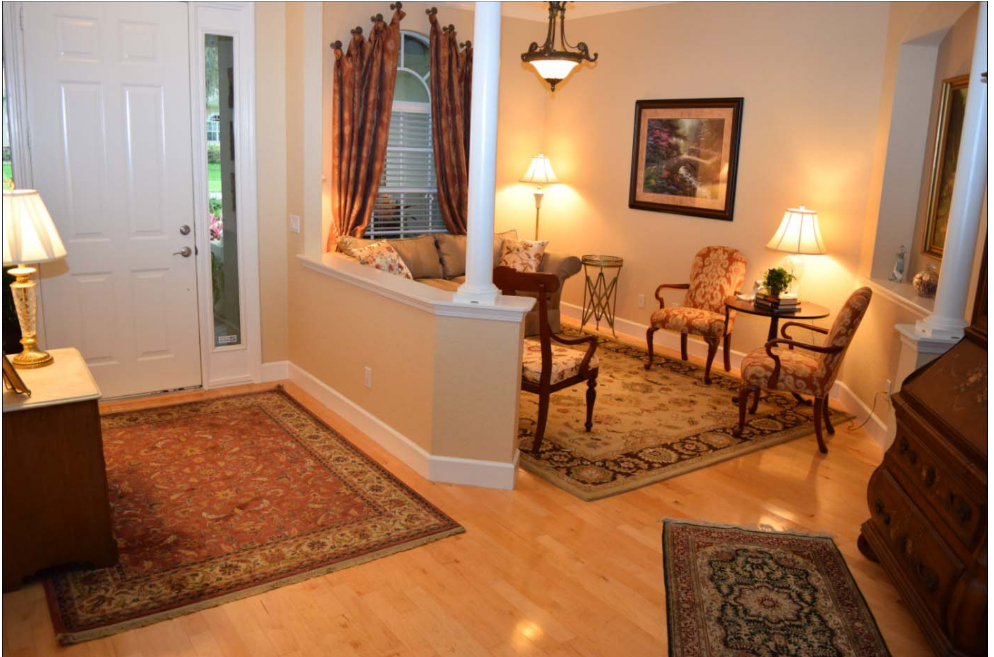
Entrance - Stunning Hickory Wooden floors