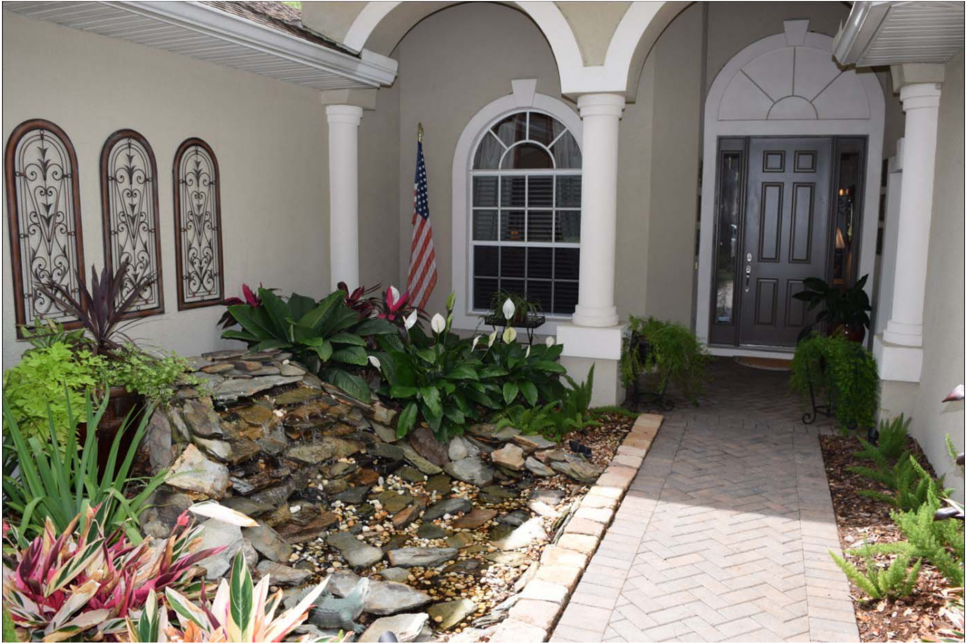
Front Entrance - enjoy the Grand Tour