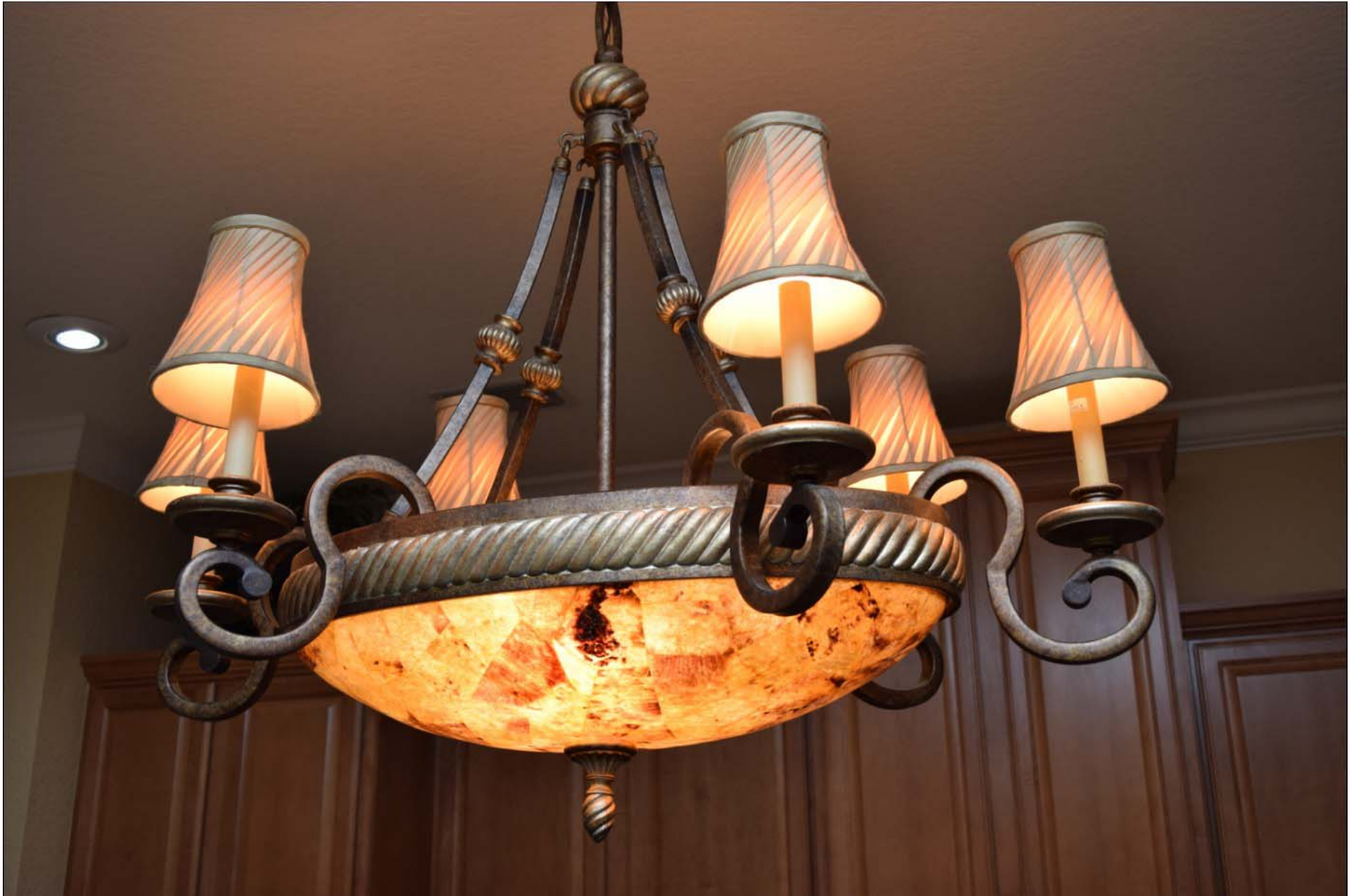
Custom Kitchen Light Fitting