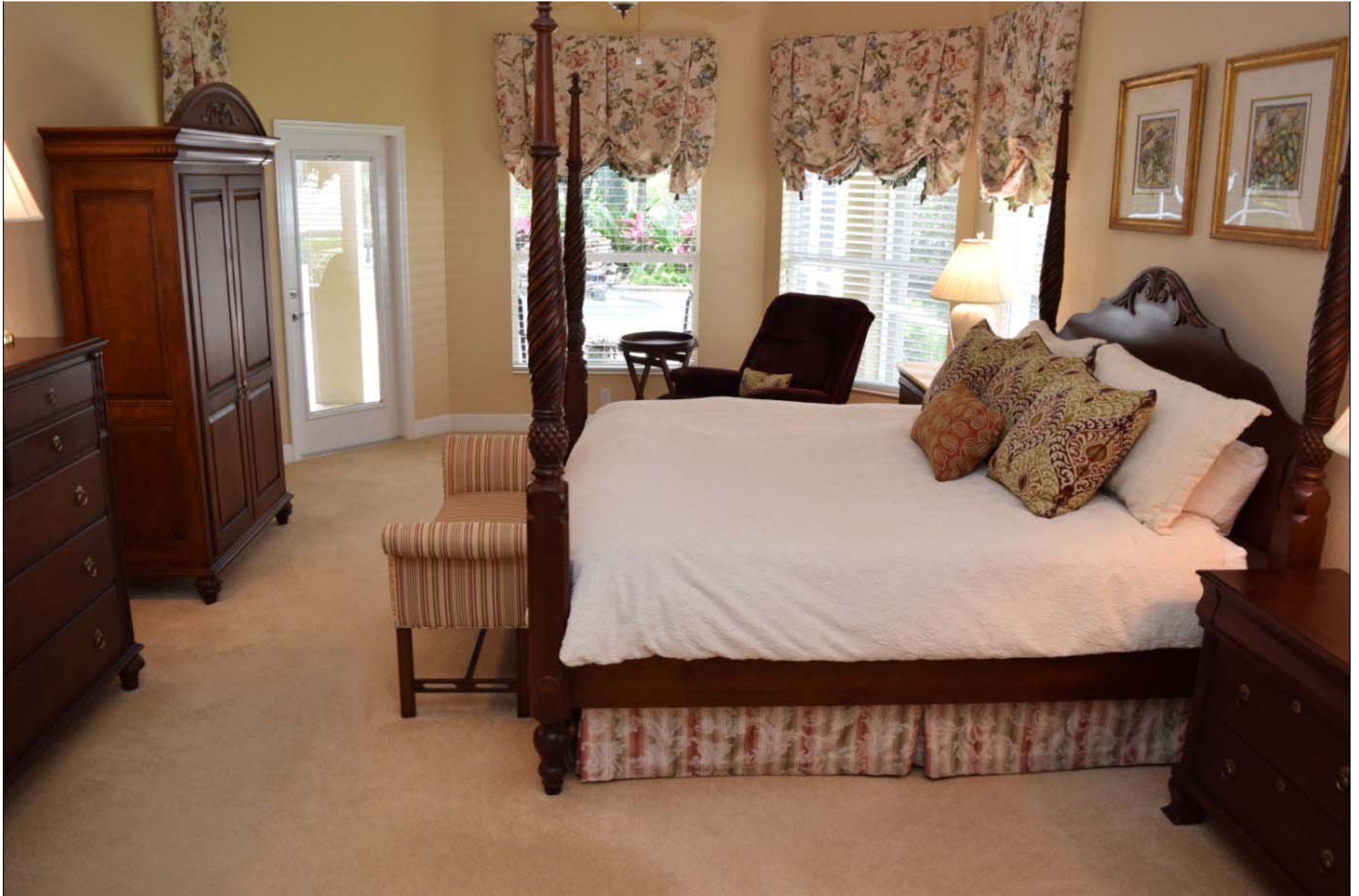
Master Bedroom with pool access and view 22' x 14'