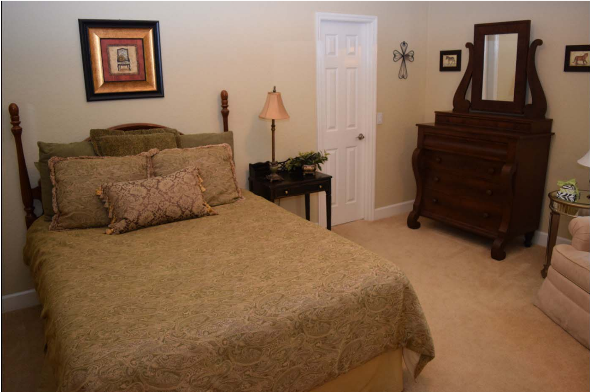
Bedroom 3 with walk-in-closet 14' x 11'