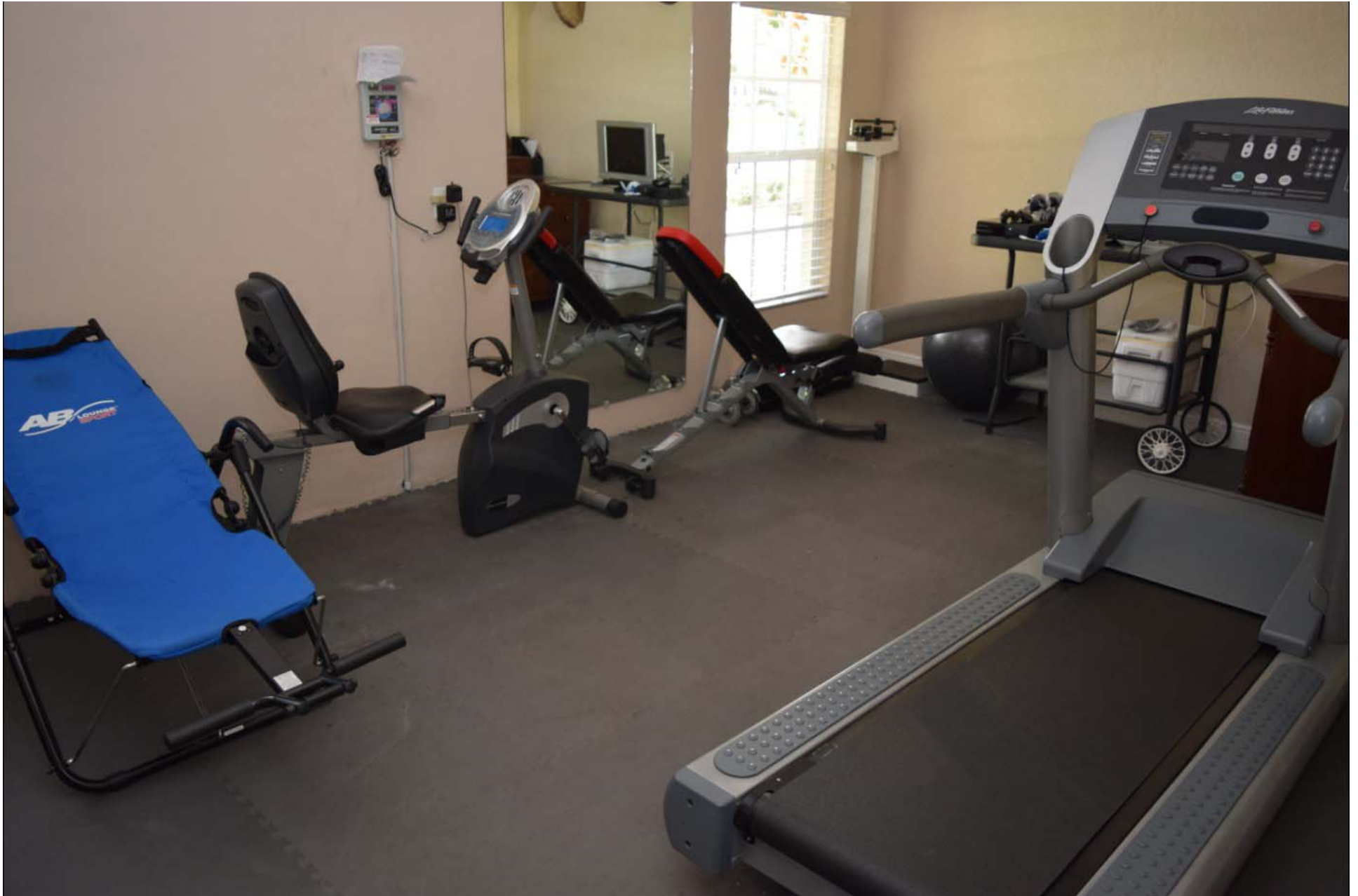
Large Gym room w/ padded floor under A/C (Garage 3) 21' x 12'