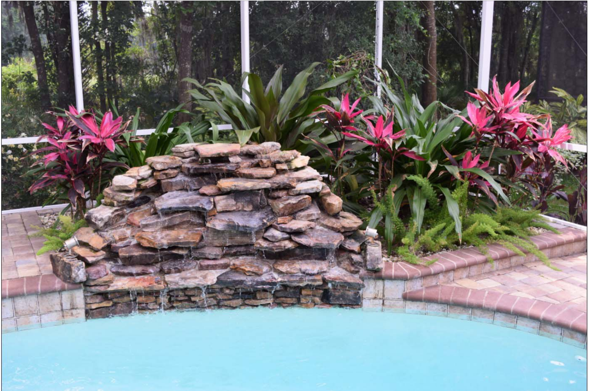
Designer Rock Waterfall, Garden & Privacy Conservation