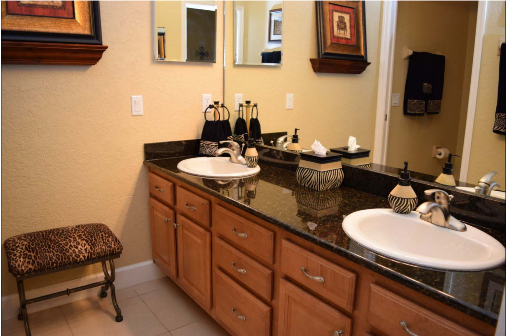
Bathroom 3 with granite, dual sinks & bath/shower