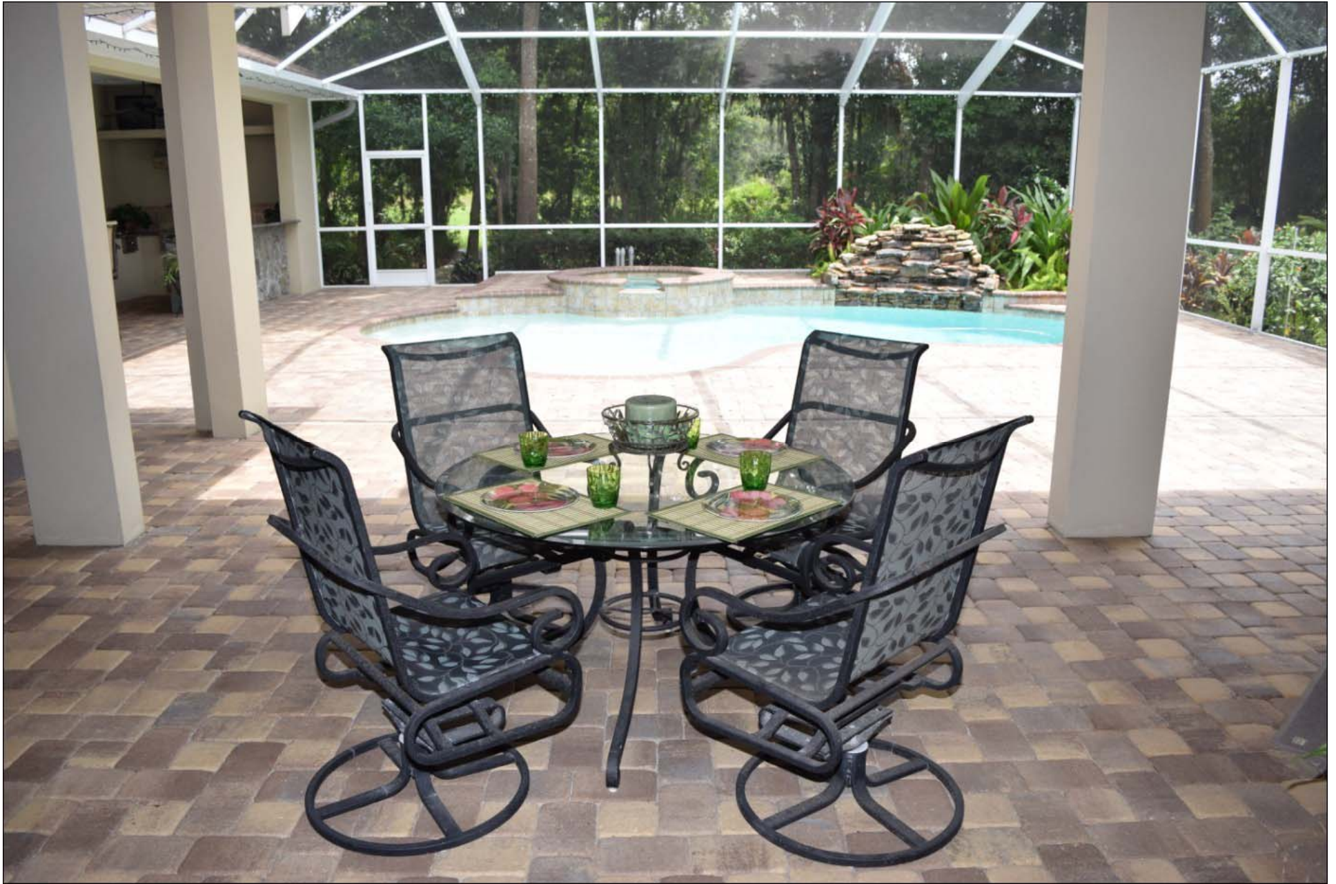
Back Patio to Pool/Lanai/Conservation