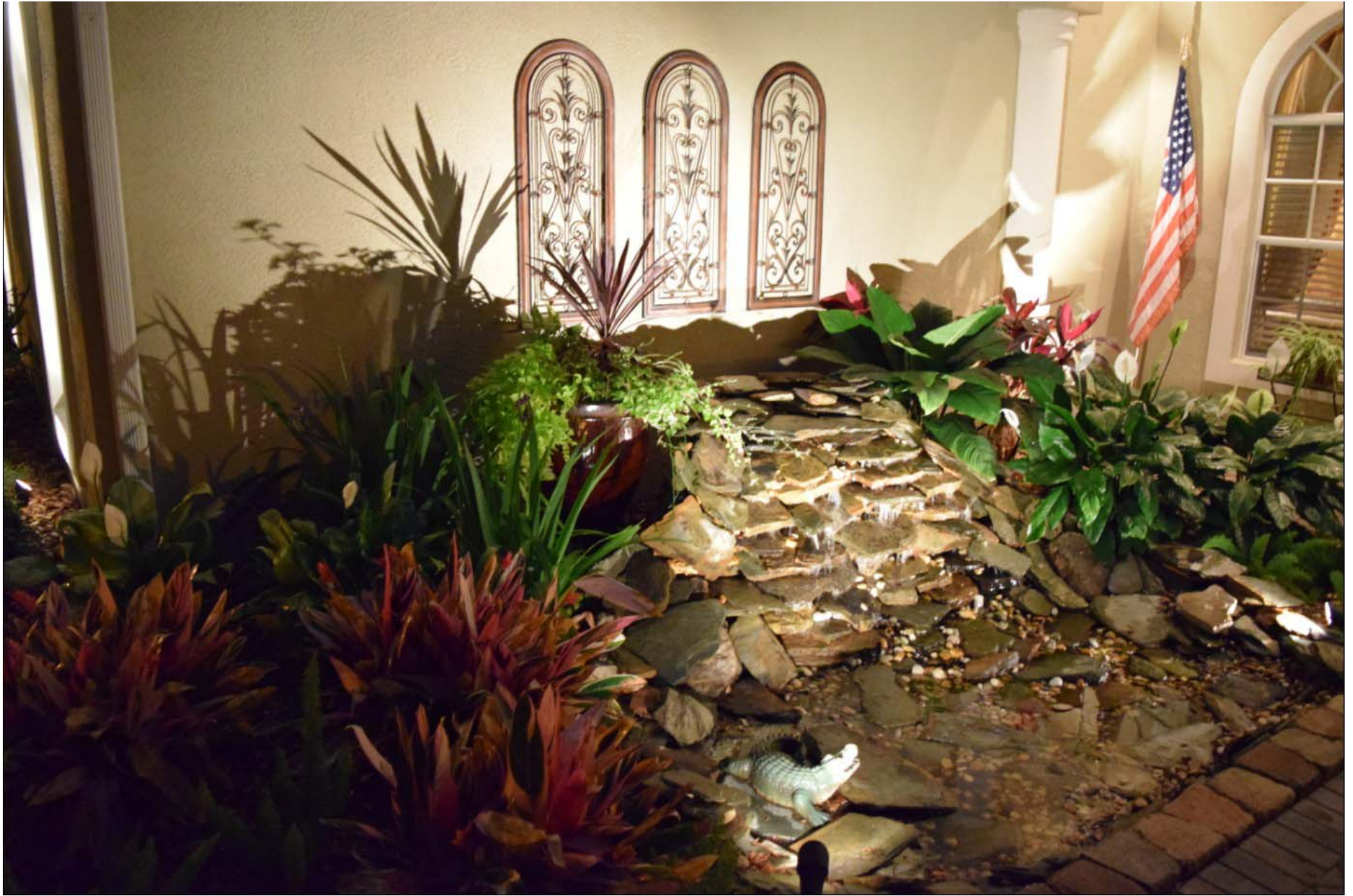
Designer Rock Fountain