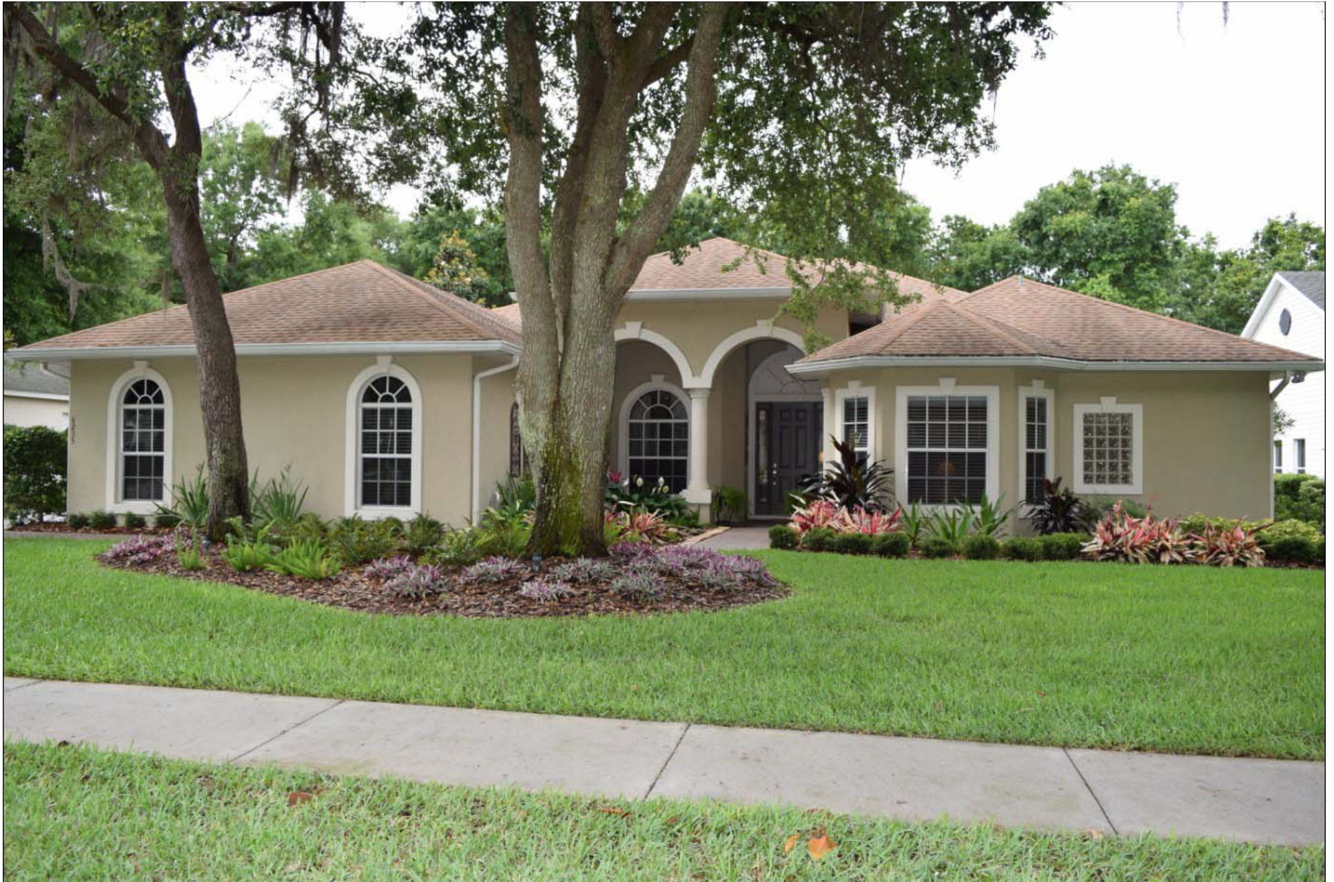
Front Daytime View - lush landscaping all around this home