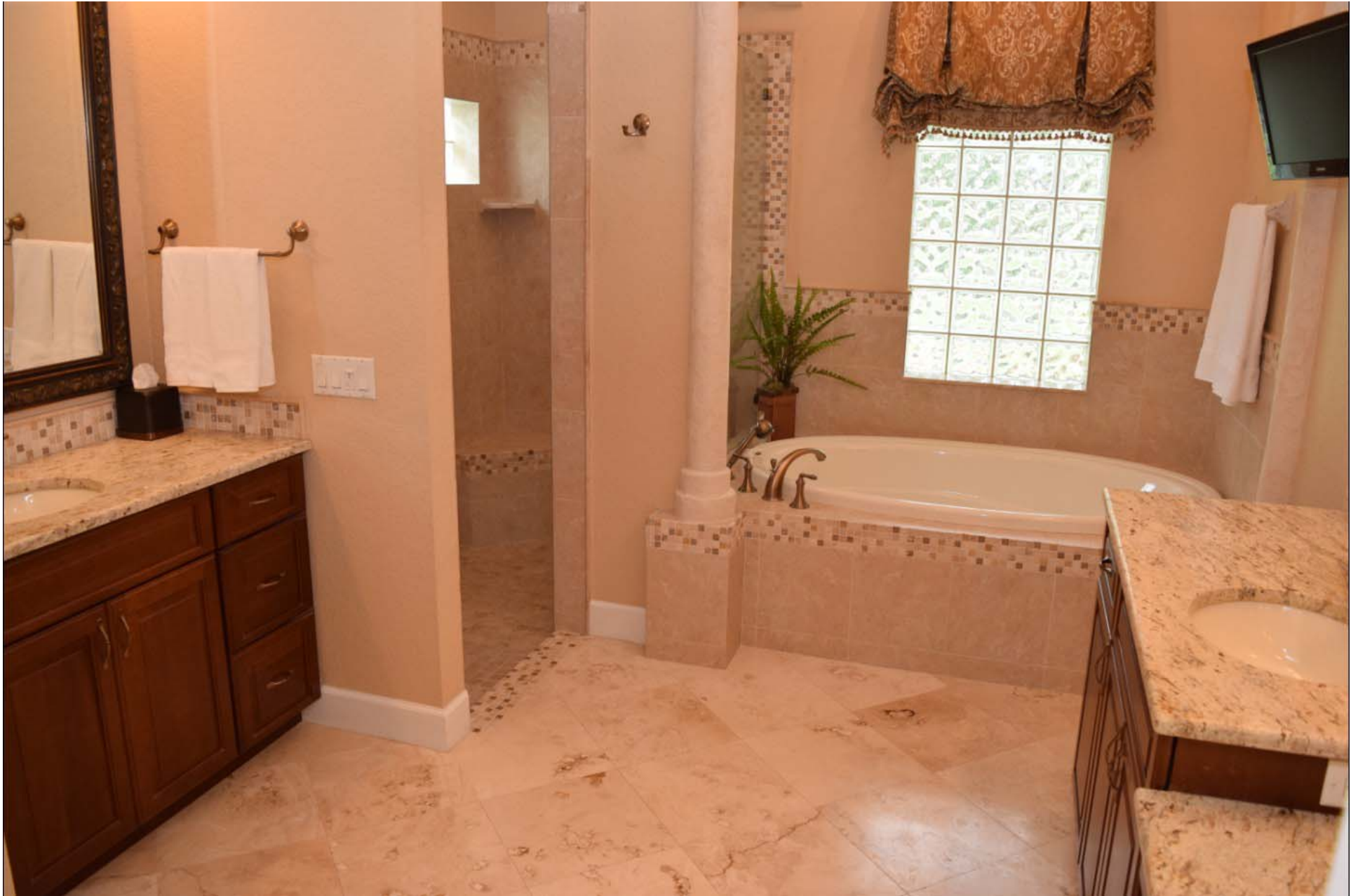
Decorator designed Master Bathroom, his&hers vanities & tub