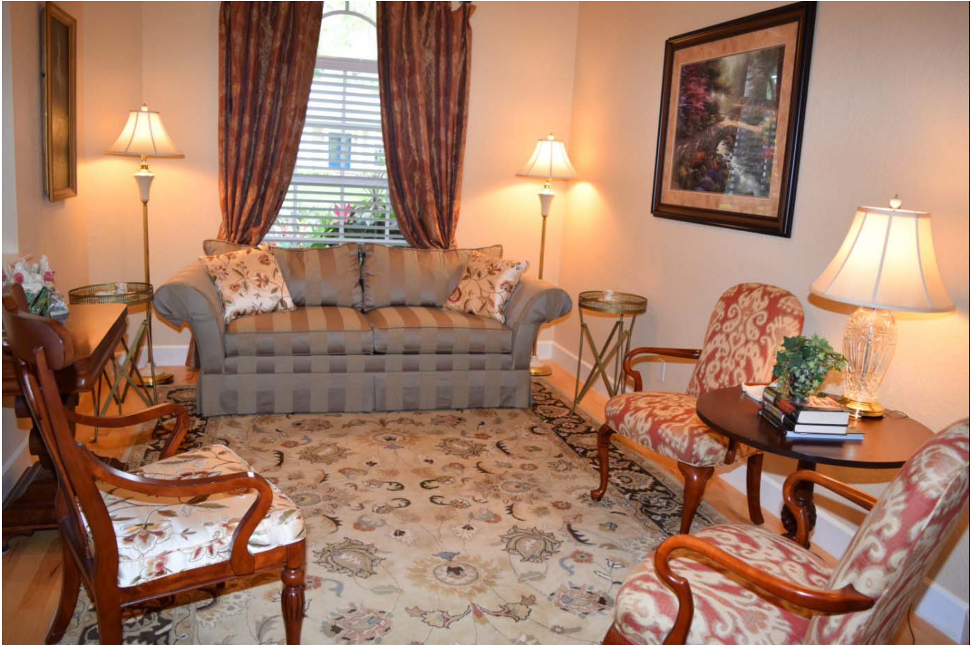
Formal Living Room (or front office) 14' x 10'