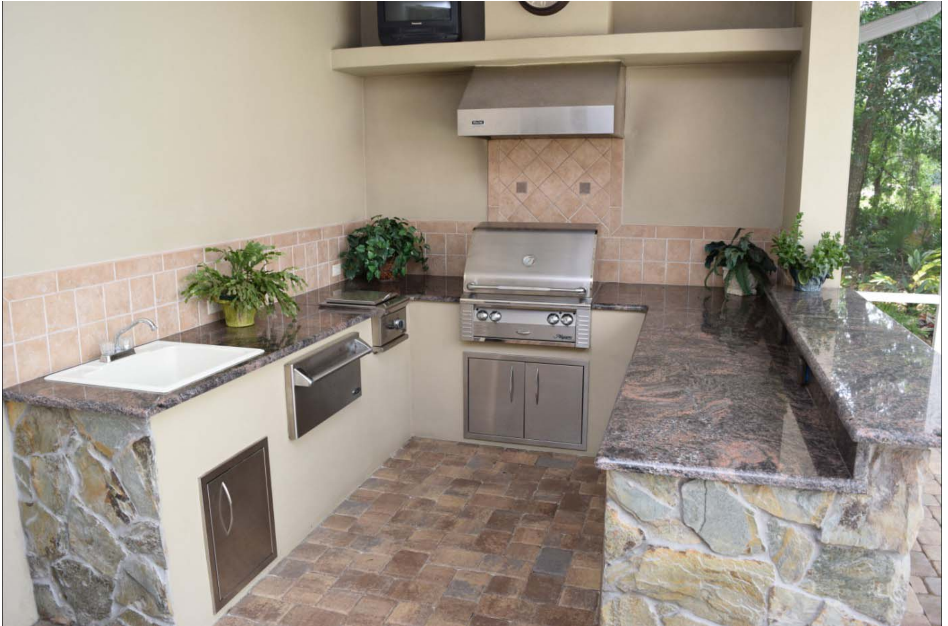
Outdoor Kitchen with granite, warmer, refrigerator & more