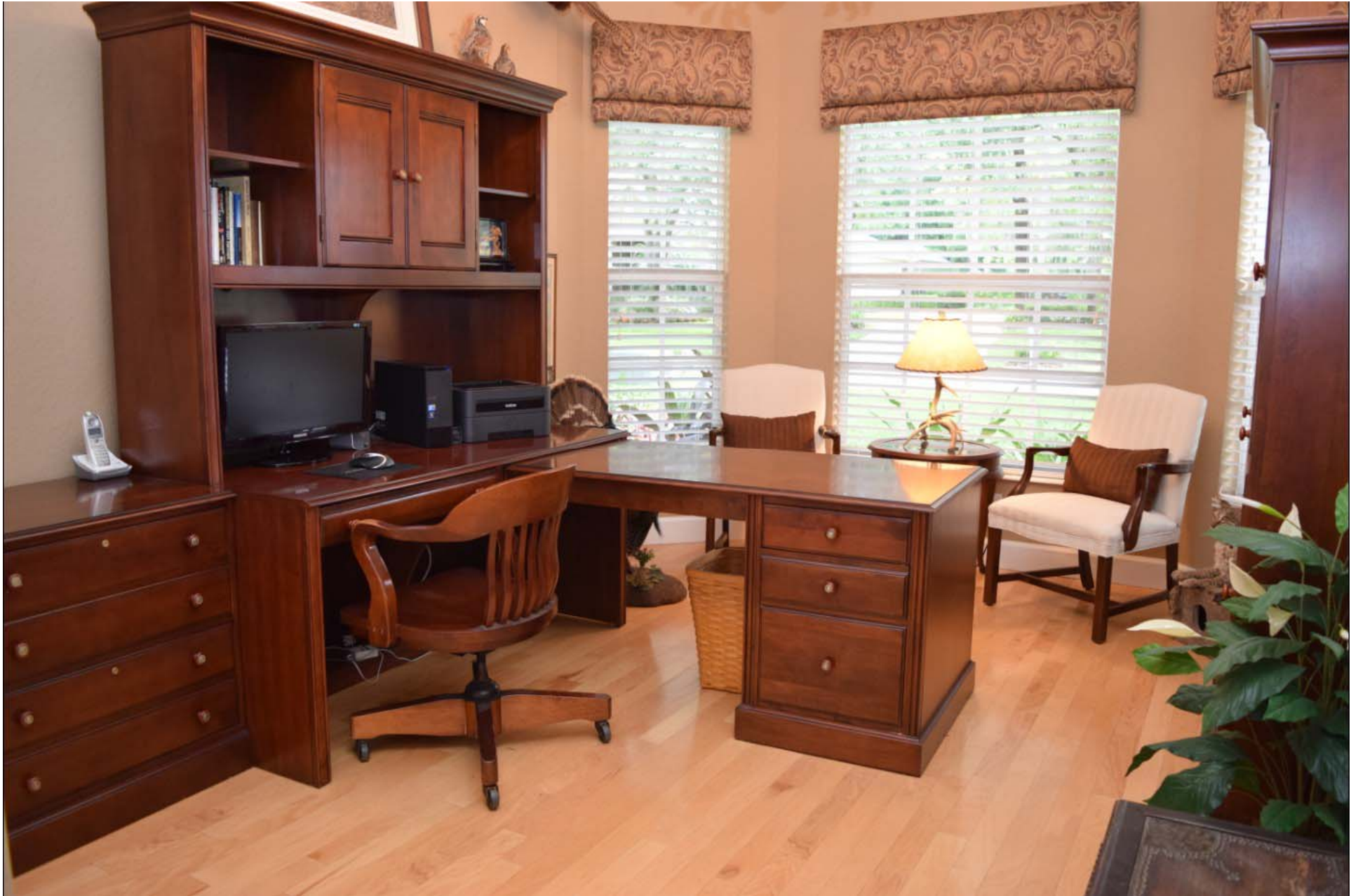
Large Bedroom 4 w/ front view being used as an office 18' x 11'