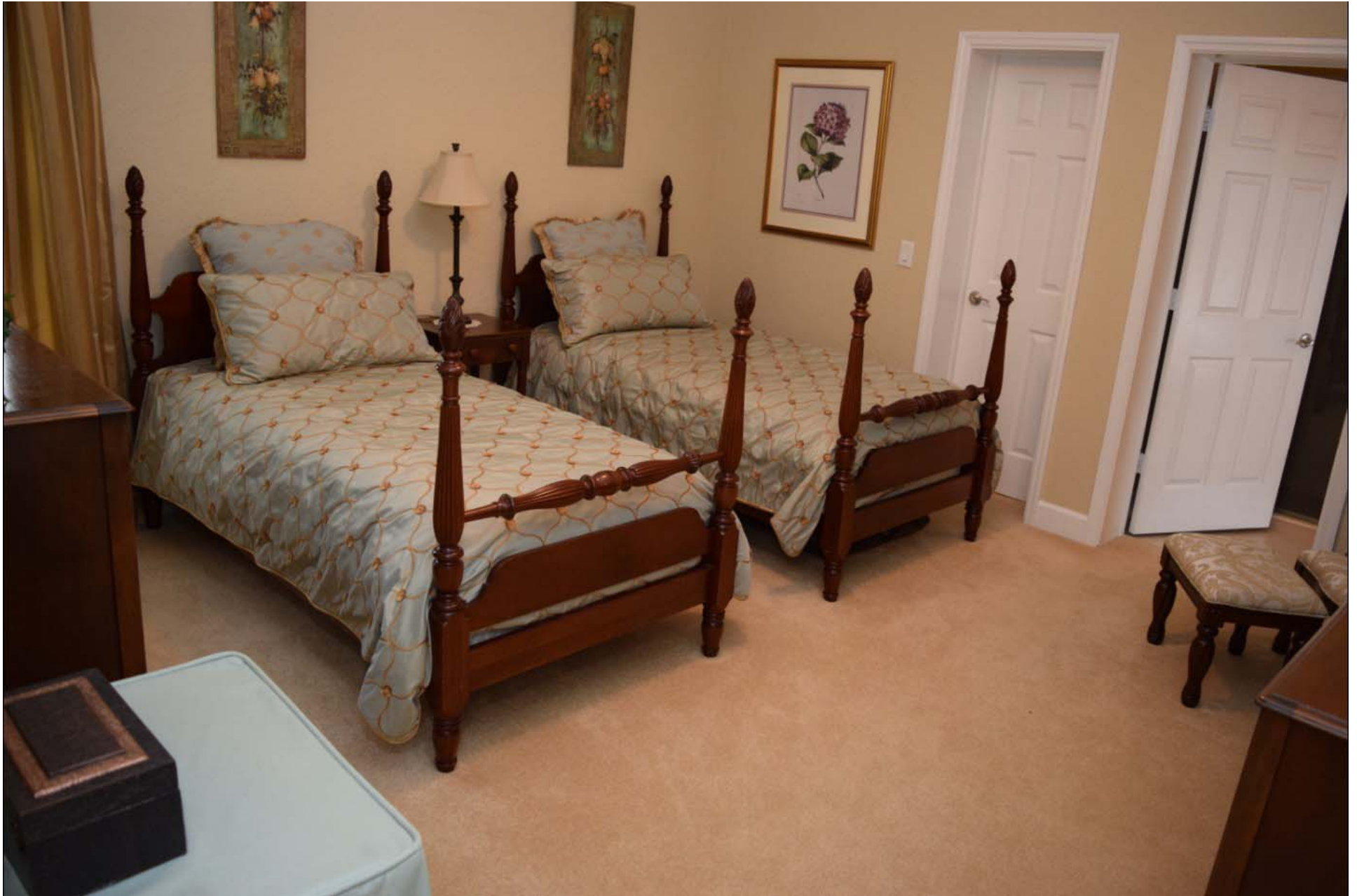
Bedroom 2 with walk-in-closet 14' x 14'