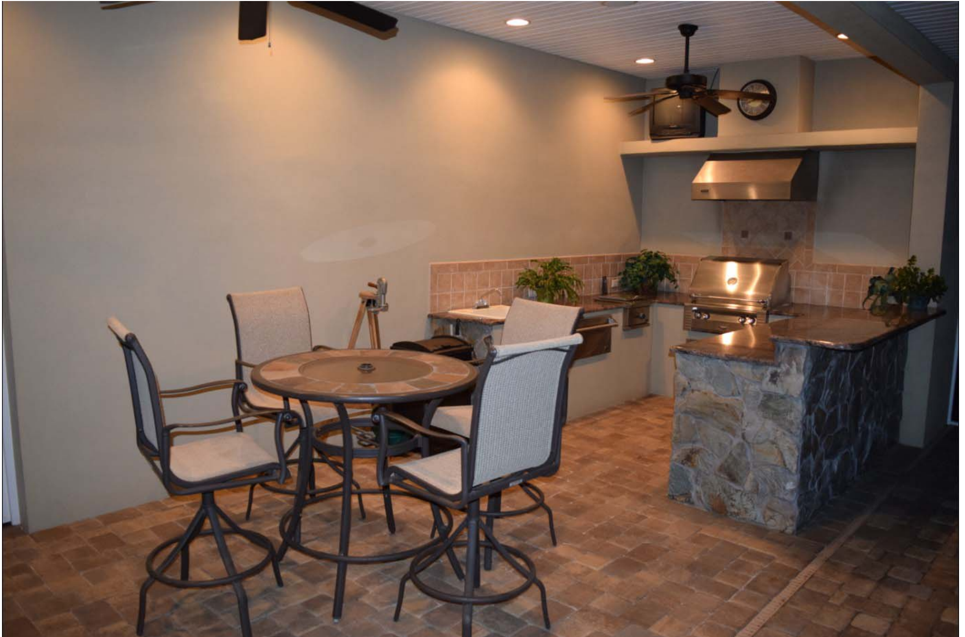
Outdoor Kitchen Cocktail Bar