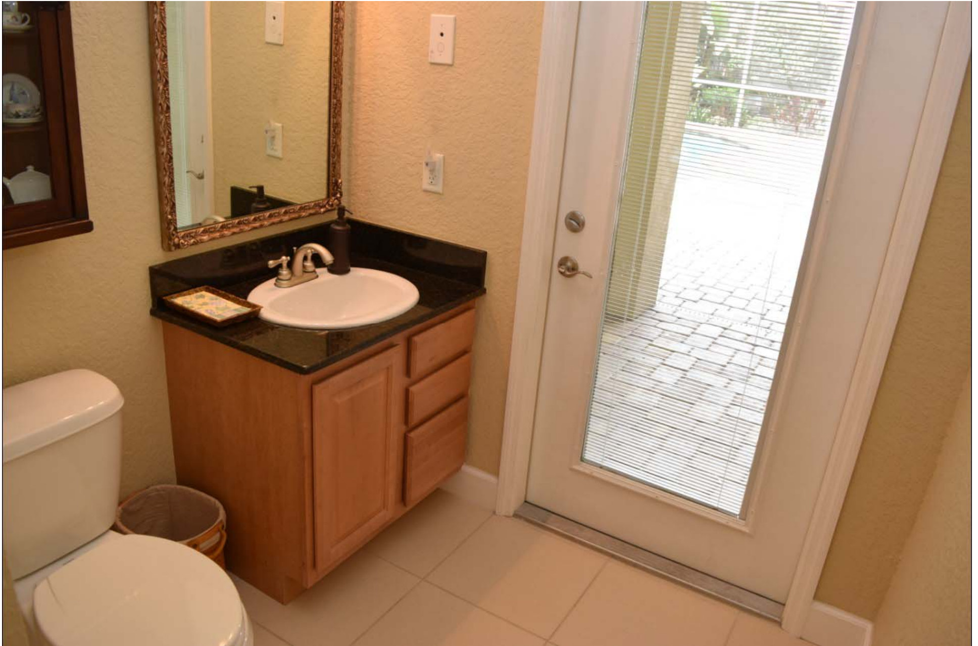
Bathroom 2 with shower (pool bath)